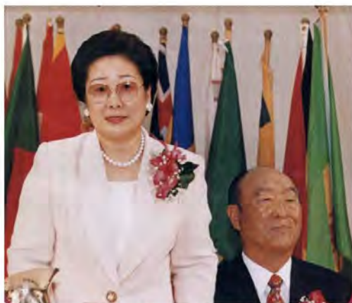
Mother and Father Moon 31st July 1996

The chronicle "40 Years in America" describes the event,