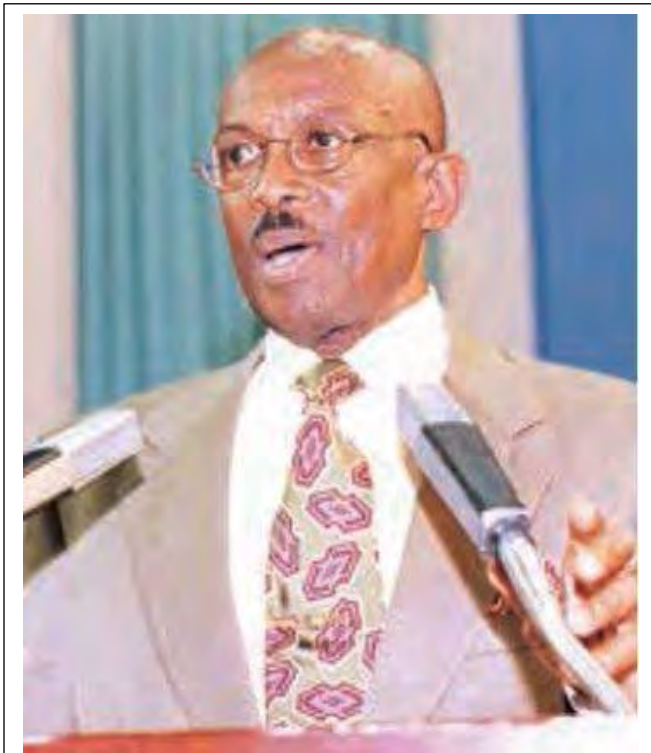
Hamilton Green 13th July 2003 in Cheonan

Hamilton Green, Prime Minister of Guyana 1985-1992, said in his congratulatory address,