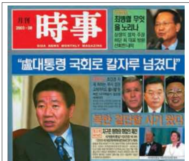
From the front page of August 2003 issue of Korean magazine Shisa News Monthly

We congratulate all the couples who took part in the 2003 Blessing ceremony 13th July 2003 in South Korea and other locations around the world, organised by the Family Federation (FFWPU). The main event was held in the large indoor arena Yu Gwan-sun gymnasium in Cheonan , a city of about 700 000 inhabitants, 85 km south of the capital Seoul. Father and Mother Moon officiated in Cheonan, where 3550 couples from many different countries participated, the majority from South Korea and Japan. Simultaneous events in different corners of the world were connected to the main ceremony in South Korea via satellite and internet, so that according to the organizers altogether 30,000 couples received the Blessing on their marriage.