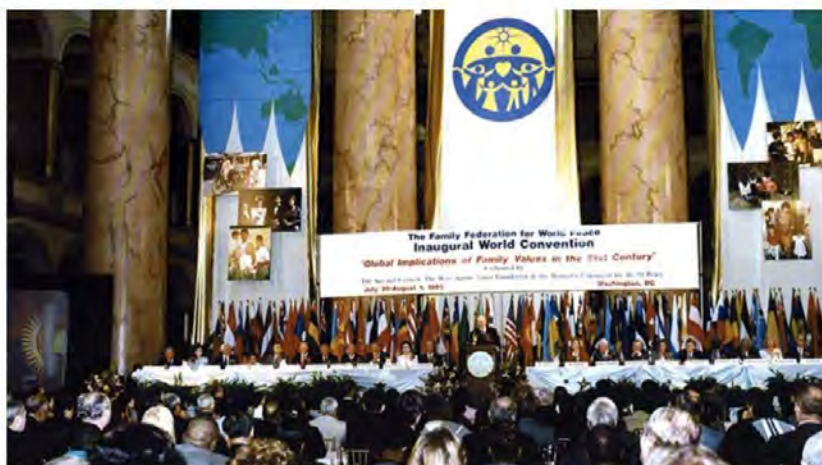
The Inaugural World Convention of the Family Federation 31st July 1996

Moon spoke without a script at the closing banquet the following day, 1st August, at the Sheraton Washington Hotel. His speech was titled "In Search of the Origin of the Universe".