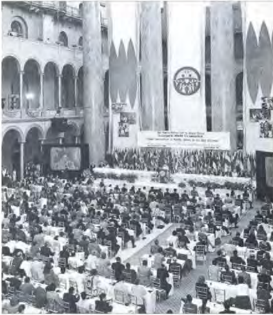
From the Inaugural Convention 31st July 1996.