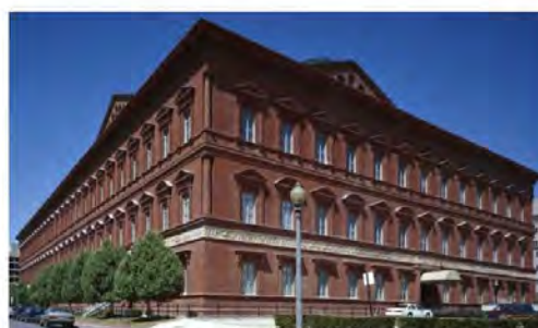
National Building Museum, Washington DC. Public domain image. Cropped

I sound a bit like an Old Testament prophet, it's because there is nothing about which I feel more strongly, more deeply, than the survival and the strengthening of the family. No civilization that neglects the family, can be called civilized for long, and no political philosophy that takes the family for granted, will be taken seriously by anyone who values morality, compassion and peace."