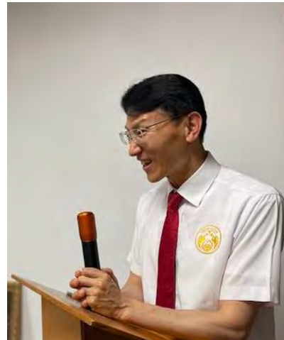
Lecturing on CheonBo Providence