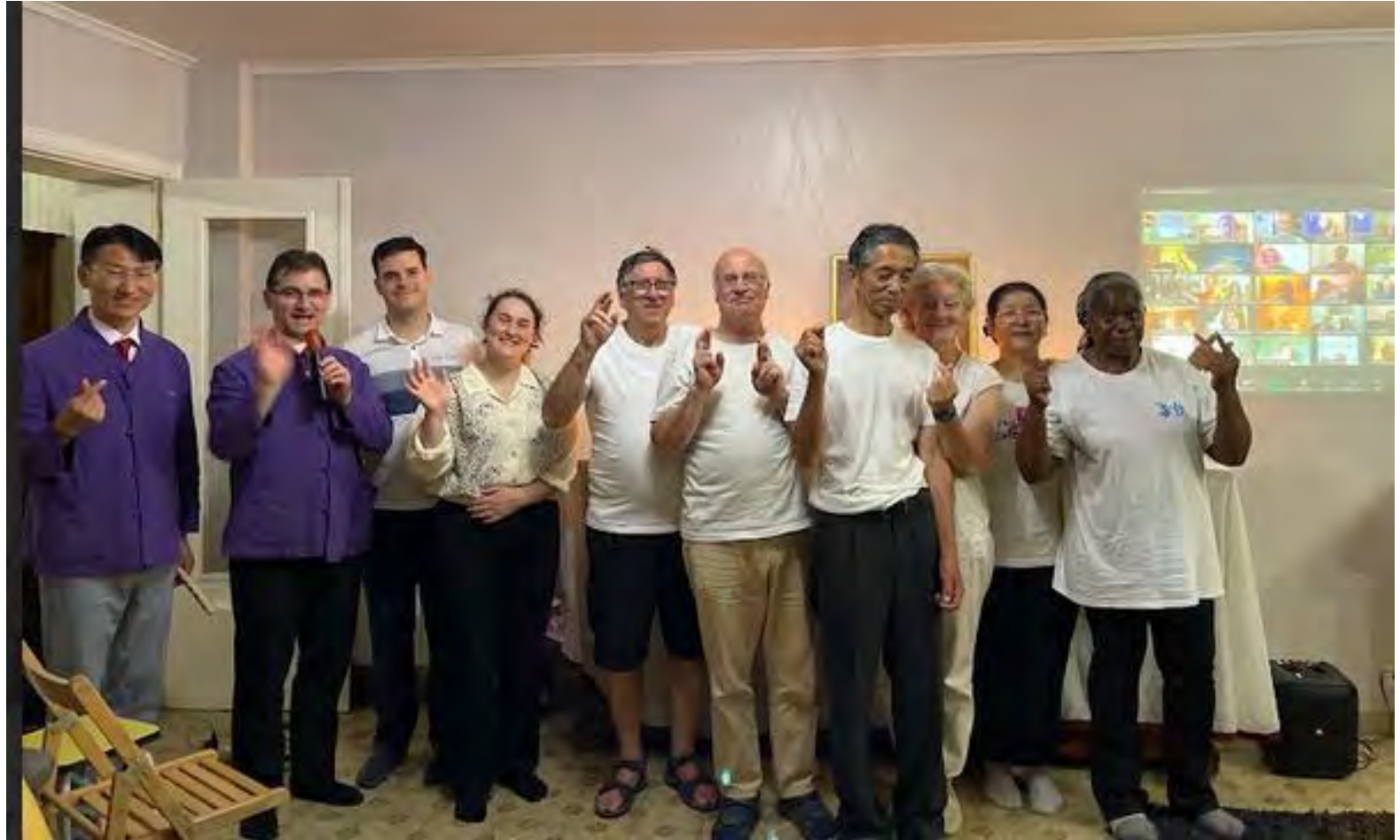
Group photo with EUME online participants after the vigil prayer