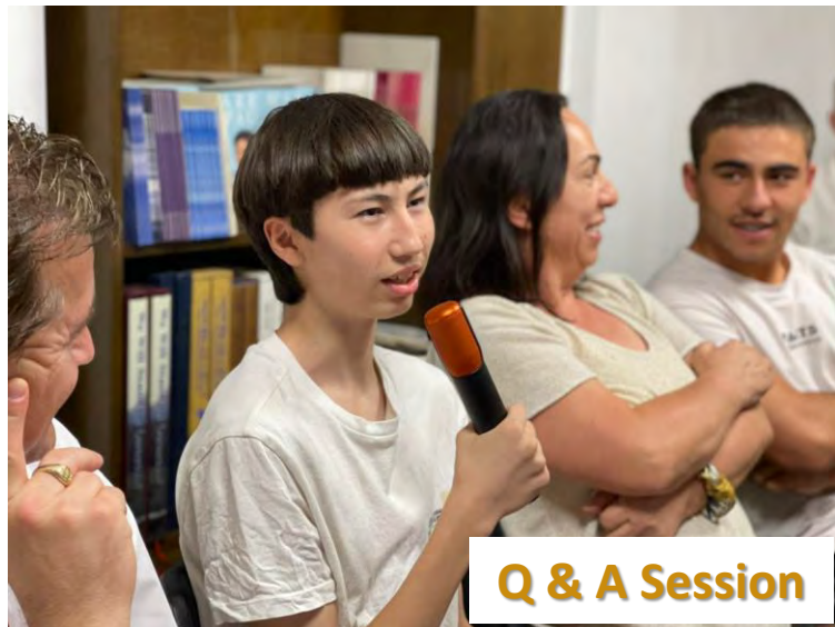
Q & A Session