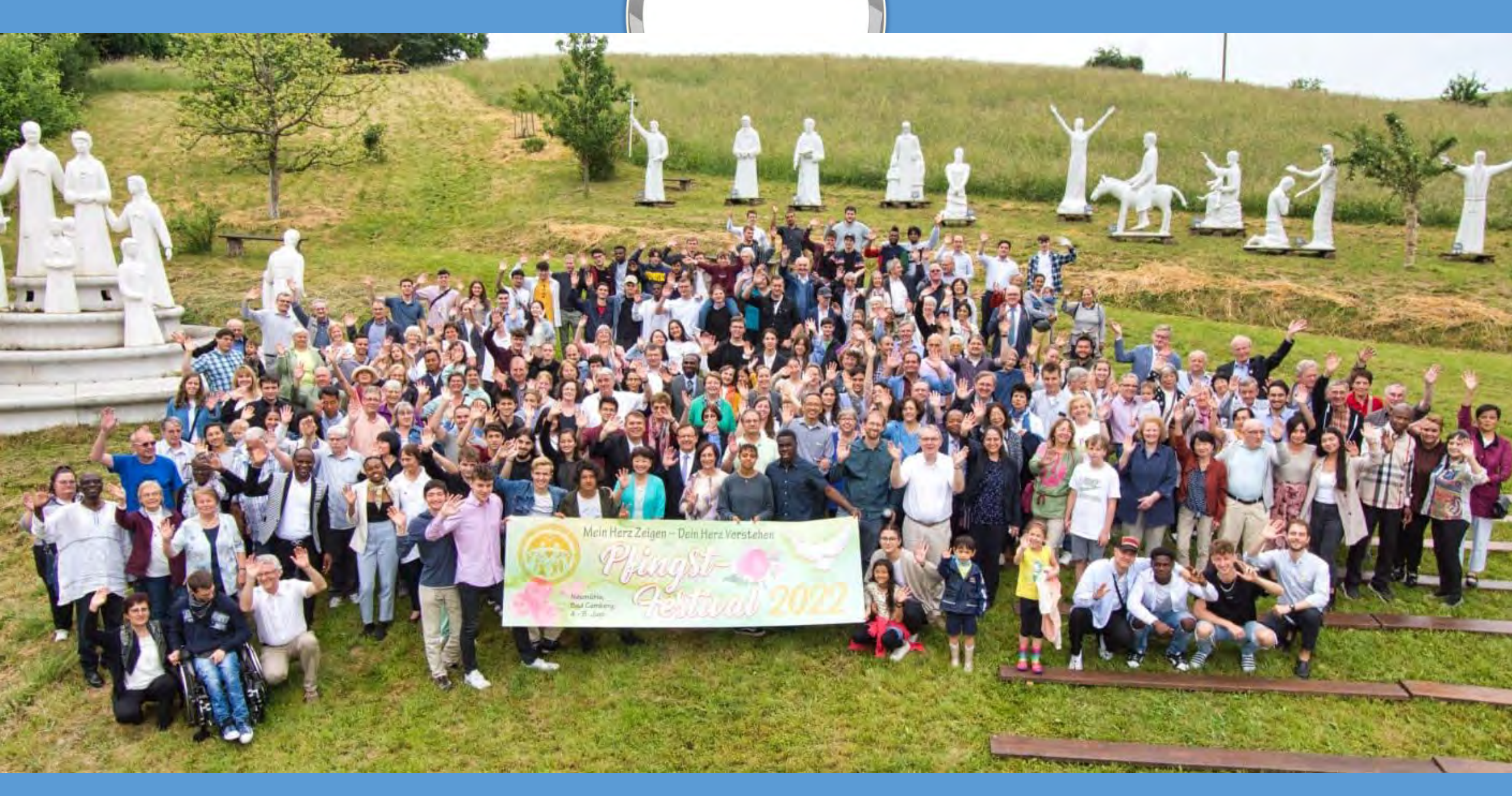
Pentecost Festival in Camberg, Germany