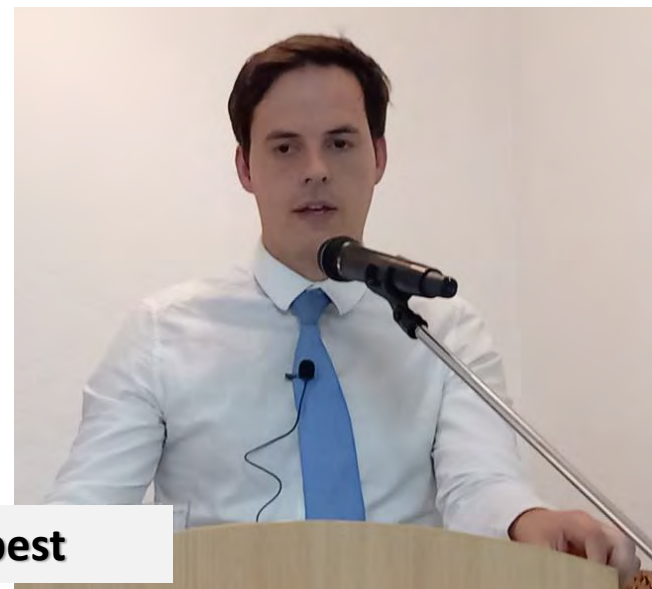
Hyojeong Testimonies - Budapest