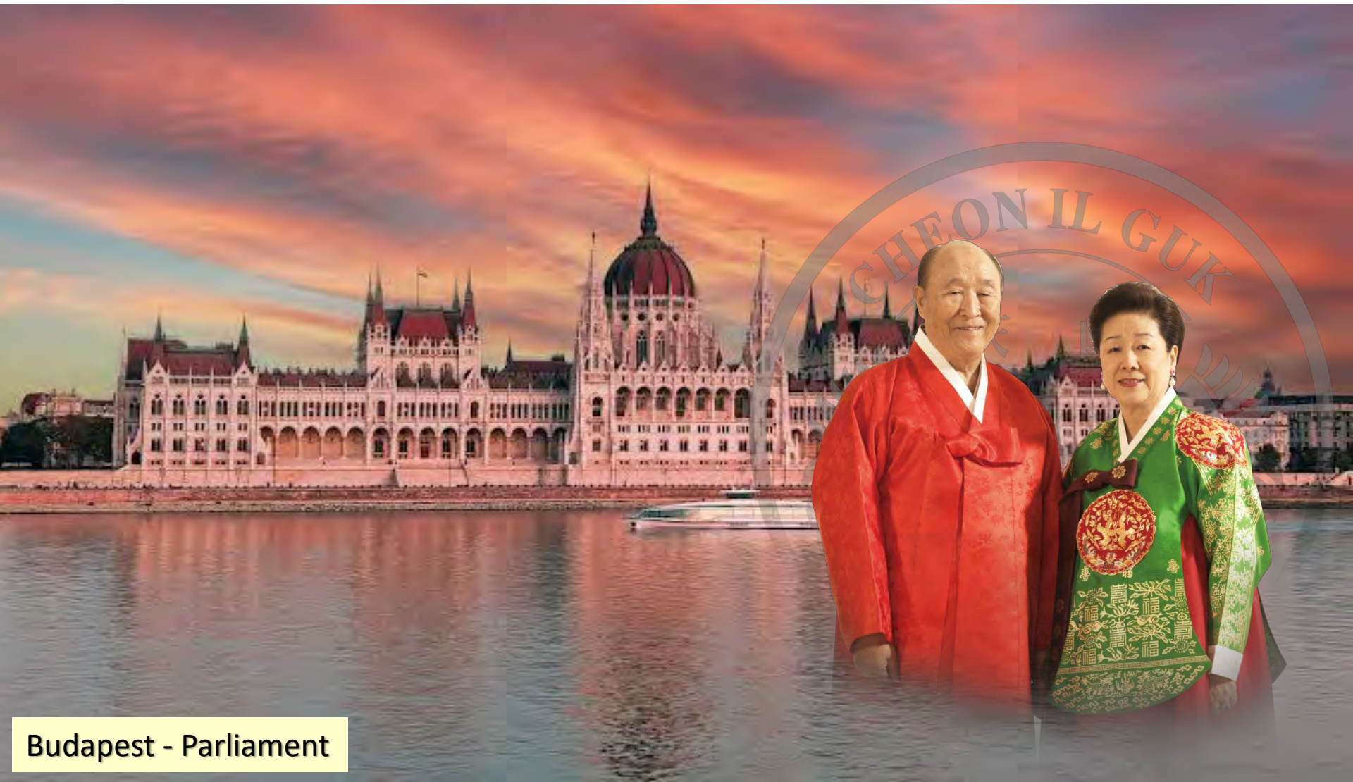
Budapest - Parliament