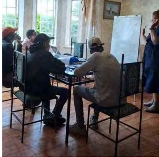
Slovo Study Group during boot camp, getting support with their maths and science

The Slovo Study Group are currently focussing on preparing to run another boot camp, for which they will need funding to pay for venue, tutors and food.