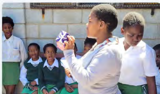
Fighting Period Poverty