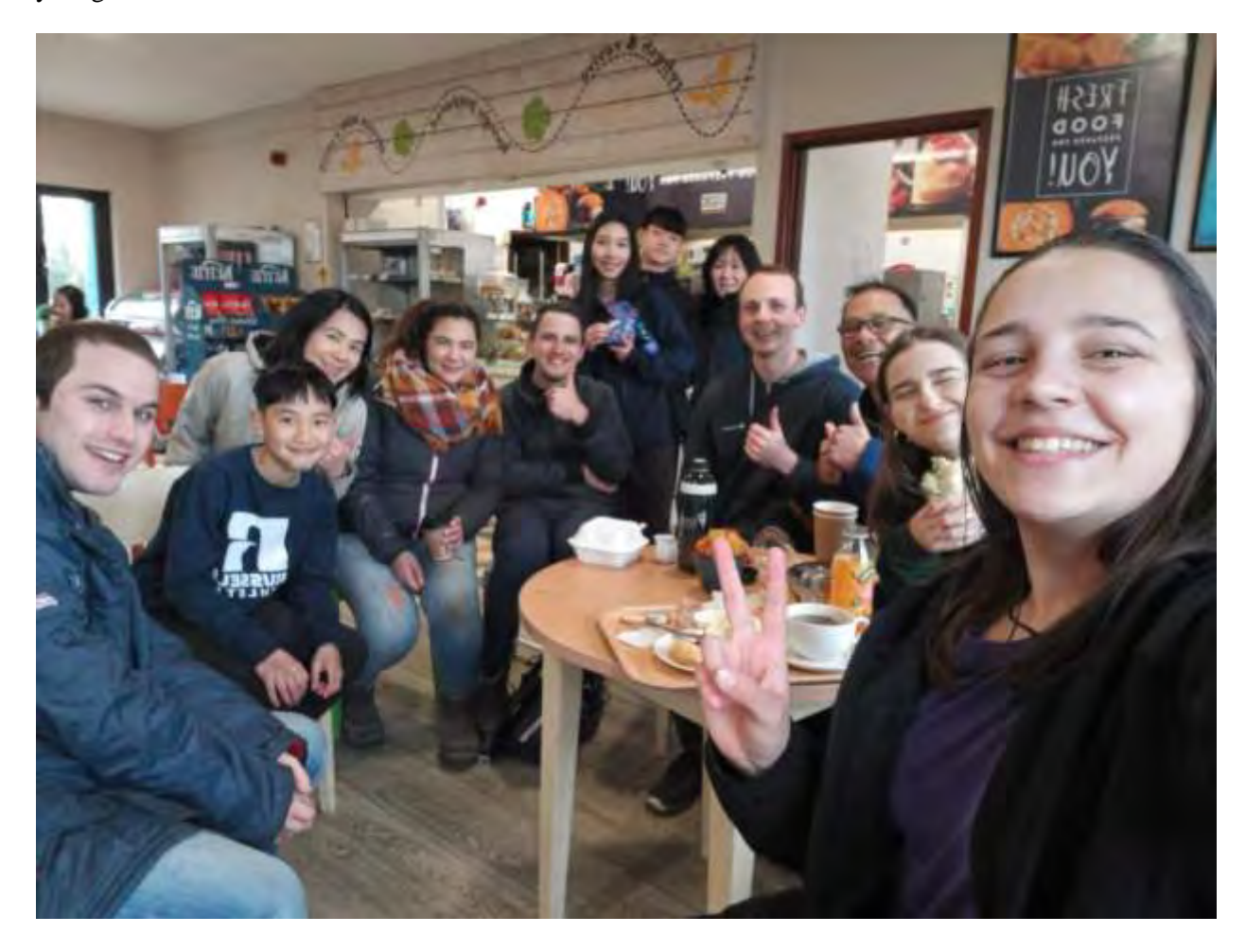
On Saturday the 25th, a group of members of our WWW and River South communities participated in a Service Project organised by Youth and Students for Peace UK (YSP UK) in partnership with Cosmeston