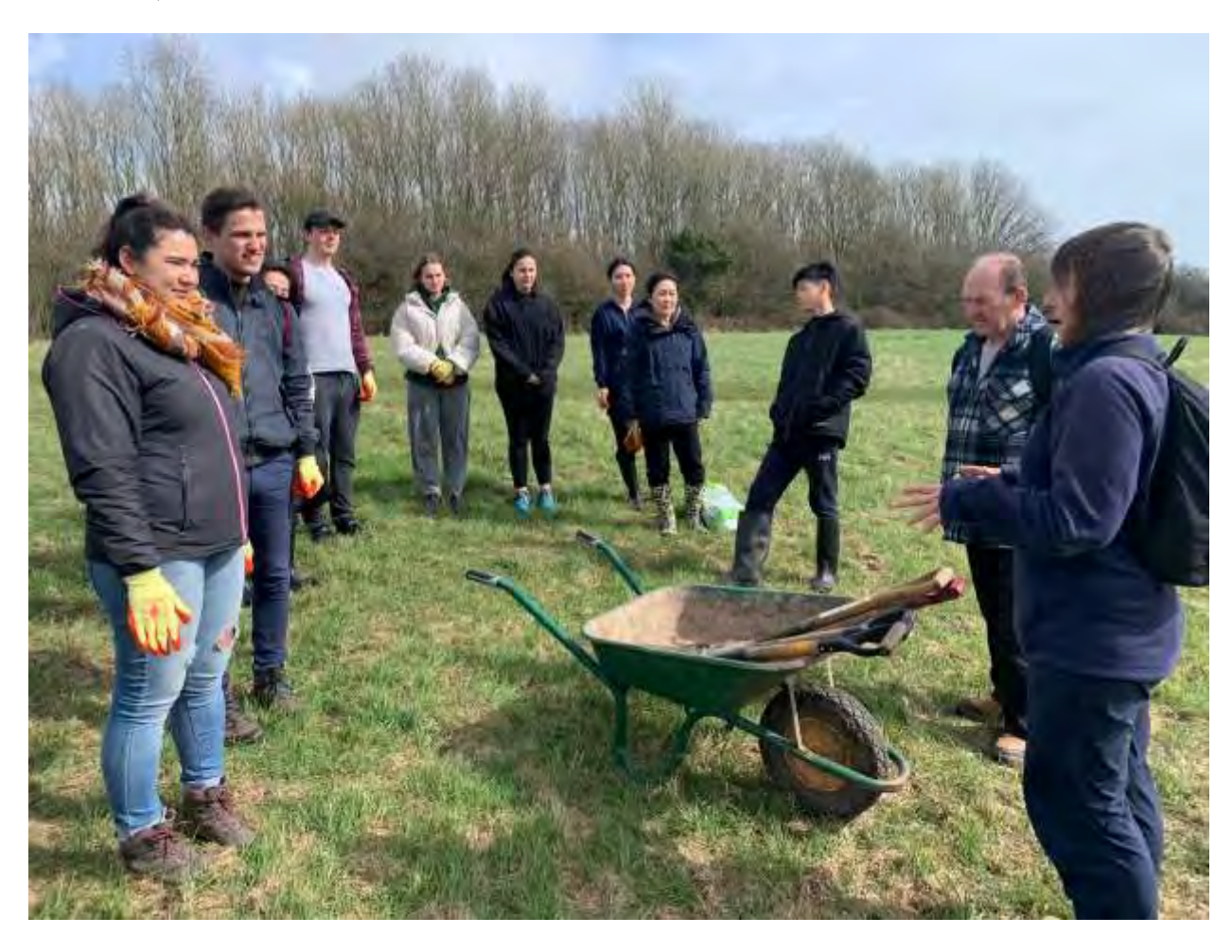
YSP UK held its second Service Project with Cosmeston Lake this past weekend, relocating over 200 young trees.