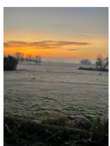
First morning at Cleeve House watching the sun rise over the frosted fields.

Crucially it was not going to be reliant on my wife and my family supporting me and they would not have to come along for the journey. This was something I would take responsibility for, even if it meant going on my own and coming back to London at