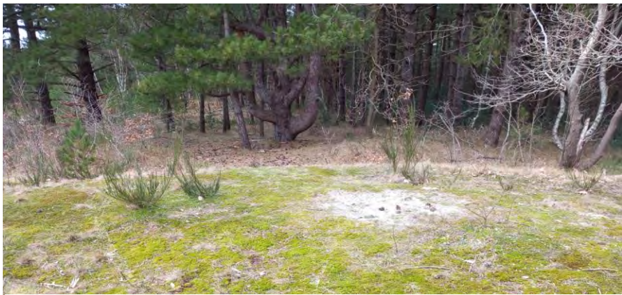
The Holy Ground next to the Glory House