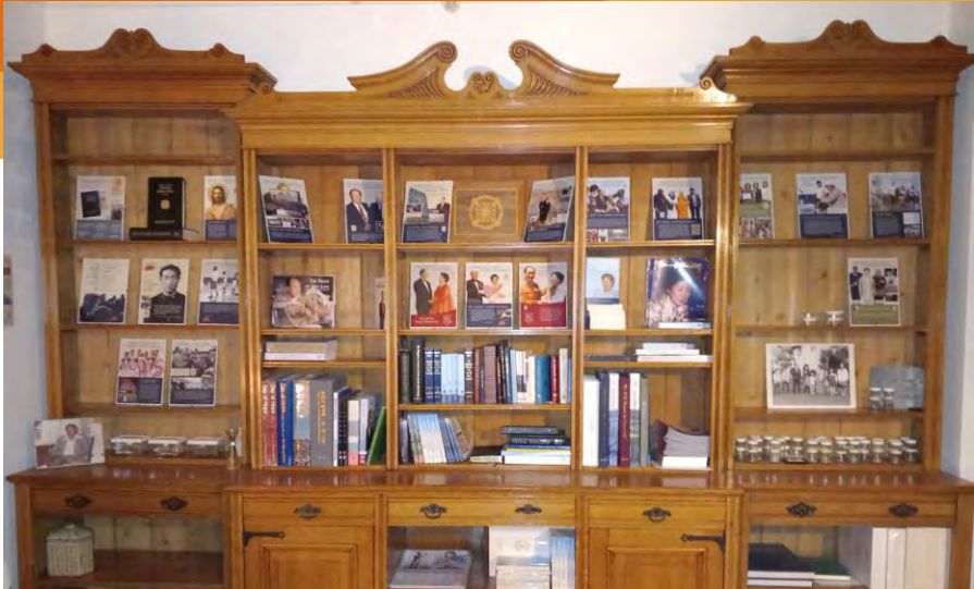
Green memories about the True Parents' visit in Glory House