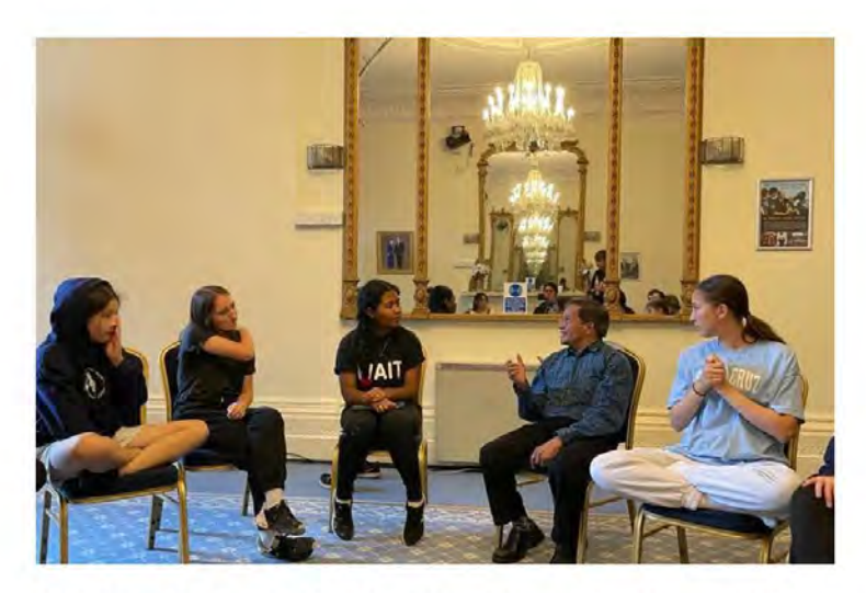
WAIT Kicks Off The Academic Year With A Workshop!

Looking back to the summer of workshops, ESGD want to share some reflections and reports about what was experienced and created together. This year, we