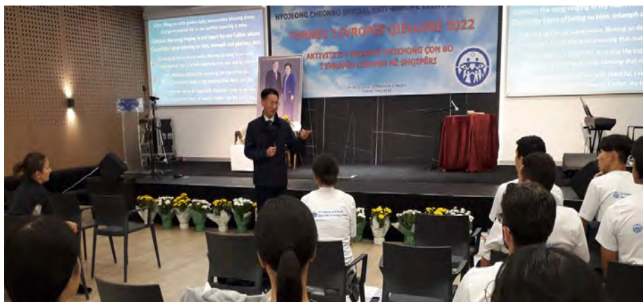
Youth sharing with Prs. Moon