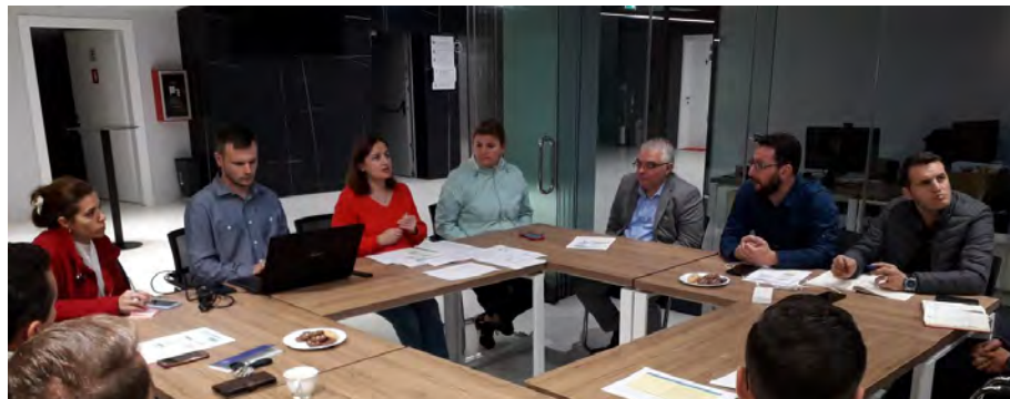
Preparatory meeting with Local Staff