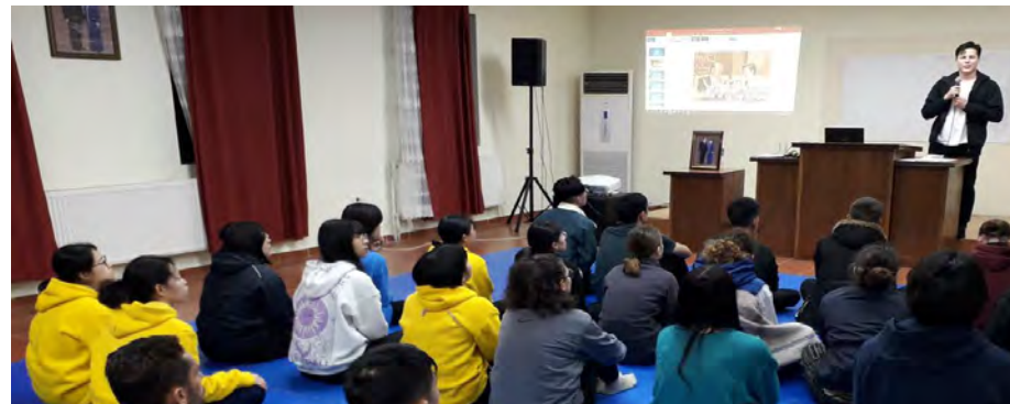
HDH meetings to offer jeongseong