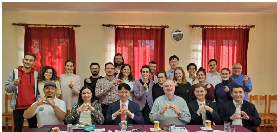
Evaluation meeting of the CheonBo Event