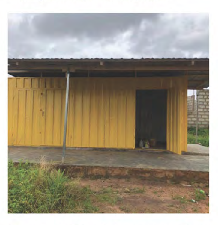
Another £1,000 will be sent shortly to progress the project.

In the meantime, they are planning to buy sewing machines and materials, not only to train young women in pastries, cake decoration, bread making and dressmaking this time but also to start making renewable sanitary pads.