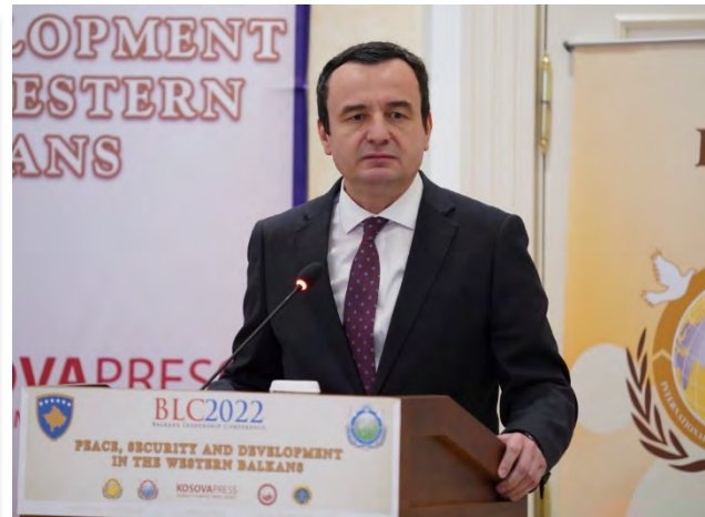
Prime Minister Albin Kurti