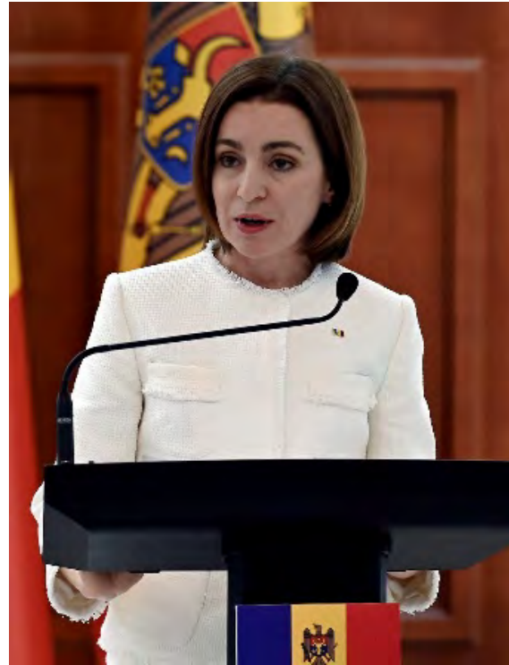
President Maia Sandu