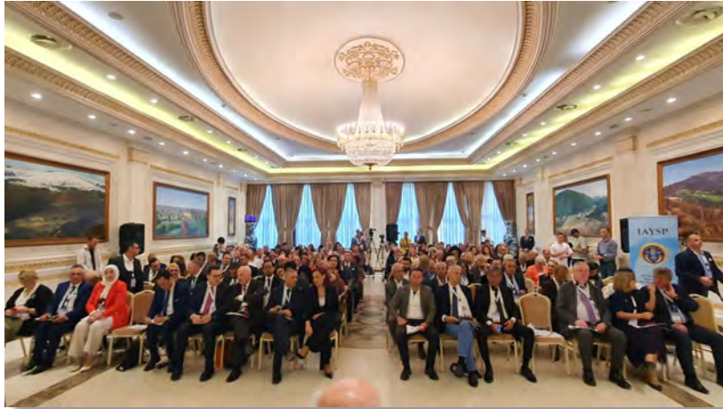
Participants at Swiss Diamond Hotel, Pristina