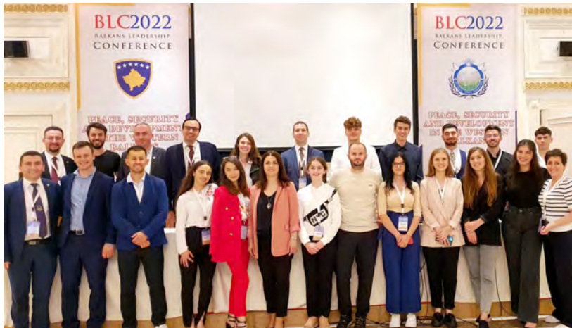
Kosovan and Albanian Staff