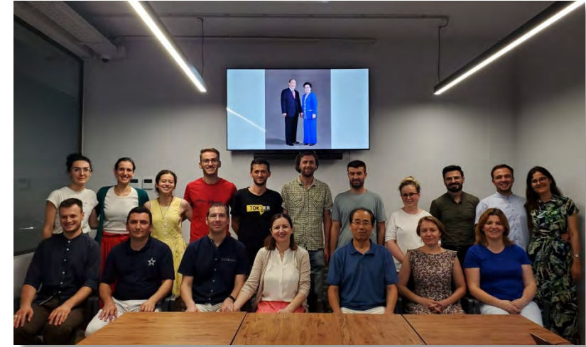
Albanian leaders meet at Peace Embassy.