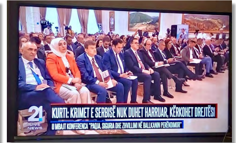
Live TV Coverage