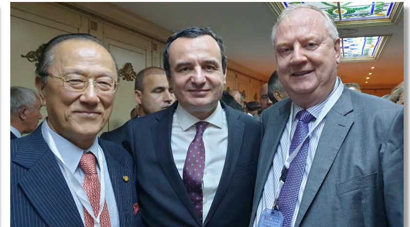
With Prime Minister Kurti

A Balkans Leadership Conference was held in Pristina, Kosovo, under the theme “Peace, Security and Development in the Western Balkans.” The conference was held at Pristina’s Swiss Diamond Hotel on 11 June under the auspices of the Kosovan Government and the direct care of Prime Minister Albin Kurti. There were about 250 participants from 14 nations. The conference was broadcast live by the KosovaPress news agency, the partner in organising the conference, and many other media and TV channels.