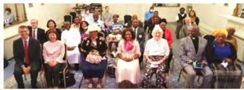
BCLC - British Clergy Leadership Conference London, UK, September 12, 2020