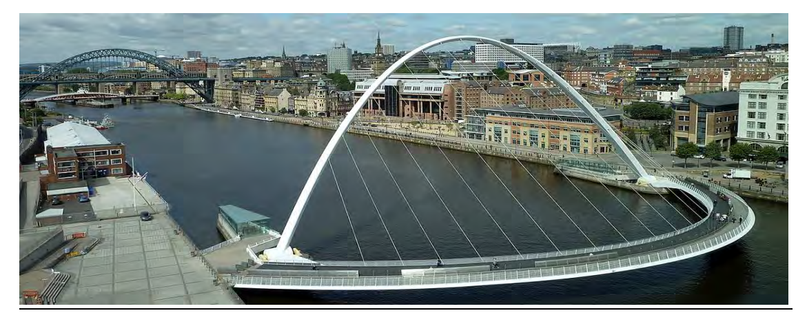
Peace Road Newcastle will cross the Tyne several times before heading to Wallsend

It's a little known fact, but the name "Hadrian" is actually a typo – originally it was "HadRain!" A joke, but not really. Better come prepared for wet weather.