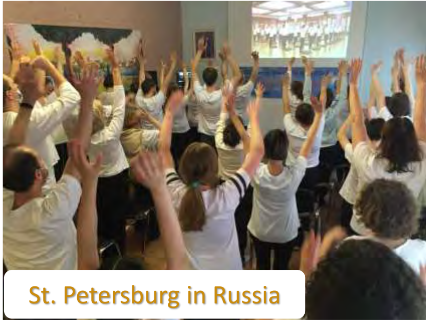
St. Petersburg in Russia