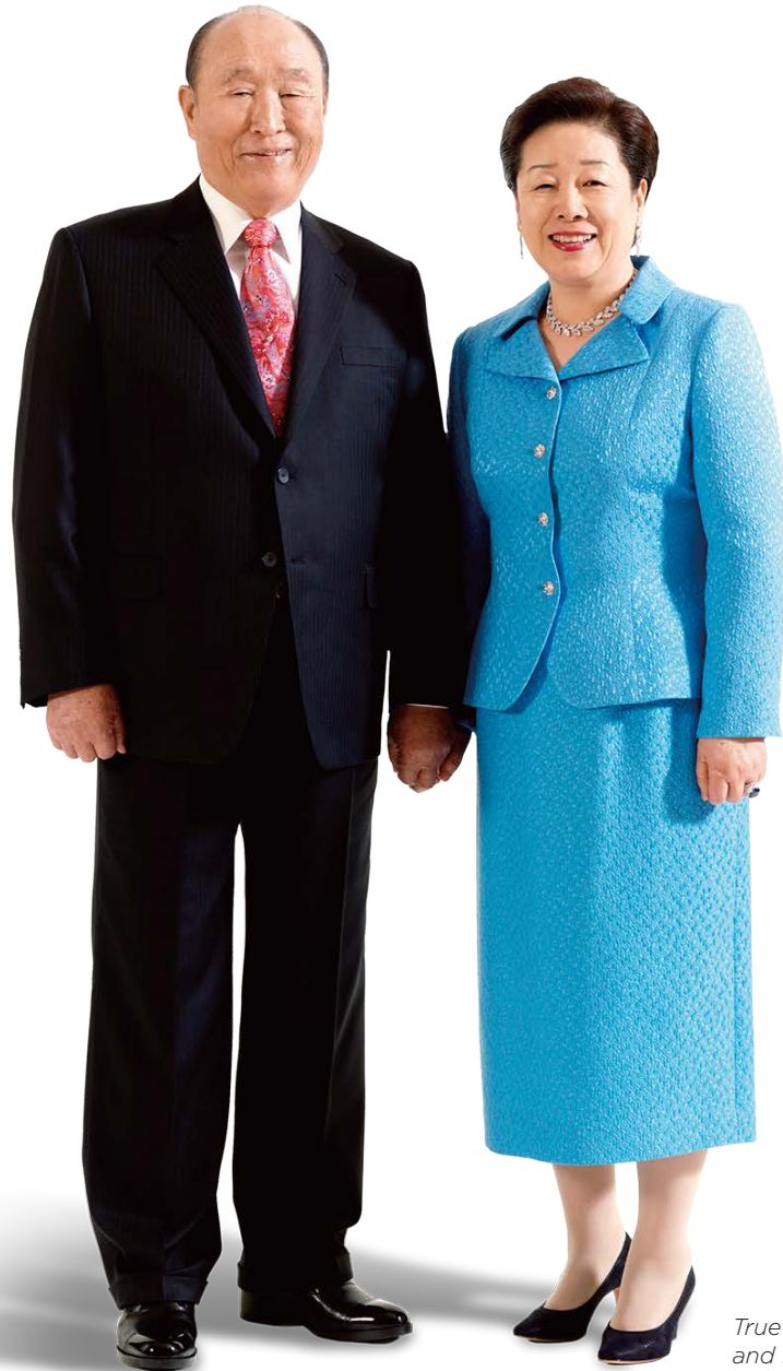
True Parents, Rev. Sun Myung Moon and Dr. Hak Ja Han Moon

“ America must return to the true founding spirit of the nation, to the ideals that her ancestors sought to establish with sweat and blood. America must return to Godism, an absolutely God-centered ideology.