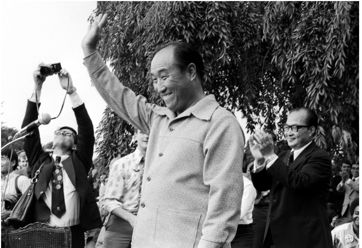
Victory! The celebration at Belvedere after the event