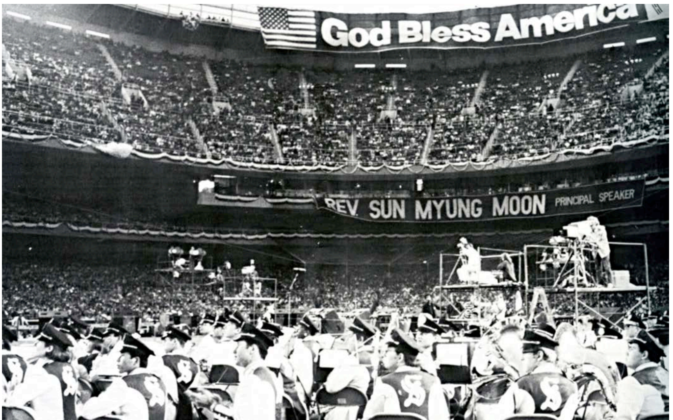
The brass band and audience