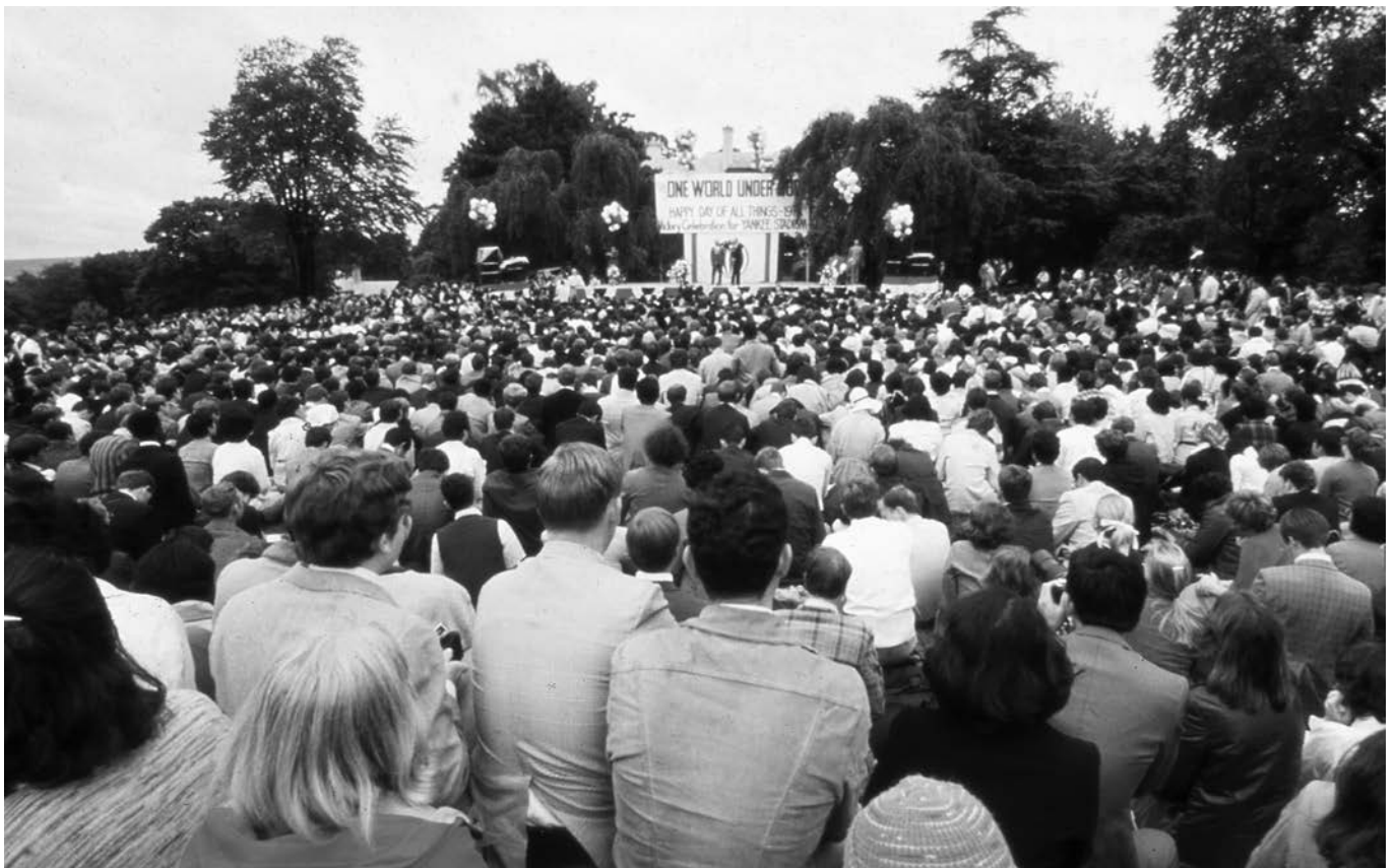
Day of All True Things and Victory celebrations at Belvedere