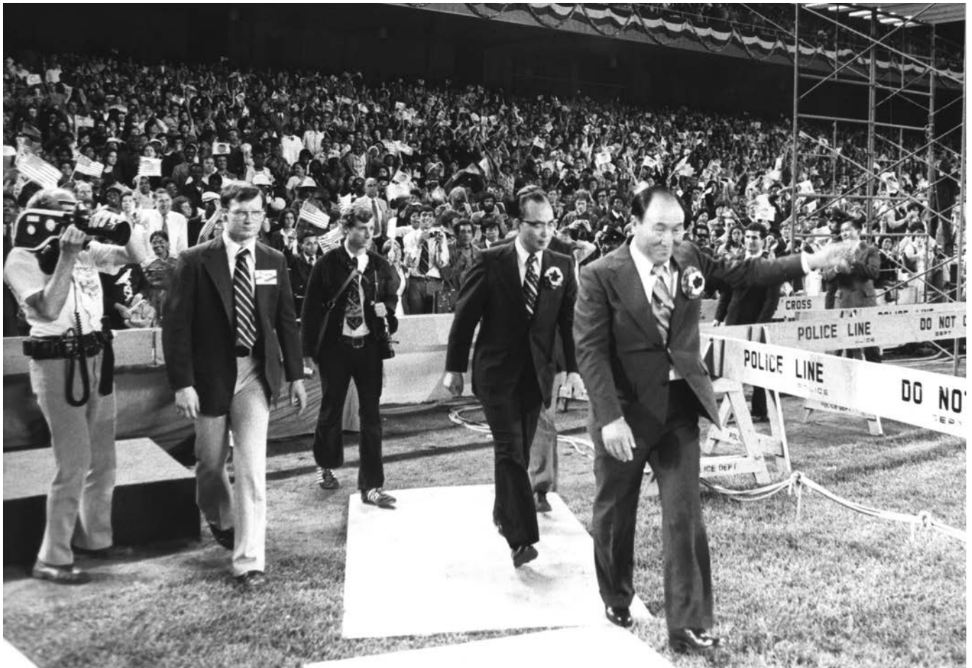
Rev. Moon approaches the stage at Yankee Stadium