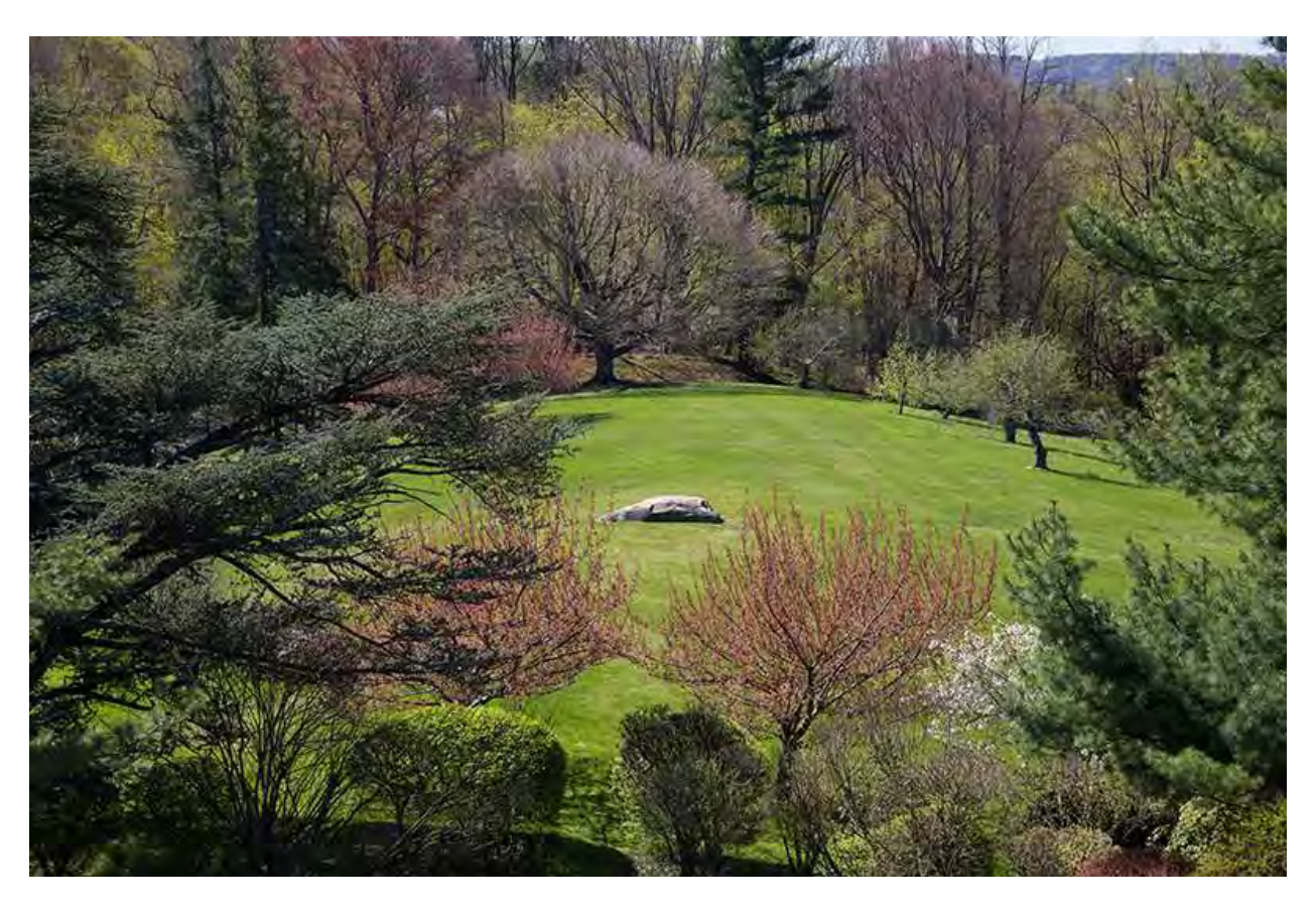
The Holy (Prayer) Rock

The Holy Rock behind the main house was consecrated by True Father on January 7, 1973, and is recognized as one of the most sacred Holy Grounds in the entire Unification movement.