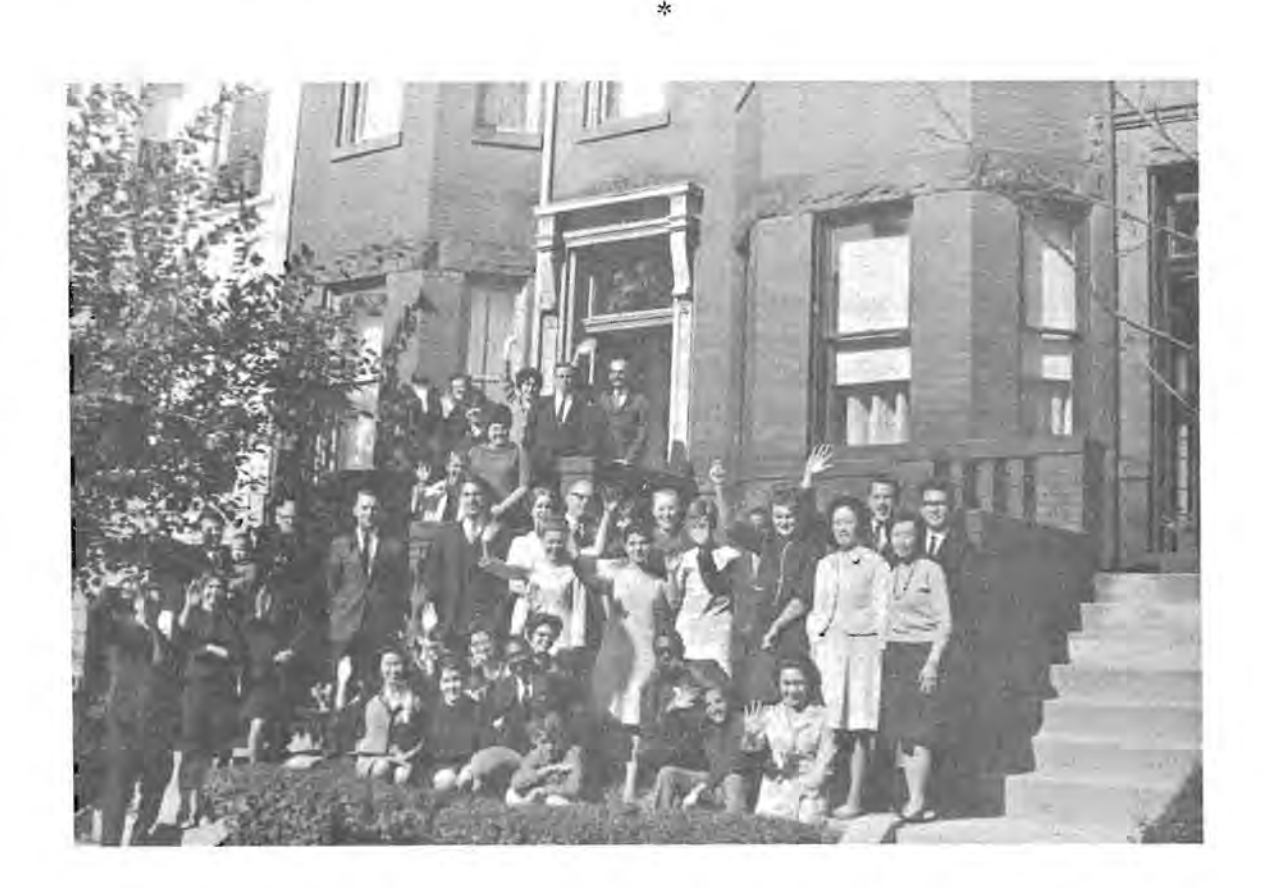
CHILDREN'S DAY IN WASHINGTON, D. C. (See caption on following page.)