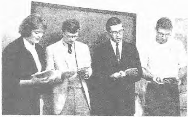
PHOENIX FAMILY HARMONY