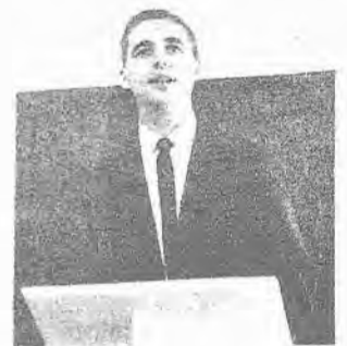
LOWELL - S.F. REPORT