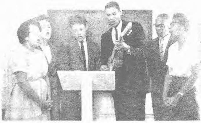
"EVERY TIME I FEEL THE SPIRIT--"