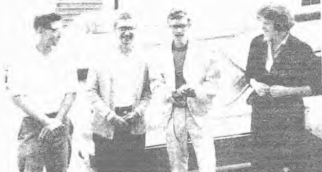
PREPARING TO LEAVE ----