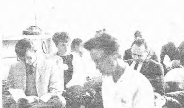
"LET'S SING NO. 26"