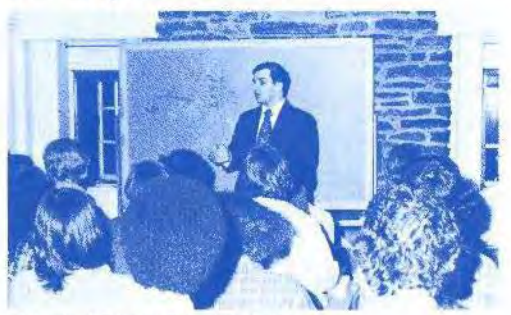
A typical Divine Principle lecture

The essential doctrine of the Church is called the Divine Principle. It teaches that God originally intended an ideal world of creation, but because of the fall of the first human ancestors this world has never been realized. History is consequently viewed as a restoration process to realize the world of God's original desire, the Kingdom of God on earth. The present time is seen as one of the most crucial in man's history, one where we must look for God's intervention in human affairs to help us solve the global crises we face.