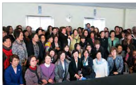
CSW59 WFWPI Luncheon attendees.