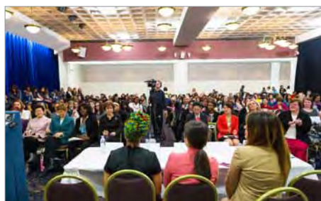
Audience "Young Women and Leadership: Education, Opportunities and Obstacles."