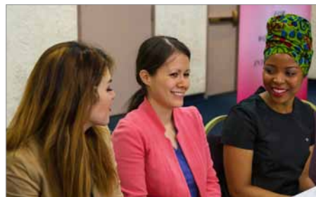
Relaxed Moment - CSW 59 WFWPI Panel Speakers.