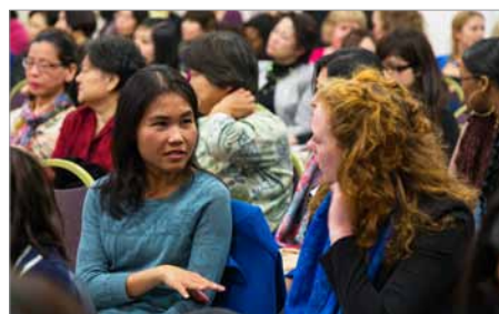
Participants during a 3 minute pair-share interactive break.