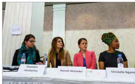
CSW 59 Speaker Panel on the theme "Young Women and Leadership: Education, Opportunities and Obstacles."