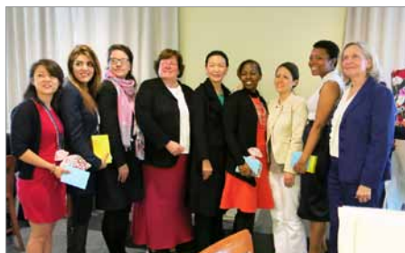
WFWPI Leadership with WFWPI parallel event speakers and moderators at CSW59.