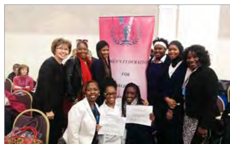
Frederick Douglass High Student Delegation.