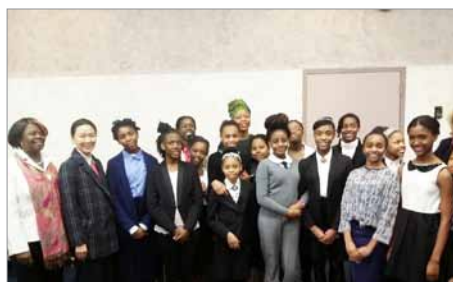
M.A.C.A.D.E.M.Y Student Delegation.