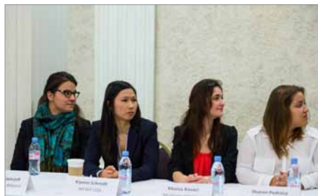
WFWPI CSW 59 Parallel Event Co-Sponsors: World Youth Alliance Foundation, WFWP USA, Montage Initiative.