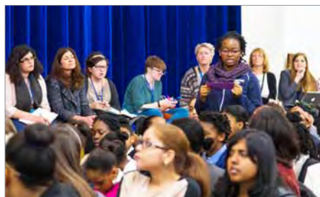
Student asking the panelists a question following their presentations.