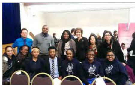
North Star Academy High School Student Delegation.