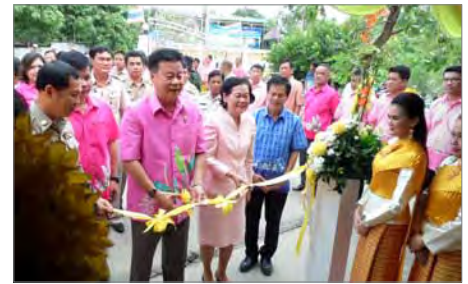
Governor of Saraburi Prov., Hon. Wichien Puttiwinyu, presided over the commemoration of Int'l Women's Day.