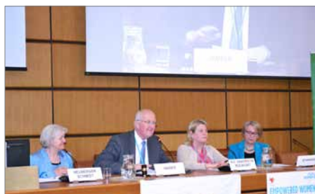
Session IV with the Ambassador of Costa Rica.

impressive, including : Stop the segregation of young people from adults and strengthen relationship between youth and decision-makers on all levels; and a systematic inclusion of ethical, non-formal, spiritual education to foster a culture of tolerance and respect.