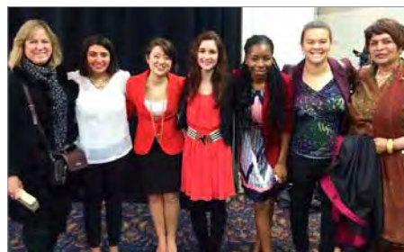
Montage Initiative President and Student Advisory Board along with WFWPI UN Office team.