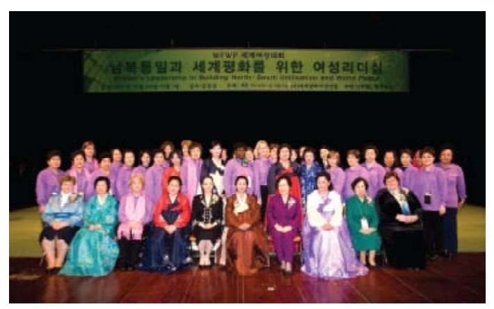
WFWPI Representatives with the Delegation from the North October 30, 2007 Mt. Kumgang, North Korea

South and North Korea • Oct 28-Nov 1, 2007 •