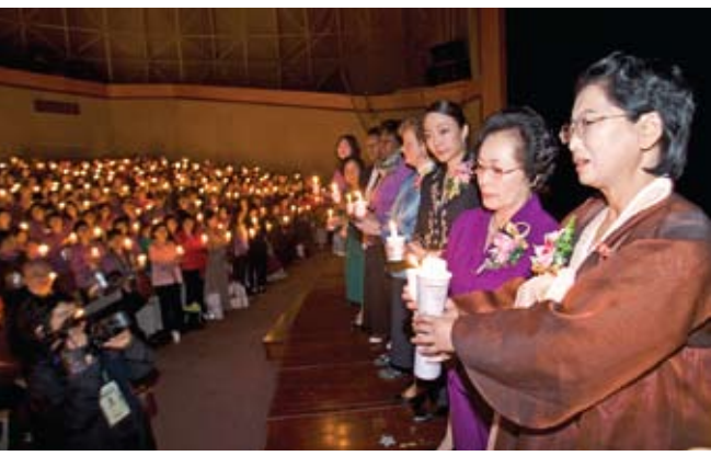
Candlelight Ceremony for Unification, Mt. Kumgang Convention October 30, 2007 Mt. Kumgang, North Korea