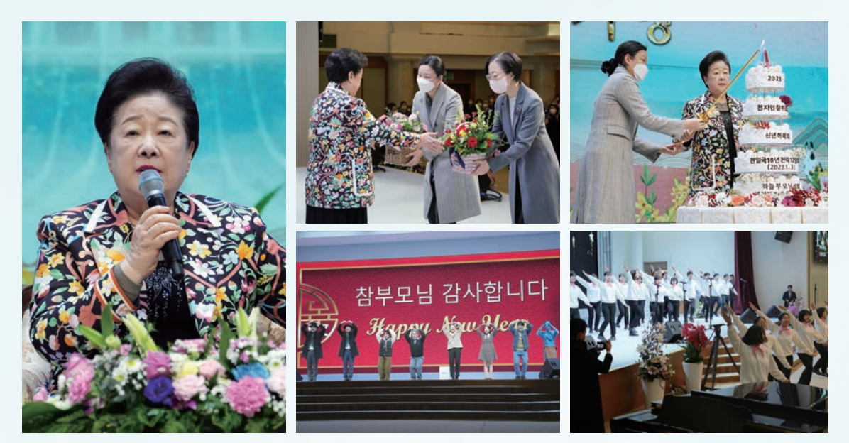
(from the top) True Mother's speaks to the leaders, Presentation of flowers, Cake cutting, Hyojeong cultural performance