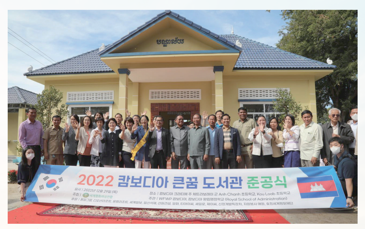
Ceremony for Completing Construction of the Great Dream Library

Finally, WFWP stated, "We will continue to keep our relationship with Cambodia to provide equal educational opportunities and raise future leaders within the youth in Cambodia." 7