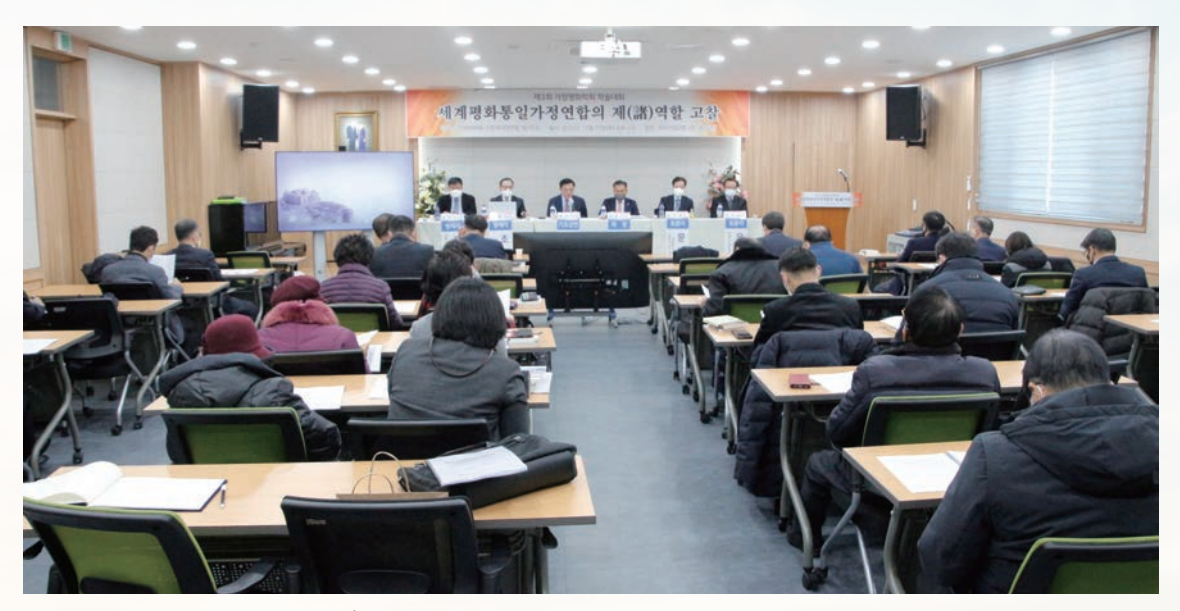
3rd Family Peace Society Academic Conference

The presenters, panel members, and conference participants engaged in a wide-ranging discussion on the mission and role of the Family Federation in establishing a heavenly unified Korea. This was followed by discussion and Q and A exploring how to minimize conflict in the family and build healthy families that can contribute to a healthy society by utilizing family theology, the True Family Movement, and hyojeong culture. \mathcal{P}