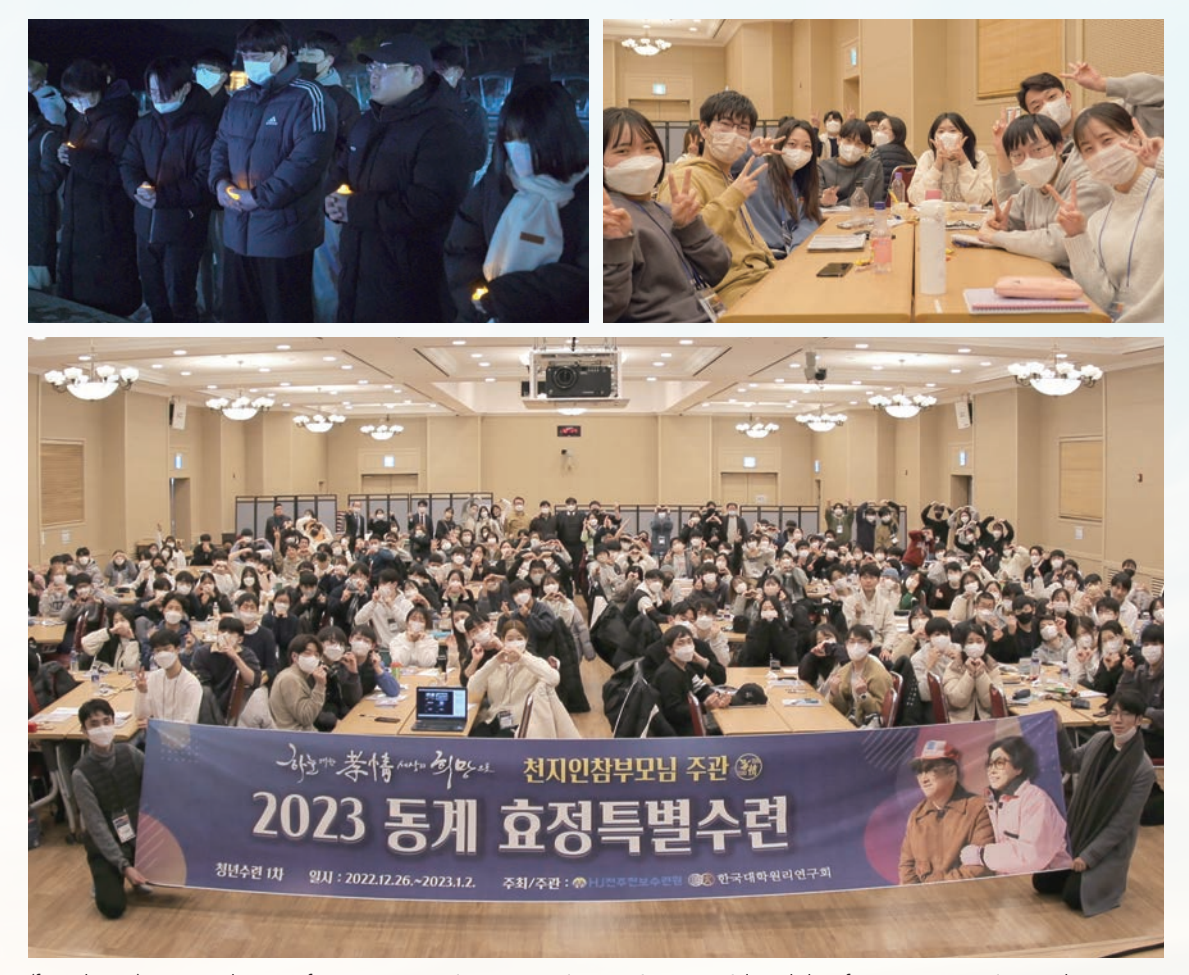
(from the top) Prayer at the Tree of Love, Team meetings, 2023 Winter Hyojeong Special Workshop for Future Generation Youth, Commemorative Photo

The 206 Korean and Japanese youth who attended the workshop developed their hearts of hyojeong. As the workshop ended, they all pledged to devote themselves with warm love and passion to becoming one with True Parents' current providence. \mathcal{P}