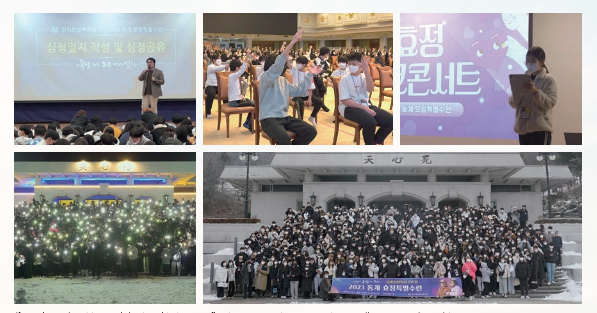
(from the top) Writing and sharing shimjeong reflections, Entertainment, Hyojeong Talk Concert, Cheonshim Won prayer, 2023 Winter Hyojeong Special Workshop for Future Generation Youth, Commemorative Photo

The Seonghwa students resolved many issues and worries about their faith and points in the Divine Principle that they had not understood fully and offered their determination to attend Heavenly Parent and True Parents with a heart of hyojeong and to do their best to live their lives as exemplary next generation leaders. \mathcal{P}