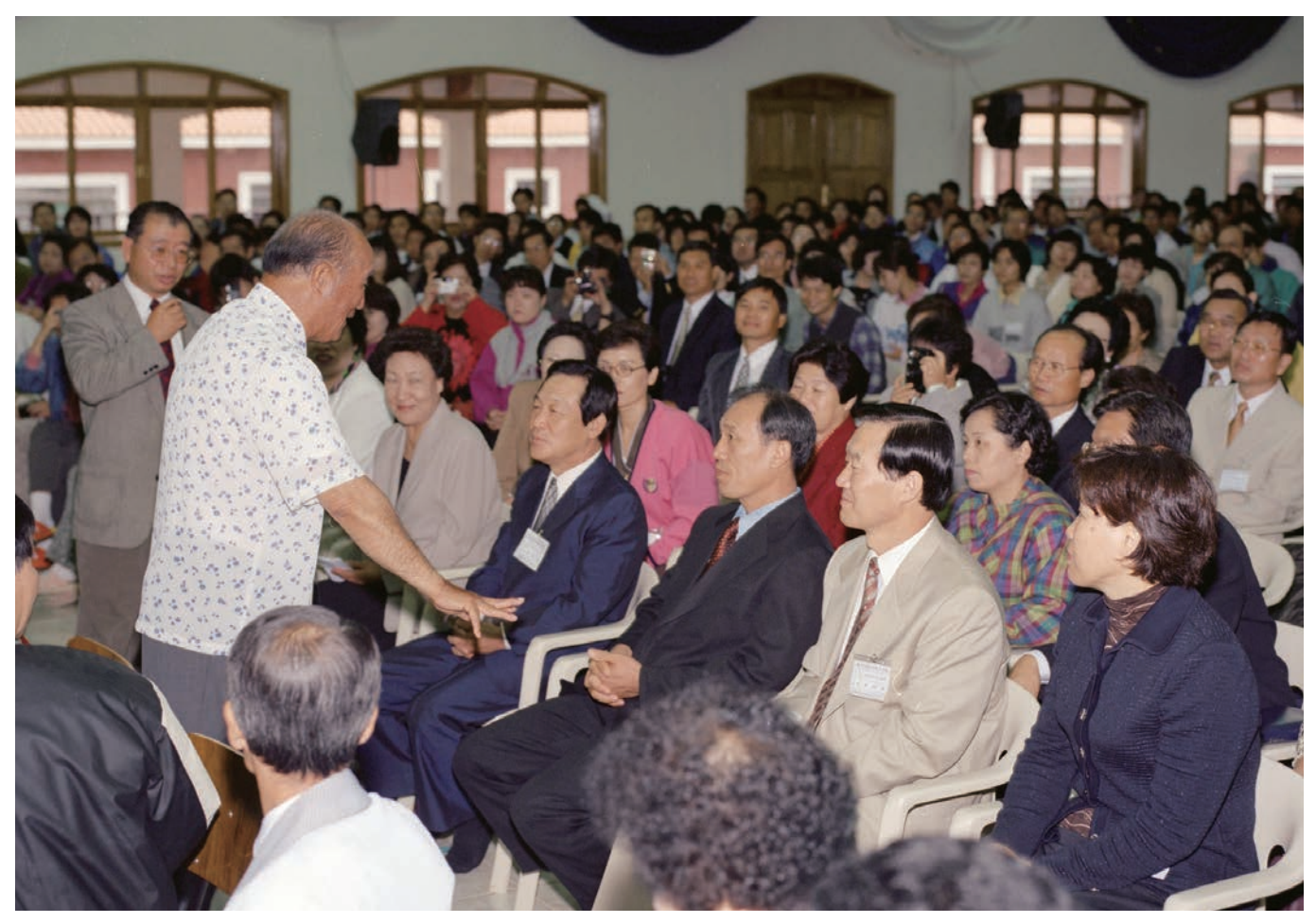
True Father talking to very attentive members

position where you can relate to the love of the entire universe. (82-276, 1976.2.1)