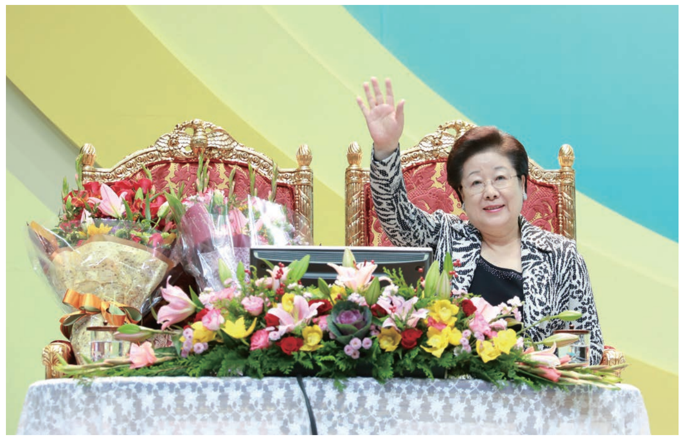
True Mother at a joint worship service for members Korea-wide for Victory on Foundation Day (11 Nov 2012, [9.28 HC], CheongShim Peace World Center)

he Unification Church originated from divine spirit and truth. The years have passed, our church has grown, and our members have matured, based upon a truly loving heart. In the beginning, when Father was ministering, whenever members came to the church, they never wanted to leave. They wanted to stay with True Parents, even if it meant staying up all night. If there were anything True Father wanted done, members wanted to do it for him, spontaneously, without being asked. That was the life of faith our members led back then. Though ours was a small church, it was overflowing with love. Everyone was united and we overcame the most difficult of times. We need to give Divine Principle lectures in our churches without ceasing, in order to give people rebirth through the Word. Where individuals, families, tribes, peoples and nations practice true love, that is Cheon Il Guk. That is the kingdom of heaven on earth.