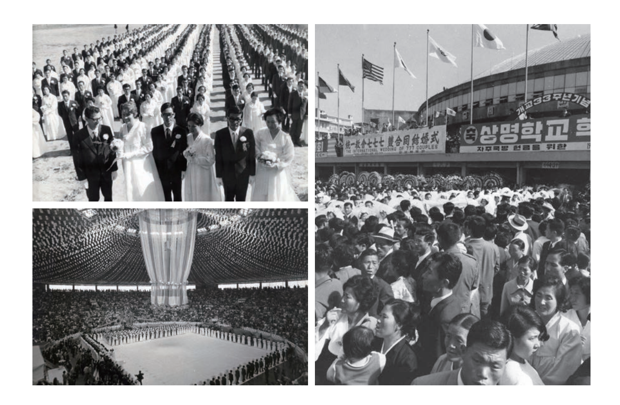
777 Couples International Mariage Blessing (October 21, 1970, Jangchung Gymnasium)