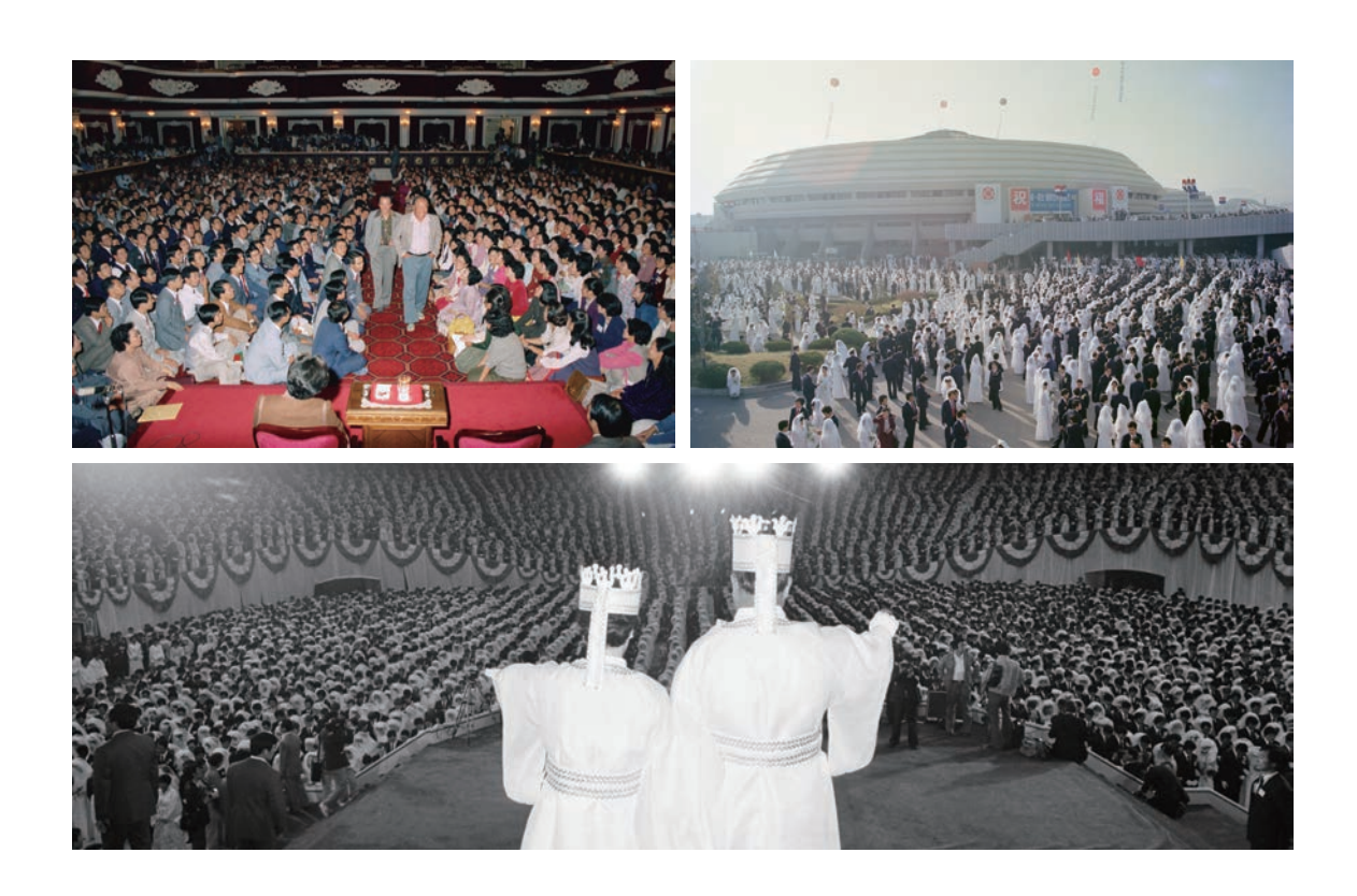
6000 Couples International Mariage Blessing (October 14, 1982, Jamsil Gymnasium, Seoul)