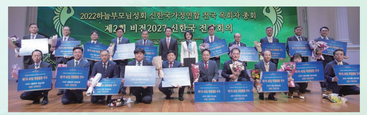
Award ceremony for those with the best results during the 1st 40-day special condition

heart, convinced that we are making a leap forward; even though it could take us a very long time, if we gather our wisdom and develop a powerful strategy, we will be able to continue our progress and be victorious, no matter how difficult it is."