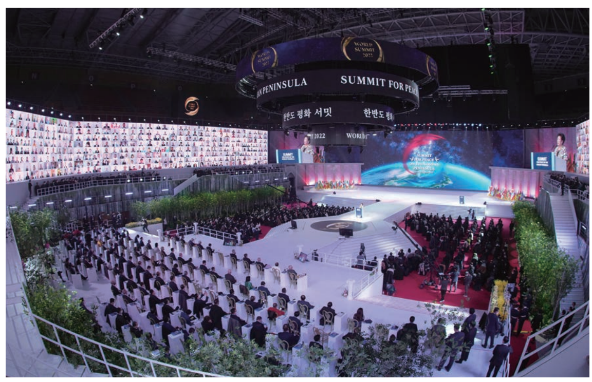
The HJ Global Art Center during the Summit for Peace on the Korean Peninsula

were willing to invest their reputation, contribute their presence, and deliver their powerful messages in concert with True Mother's appeal to the citizens in North Korea and South Korea to work together for a brighter future.