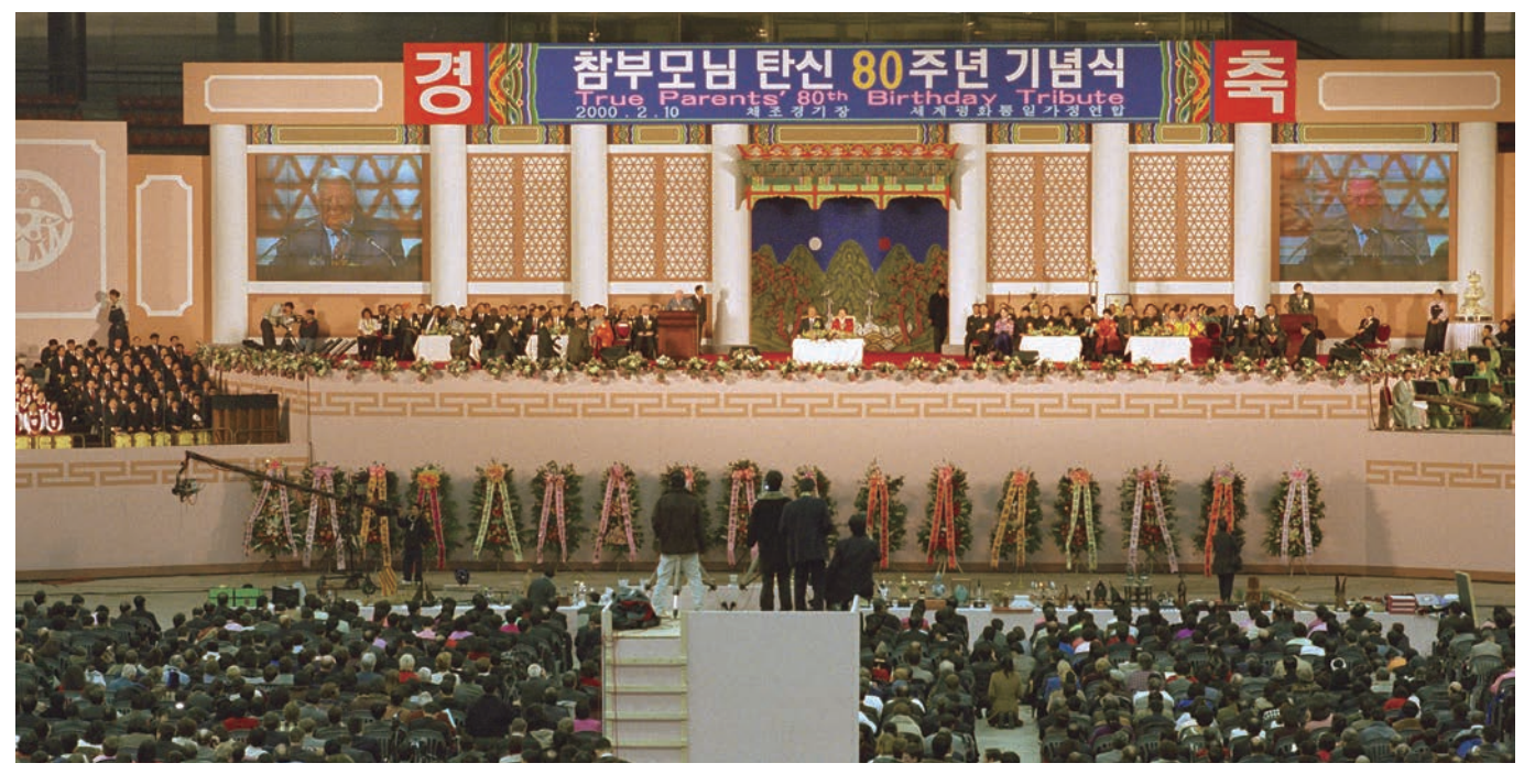
On February 10, 2000, a ceremony to commemorate True Parents' 80th birthday was held in a grand way at the Olympic Gymnastics Stadium in Seoul.

from God. When you enter into a relationship of true love with God, you will be given absolute authority to have dominion, ownership, and the right of inheritance.