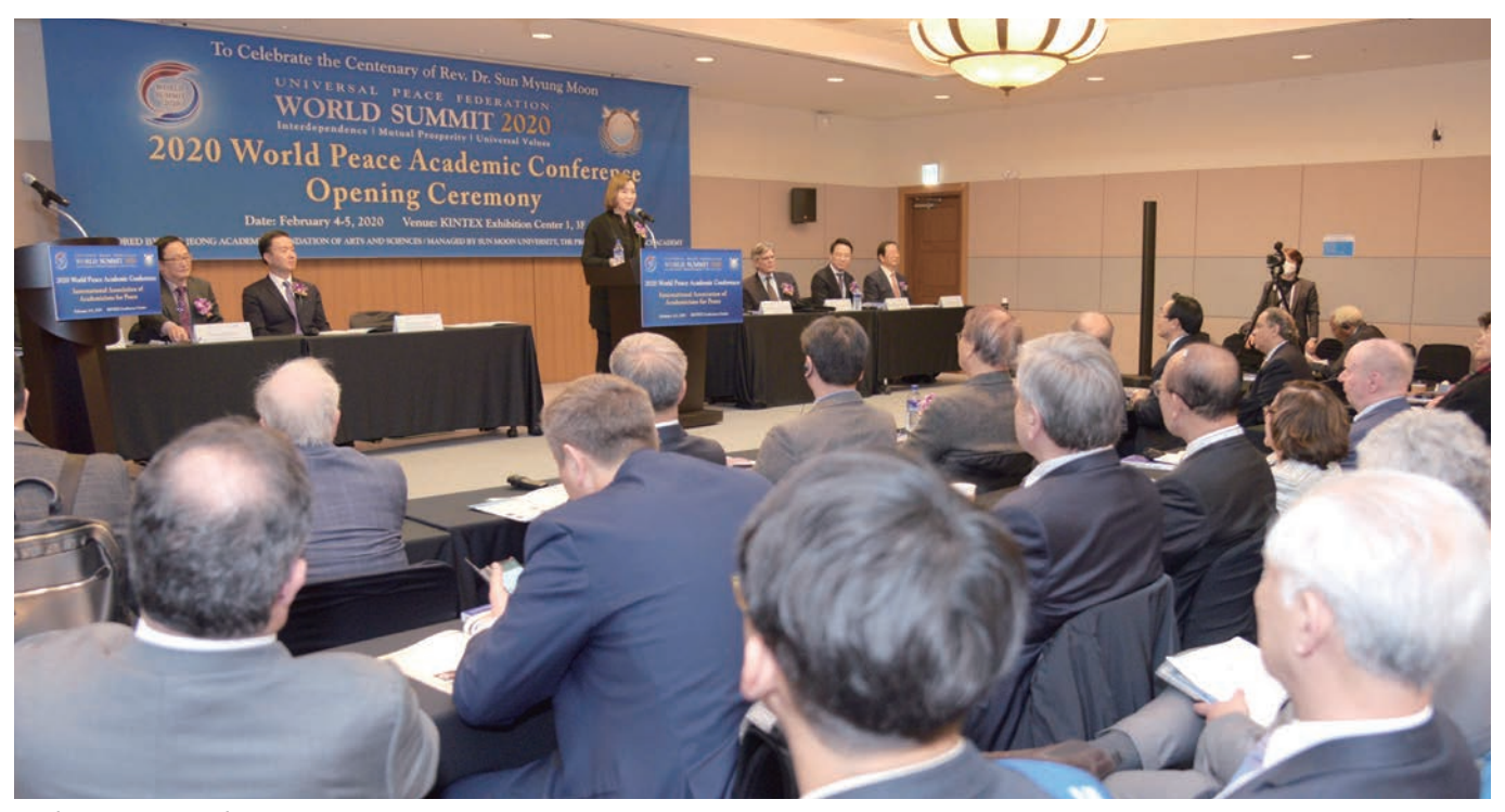
The founding IAAP conference during World Peace Summit 2020

olomon famously said, "There is nothing new under the sun." [Ecclesiastes 1:9] True, the International Association of Academicians for Peace (IAAP) deals with ancient ideas dating back to Plato—the first true philosopher—but already in the next generation of philosophers, another path arose, as Aristotle repudiated his master's world of ideals and set mankind on the materialist bent that has lasted to this day. On reflection, has any person set foot in the ideal