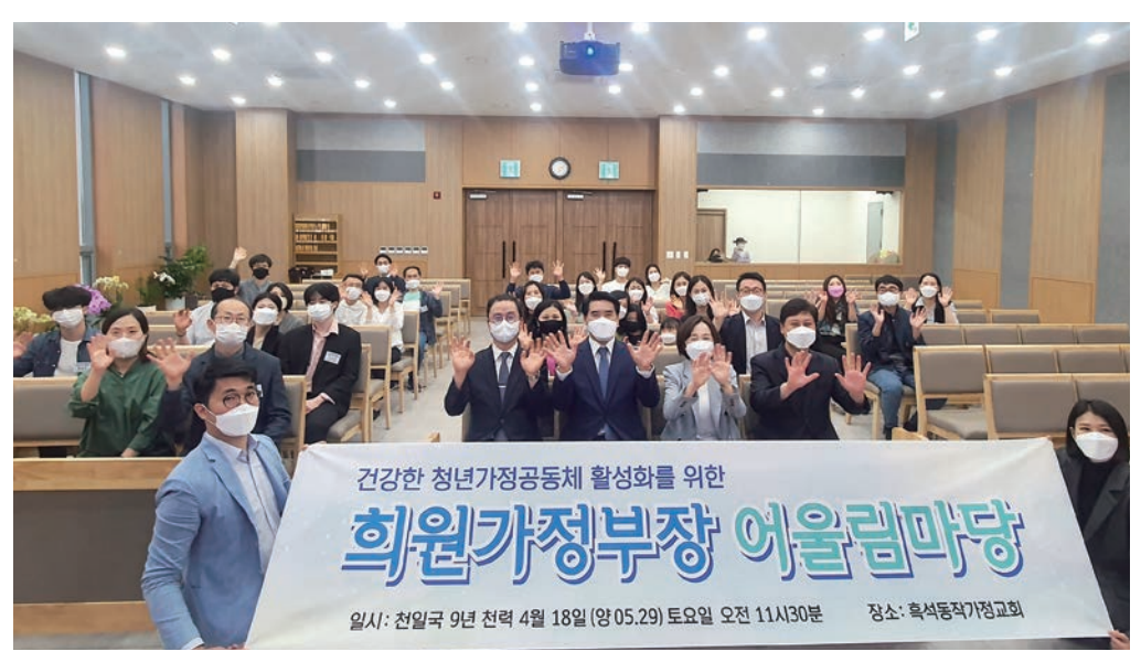
The banner indicates that this is a festival for second-generation members of the Heesung Church.