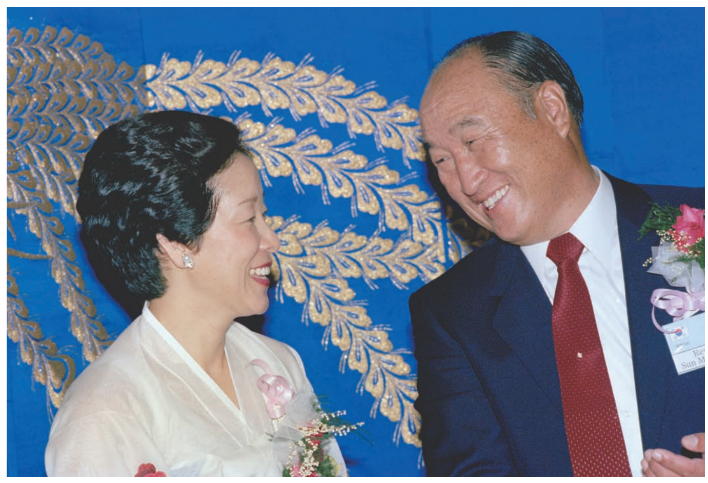
True Parents in Seoul happily welcoming guests to the fifth World Media Conference on October 4, 1982

back and forth. Now that path is complete. It is a path that will remain even after I have returned to God.