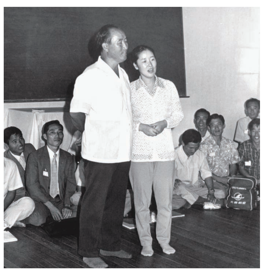
True Parents at the Cheongpyeong workshop site on August 13, 1972 during a national subregional leaders' workshop

God is invisible, yet I must be able to attend him as the True Parent even better than I would attend anyone visible to my physical eyes. I have a responsibility to follow the way of light amid the light, to remove the darkness, and to reach the position where I can liberate all people from the realm of hell. I must erase Satan's footprints and even his shadow from the realms of the spirit world.