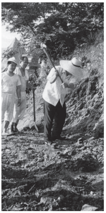
Construction of the Cheongpyeong Training Center began on June 17, 1971.