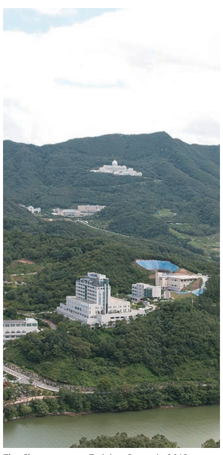
The Cheongpyeong Training Center in 2012