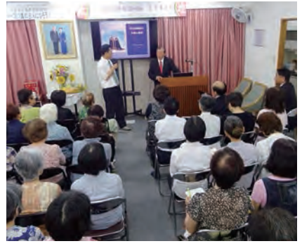
These Korean church elders invested sincerity in fulfilling the mission they had received.

If Adam had not fallen and had become perfected Adam, the perfected only son of God, that perfected only son of God, Adam, would