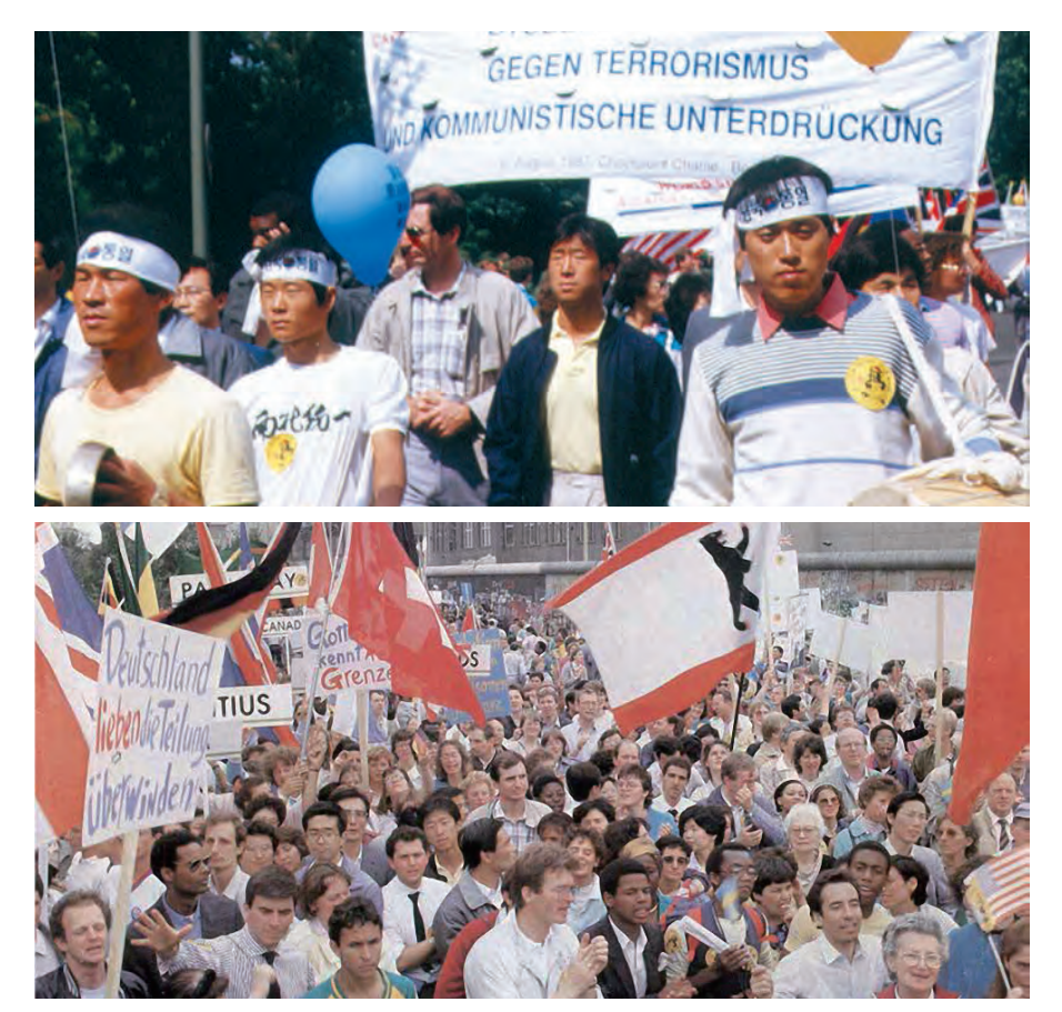
Above : Hyo Jin Moon, True Parents' first son (1962–2008), among thousands of people marching through Berlin to protest the division of Germany as symbolized by the Berlin Wall. The lower photograph shows Hyo Jin nim in the thick of things despite counter-protesters harassing those standing up for freedom and righteousness.

Many of you already know that communist theory is based on a nineteenth-century view of the universe. The cosmos was seen at that time as being made of solid particles that could not be divided into smaller units. Based on this concept, communism's fundamental philosophy says that the cosmos is essentially composed of material. Today, however, atomic physics has revealed clearly that matter is actually intangible energy and that the two are interchangeable. Scientists today say that the emergence of the universe was not an accident—it resulted from the law of causality, implemented by a primary cause, whom we call God. God is a living God. Inside of God dwell intelligence, emotion, truth, heart, and, most importantly, the essence of life—which is true love. We must unite around that essence. The parental love of God is a vertical love, always flowing down. The horizontal love is our responsibility. We change, but God and God's parental love never change. This is very important here. In order for us to unite East and West, we must unite within our parents; we must unite with our God. God is a living God; inside God dwells the heartistic human essence-true love-that is so important to us and to the rest of the world. Only through that can we unite, and only through that can the world come together. Only through that can this