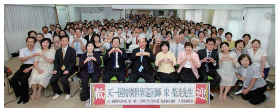
A photograph following the conclusion of a talk to a large group of members: Each international itinerant missionary took responsibility to convey True Mother's heart and guidance in a district .

greeted me with joy. I expressed many of my thoughts on Mother, but I felt that taking an interest in and understanding the importance of the work Mother is now doing was vital for the Japanese members. Therefore, I spoke mostly about witnessing, creating a witnessing environment, developing leaders who can lead the way to national restoration, and about the culture of heart. The video we received covers most of this, so I just emphasized the main points and spoke for about ninety minutes. At the most crucial climax, I spoke about True Mother's status. I spoke about the many remarkable revelations about her and based on my experience of attending Mother in the past I shared things about Mother they did not know well.