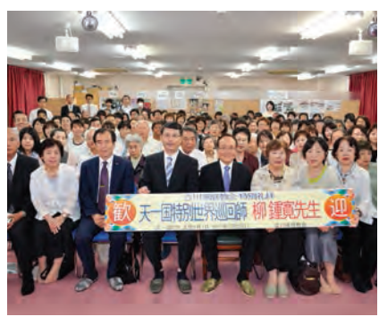
They were able to reach out to Japanese members of all ages.

One of the things I would emphasize at this point was that though it was not included in the video, one of