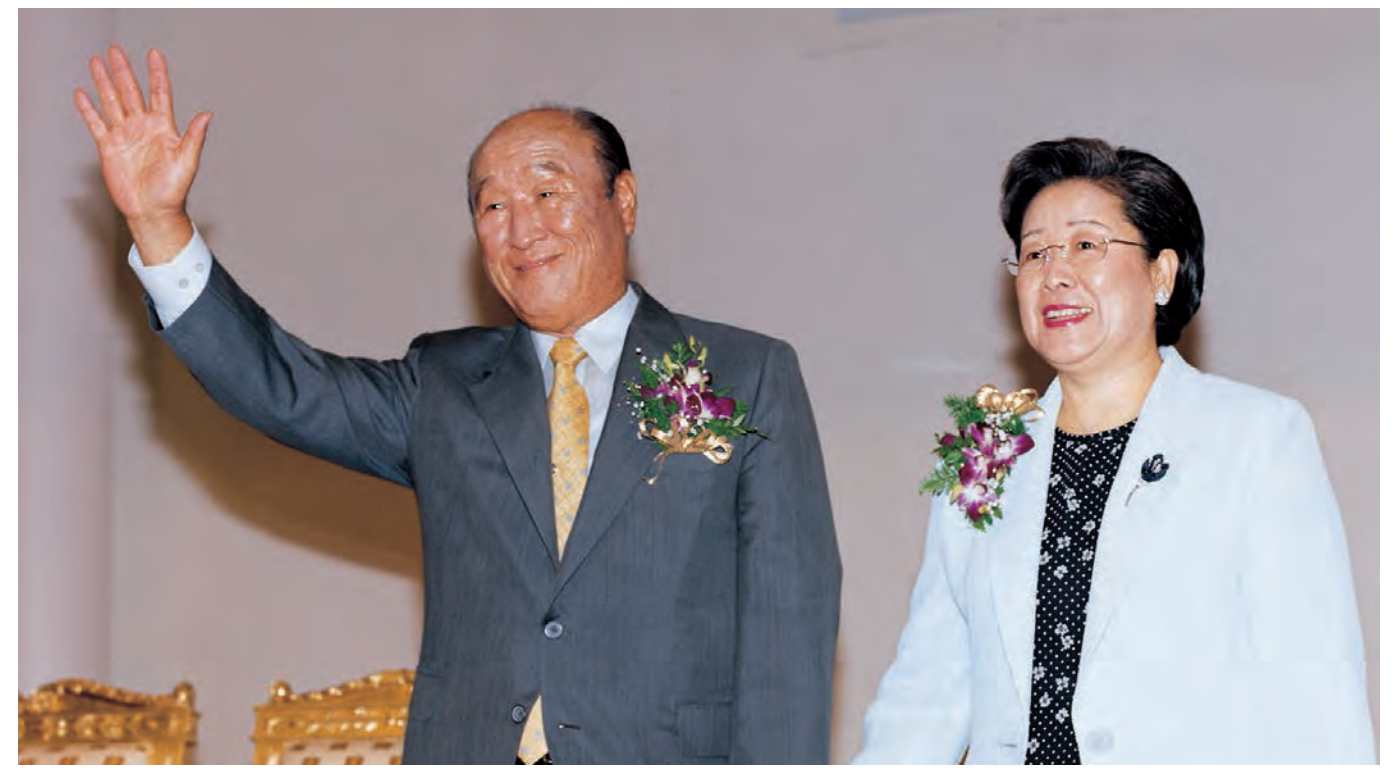
True Parents toured within nations and throughout the world, preaching the new truth and setting a divine example of loving people of all races and backgrounds, thereby drawing them near so that all people might be freed of original sin through the blessing and participate in the restoration of their families and tribes.

condoms and to cure it through new medicines, without any recourse to the will of God. The message of AIDS and other such diseases is much more central than safe sex and new medicine. Its lasting solution lies in the restoration of morality rooted in true love. A Harvard University institute recently issued a research report stating that by the year 2010 AIDS will have affected about one billion people worldwide. This staggering number threatens the very existence of the human race.