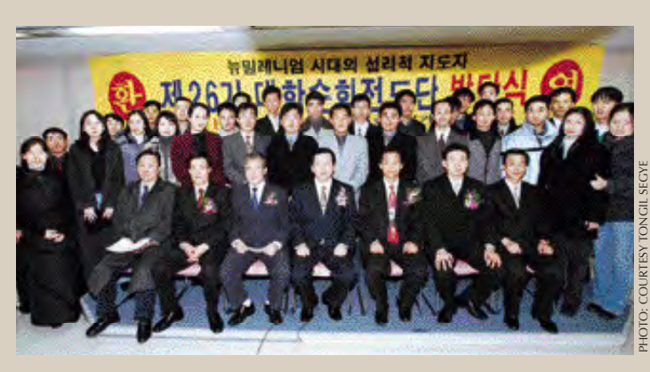
The 26th University Graduates Mobile Witnessing team members train to become the church leaders of the future. The banner reads, "Providential leaders for the new millennium".