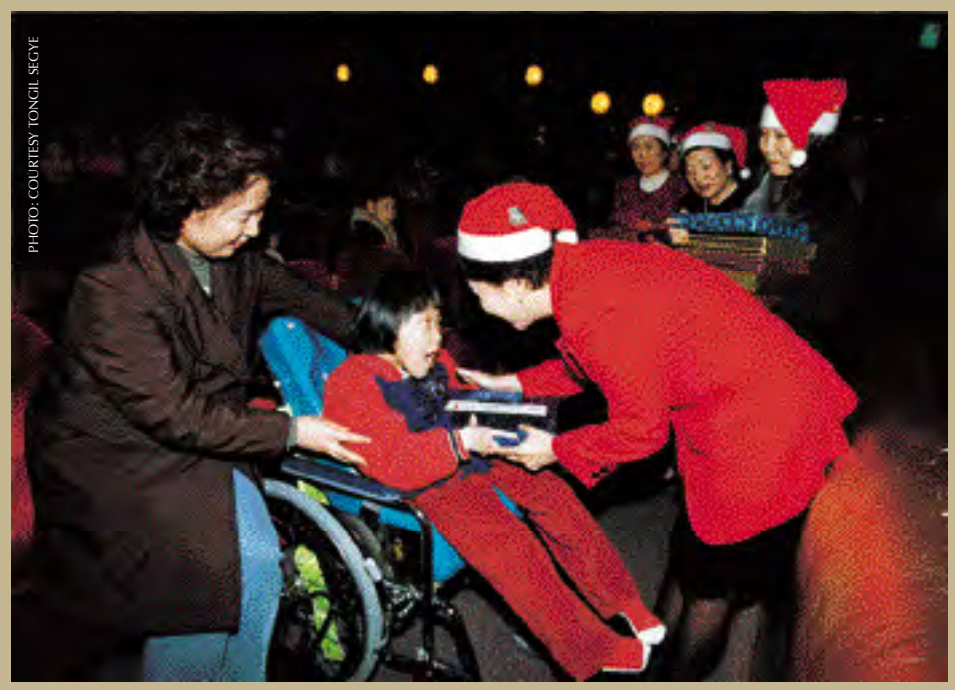
Aewon voluntary service organization members share Christmas warmth and gifts with handicapped children

A good person is one who gives more than he or she receives... Parents are the example of goodness because they want their children to have greater value than they. Between husband and wife, each expects the other to become greater than they are. The elder brother expects the younger brother to become greater. Those who give more than they receive are the origin.