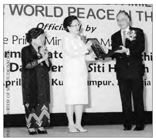
Mother presents a plaque of appreciation to the prime minister's representative

The Prime Minister was to speak personally as the officiator of the conference. Due to illness he was forced to send the Minister of Education on his behalf, who spoke eloquently on the importance of family and of all people living together in harmony. As a nation with Islam as the national religion, but a population which includes a substantial number of Chinese and Indian residents, Malaysia seems to be ahead of much of the world in having faced differences and learned to respect and honor the freedom of others to hold