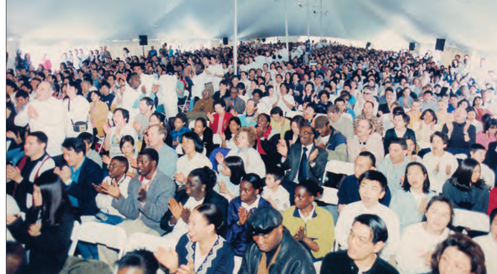
al world. These evil spirits are in you, Thousands of members overflowed from the giant marquee on the Belvedere grounds

world of goodness and what is the world of evil. It tells us how we can realize the Kingdom of Heaven but we did not make it our own, for me and my family. Maybe we thought it was just a tool to be used for witnessing. We should have recognized this is meant for me and for my family to grow. We could have built the Kingdom of Heaven. We could have gone to the Kingdom of Heaven. If we had taken this seriously, we would have been reading every single day, and checking if we were qualified to be citizens of the Kingdom of Heaven. No matter what we did, we would have lived