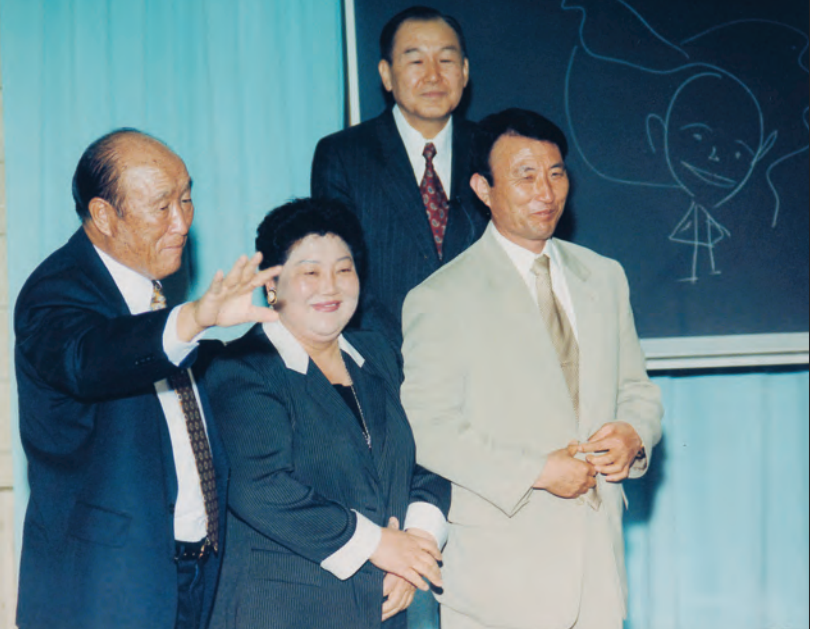
These words come from Father's speech to members on the 45th anniversary of the founding of HSA-UWC, May 1, 1999, which was also the 39th anniversary of True Parents' Holy Wedding.

REVEREND SUN MYUNG MOON MAY 1, 1999 BELVEDERE INTERNATIONAL TRAINING CENTER, USA