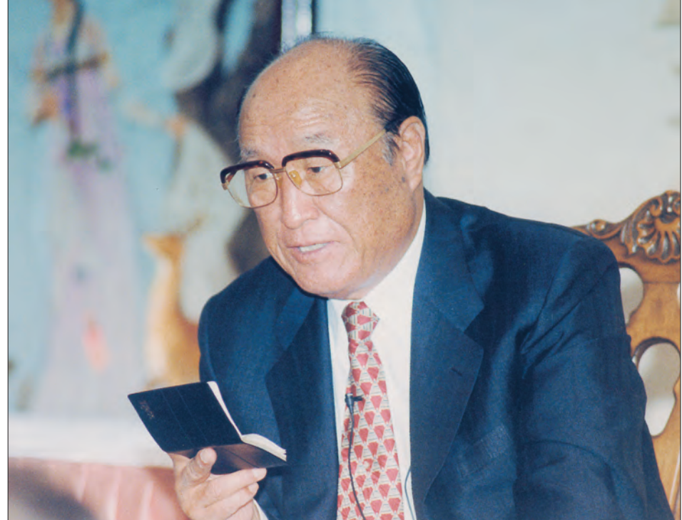
Father reads his instructions to the assembled leaders, May 2

God wants to liberate fallen man, and must bring him to the highest level of heart in the ideal of creation. In front of such a subject, that individual becomes completely united