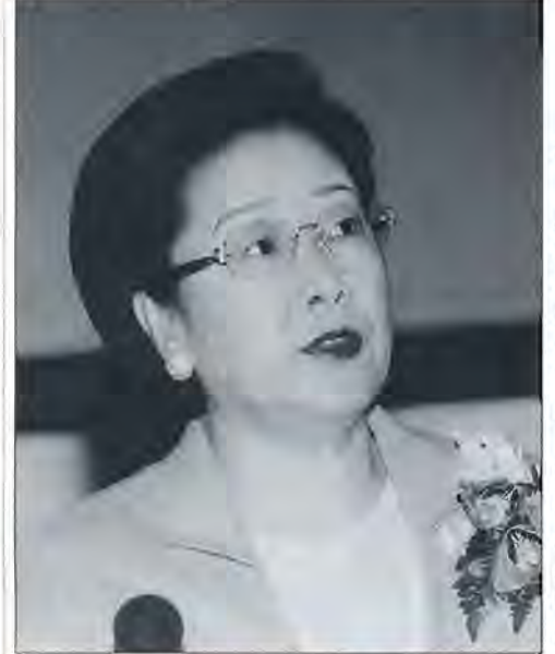
Toronto, Canada: the first of Mother's 32 international engagements