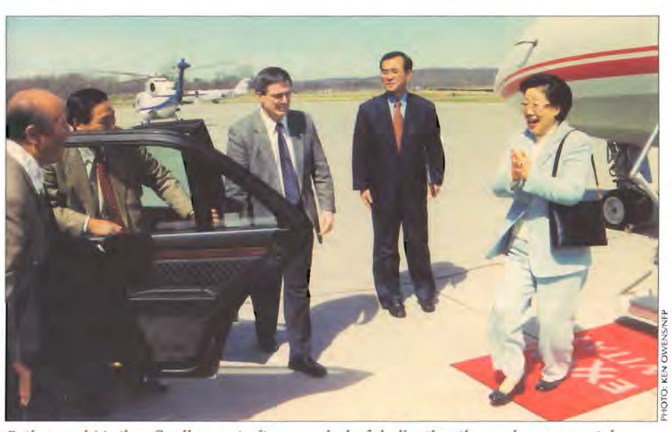
Father and Mother finally meet after a period of dedicating themselves separately

There are billions of cells in the human body. As these cells are the inheritance of generation after generation, it is just as if we are the descendants of God. There is a connection of blood lineage. What is the purpose for which a man or woman consists of 40 billion cells? We have those cells