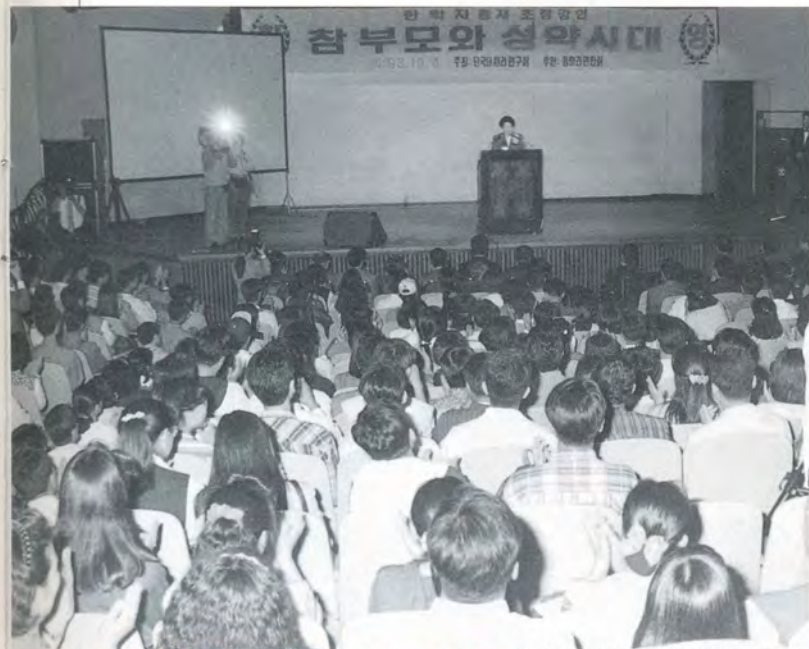
Dan Guk University, October 4, 1993