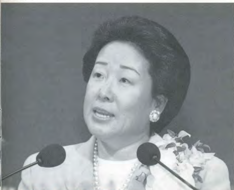
Niigata, September 16, 1993