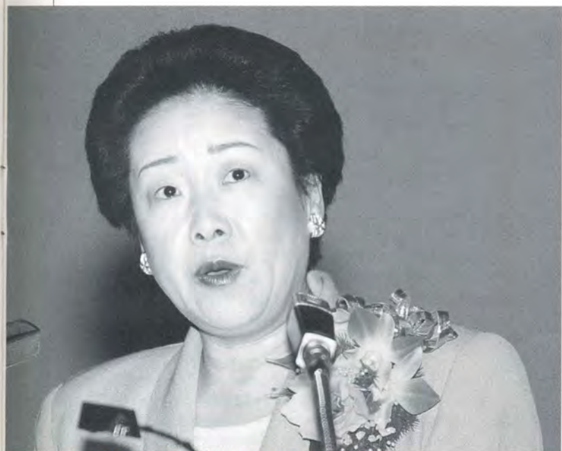
Seoul National University, October 5, 1993