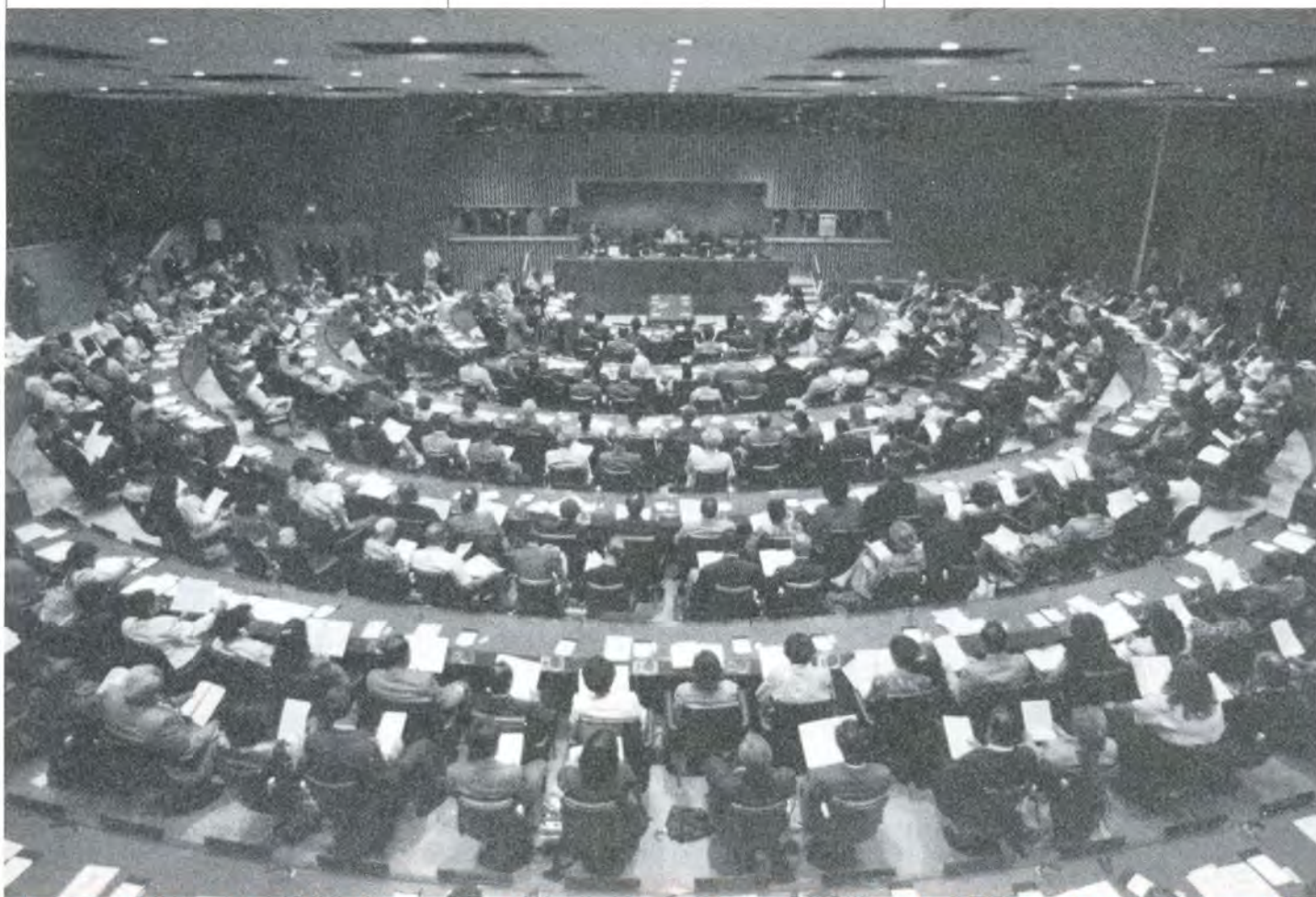
Mother speaking to sixty ambassadors, permanent representatives and more than one hundred delegates of just as many countries as well as international organizations at the United Nations on September 7, 1993. She declared True Parents and the Completed Testament Age.

The first is the failure in the missionizing effort. Christianity did not lead the tradition. It allowed the secular, military, economic tradition to lead the way. In the