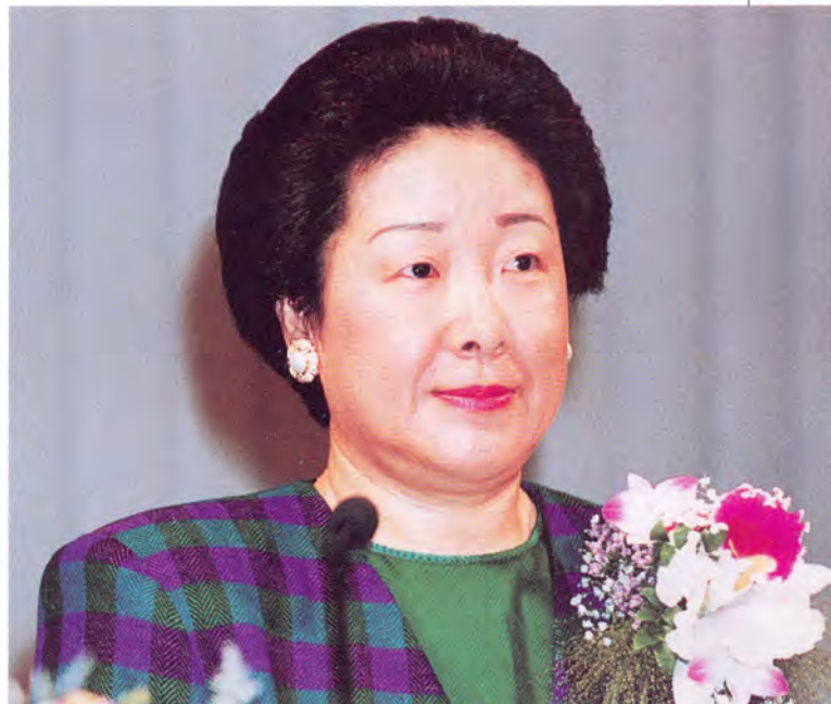
Sapporo, Hokkaido, September 11, 1993