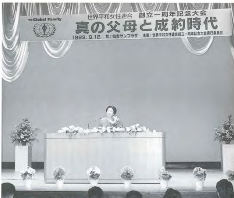
Sendai, September 12, 1993

After the guest speakers, Mother, welcomed by a storm of applause, gave her speech in Japanese, entitled "True Parents