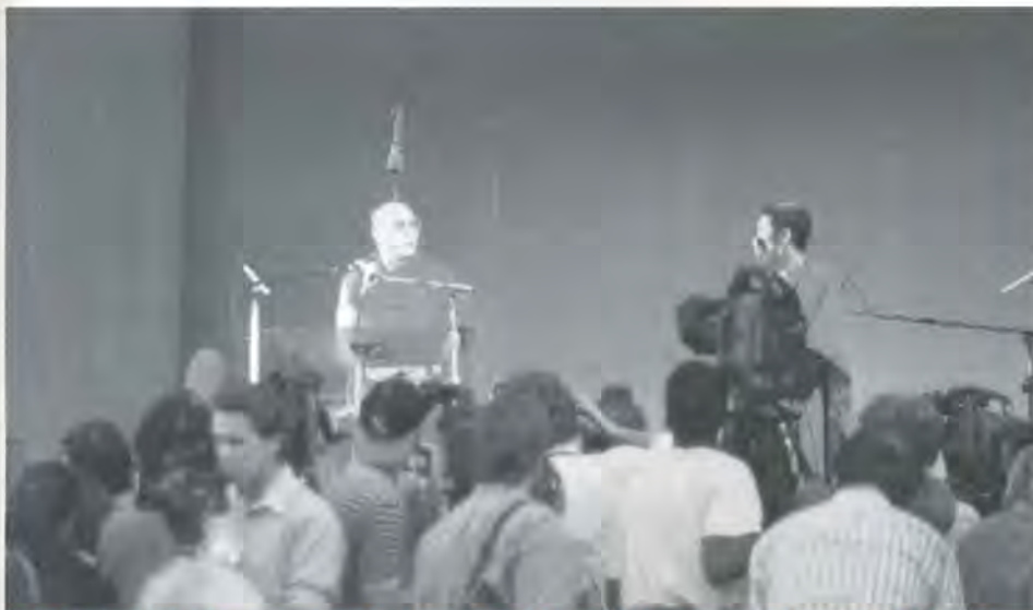
H.H. The Dalai Lama giving the keynote address at the closing plenary in Chicago's Grant Park.