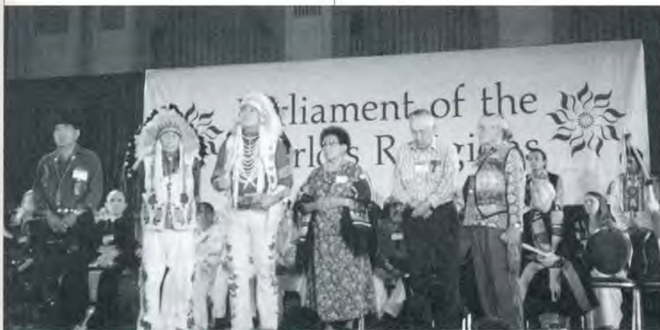
Blessing on parliament being offered by Native American elders representing the four directions of north, south, east and west at the opening plenary, August 28, 1993.

Because of the historical importance and symbolism of the 1893 Parliament most interfaith groups throughout the world have anticipated the coming of 1993 as a year for interfaith recollection, reflection and celebration. The International Religious Foundation (IRF) initially viewed its own Assembly of the World's Religions as leading up to a major celebration in 1993. However, between 1985, the year of the first Assembly, and 1993, that focus shifted, owing to several factors: first, the persistent reluctance of other interfaith organizations to work cooperatively with the IRF; second, the desire of the IRF to participate with its assembly in the 1992 World Culture and Sports Festival; three, the founding, at the 1990 assembly, of the IRFWP. It was through the IRFWP, which advances on the foundation of the IRF, that a major interfaith celebration was organized this year in Delhi with over six hundred participants. [See Today's World , April and May 1993.] During this year several major interfaith