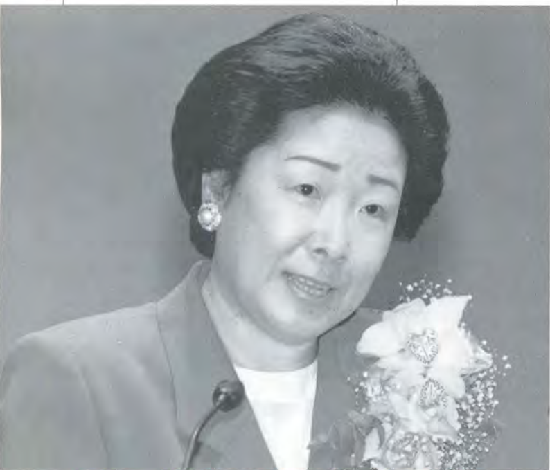
Koriyama, Fukushima Prefecture, September 13, 1993