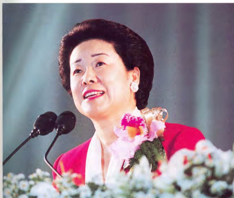
Tokyo, September 14, 1993