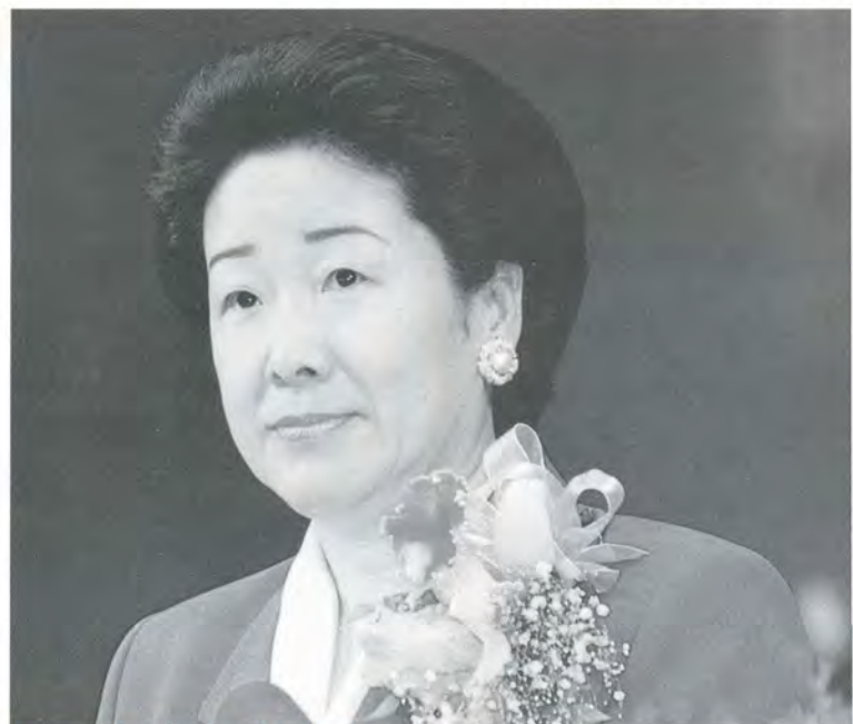
Gunma, September 17, 1993

and the Completed Testament Age." She stated, "This world is now confronting problems from the fall of a family and the degeneration of morals, and most people are in trouble and feeling despair. If you desire a brighter future in this world, then you must understand the fundamental purpose for which God created human beings. Because of the fall of the first human being, God's idea had been lost. Thus evil-originated family and lineage started, which were based upon self-centered and immoral love. That resulted in a sinful world."