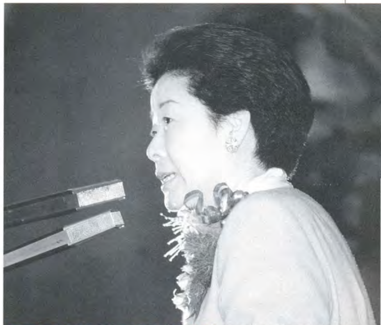
Dong Guk University, October 8, 1993