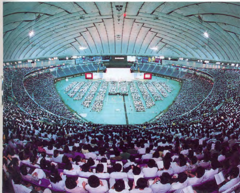
Tokyo, September 14, 1993

Mother visited Japan for the first time in a year. At the gate of the Tokyo Dome a large number of people gathered in a long line for two hours prior to its opening, hoping to see her.