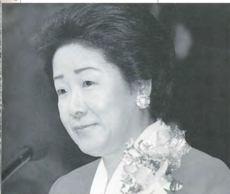
Hiroshima, September 21, 1993

Mother's rallies continued in twenty-five cities throughout Japan from September 11 to 30, 1993. Each hall was filled with enthusiastic people, and therefore at some events hundreds of people had to be turned away at the door. ■■