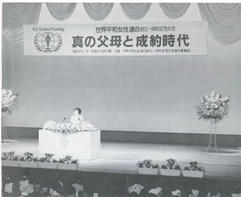
Iwamizawa, Hokkaido, September 11, 1993

The rally opened at 6 p.m., when a chairman and chairwoman announced in sonorous voices the opening of this historical event.