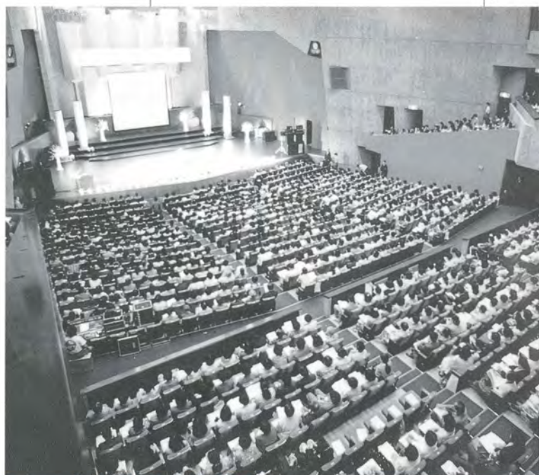
Kumamoto, September 25, 1993