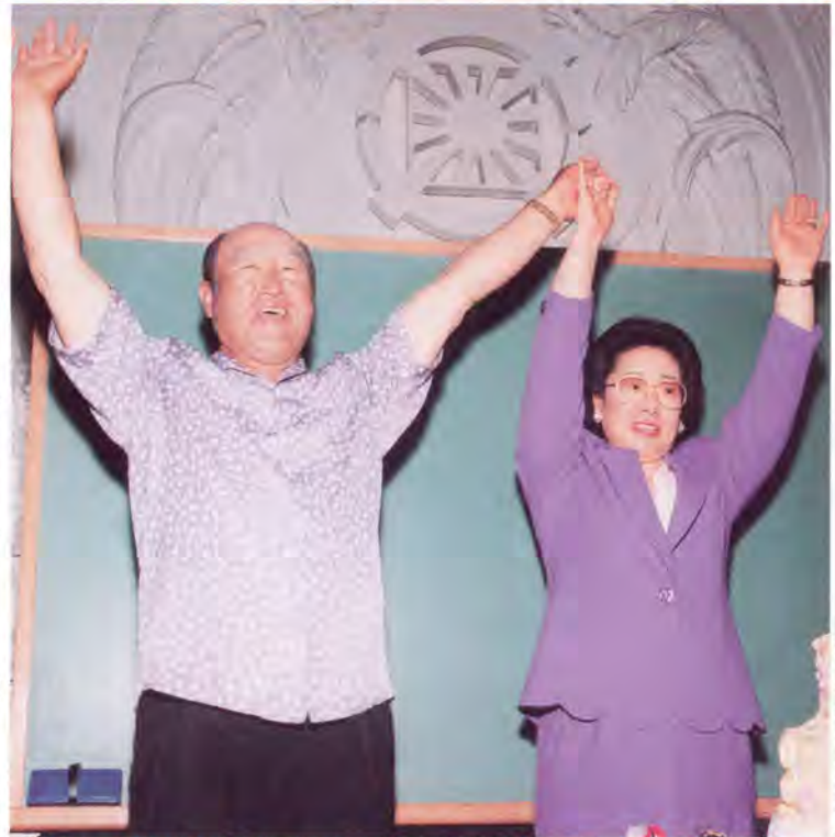
Father and Mother give a victorious monsei at a celebration at the World Mission Center immediately following the UN speech.

That this event was so successful is itself a testimony to the exceptional worldwide foundation of the Unification Church. Numerous ambassadors and even heads of state helped provide for this engagement to take place. A most