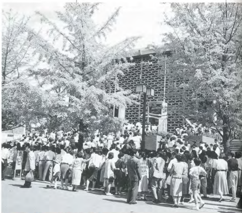
Nagano, September 15, 1993