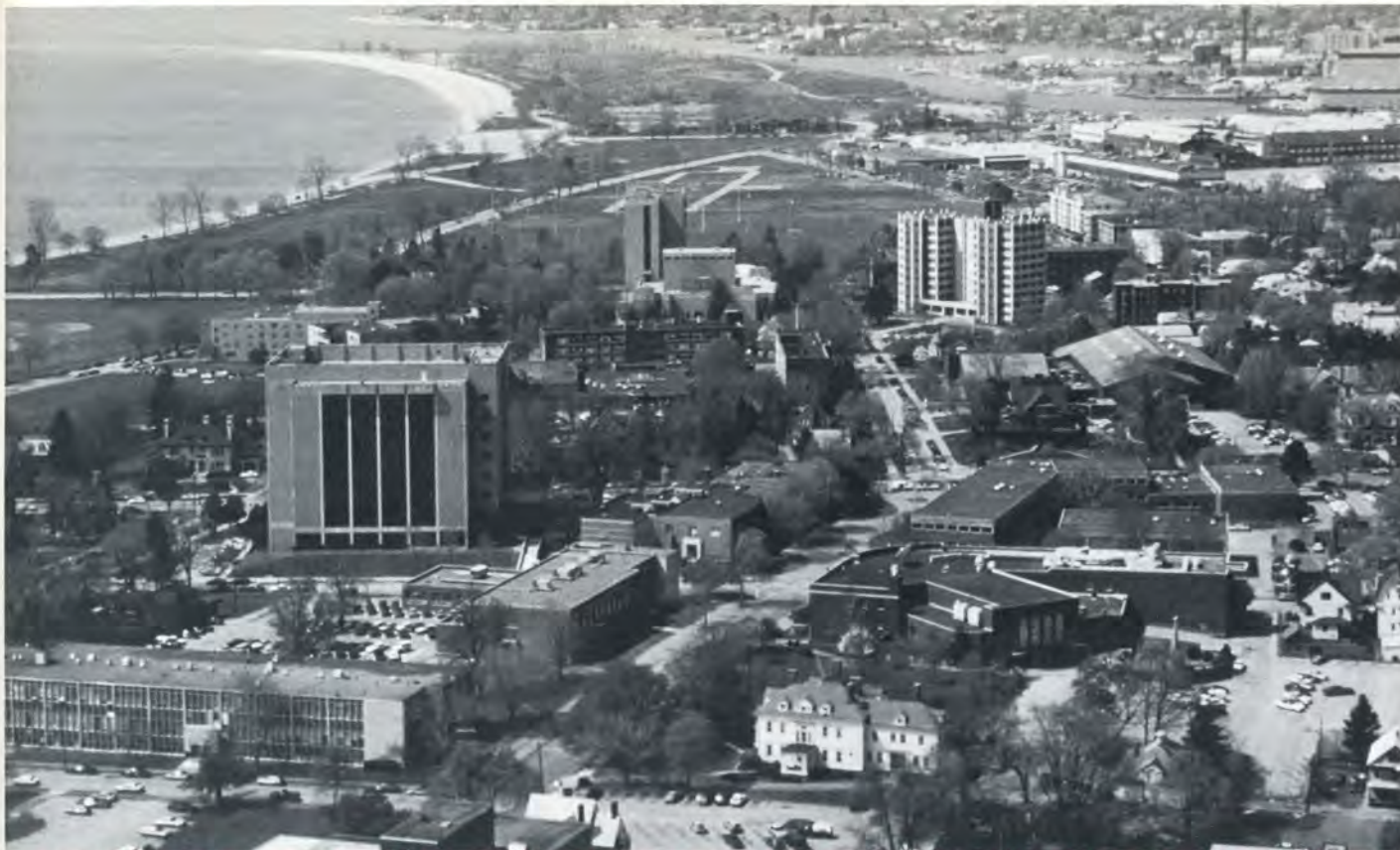
An aerial view of the University of Bridgeport, in Bridgeport, Connecticut, first in the PWWA World University Network. The university is inviting applications from students from all over the world.

Fine Arts, Graphic Design, Photography, Sculpture, Education, Industrial Design, Interior Design, Music, Theater, English, History, Political Science, Psychology, Sociology, Fashion Merchandising, Journalism and Mass Communication. College of Business and Management—MBA and five year MBA: Accounting, Business Administration, Business Economics, Computer Information Systems, Finance and Banking, International Business, Management and Industrial Relations, Marketing. College of Health Services: Biology, Clinical Nutrition, Medical Technology, Chiropractic, Respiratory Therapy, Dental Hygiene, Counseling, Human Services, Marriage and Family Therapy. College of Science and Engineering: Biomedical, Computer, Electrical, Interdisciplinary, Management, Manufacturing, and Mechanical Engineering, Biology, Chemistry, Computer Science, Mathematics, Physics.