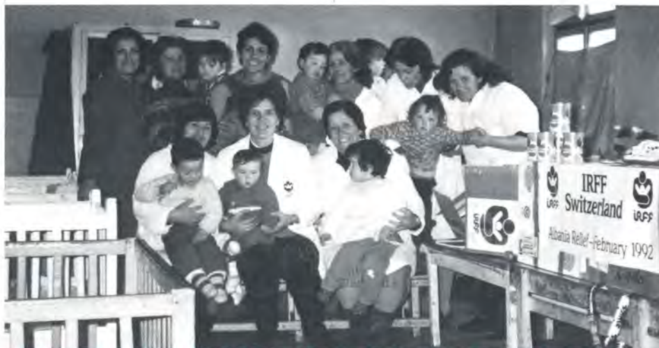
Relief goods are being donated to an Albanian kindergarten. Because there are no more glass factories in the country, broken windows cannot be fixed and pillows serve to keep out the wind and cold.