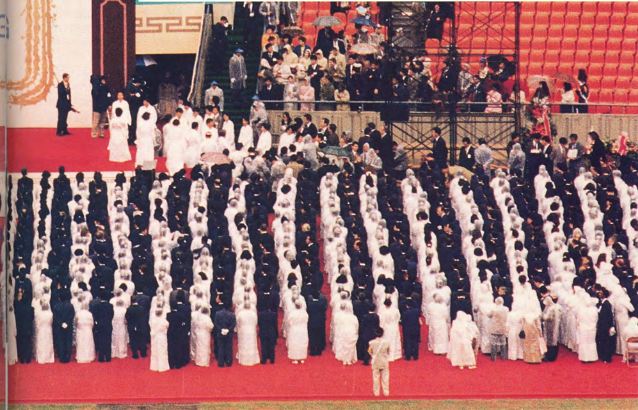
Including couples from many religions, the Blessing Ceremony for Previously Married Couples of the World takes place at the Olympic Main Stadium, Seoul, Korea, with a "cloud of witnesses." This event just preceded the Women's Federation for World Peace rally.