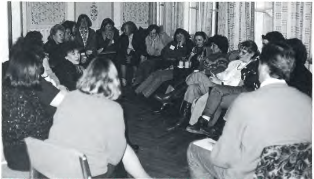
Teachers from St. Petersburg and some parents of local students meet for a discussion group at the Alushta Military Camp.

During each workshop one of the university students prepared and gave a lecture from the Divine Principle in Russian. The audience response truly was unexpected. On several occasions, when the lecturer finished his or her presentation the whole audience cheered for several minutes as a standing ovation. In one workshop the teachers thought that the lecturer was a young professor in his mid-twenties due to the brilliance of his presentation. They were shocked to discover he was only a nineteen year old student from Moscow State University. Many expressed feelings that he was a role model for their students, and wanted him to come and speak to their groups.