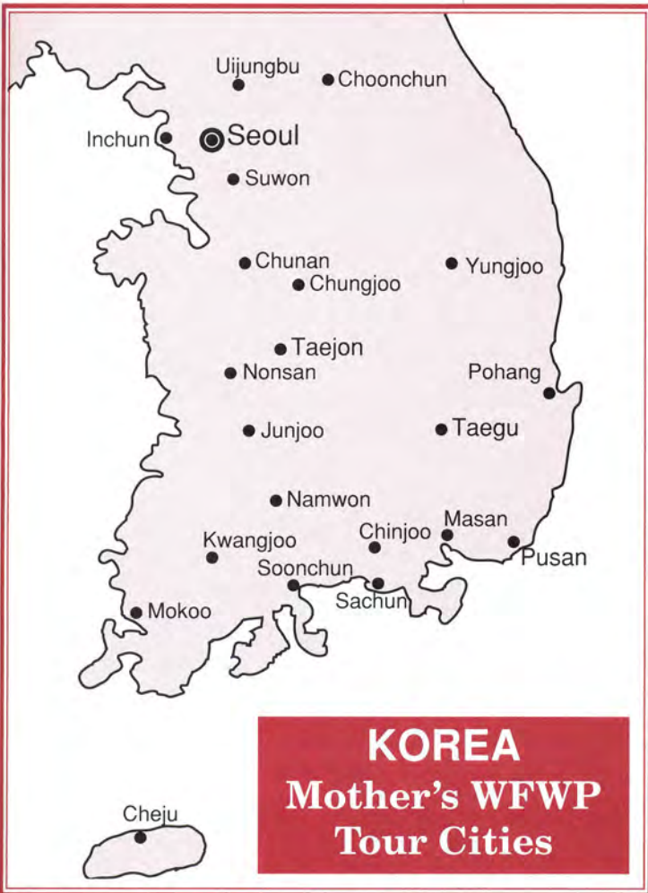
KOREA Mother's WFWP Tour Cities

even sitting on the main floor of the arena. Through the traditional Korean songs and dances performed by Korean CARP members and Japanese and western brothers and sisters, a beautiful atmosphere was prepared for Mother's speech. In fact, the normally reserved Pusan citizens warmly applauded Mother on several occasions as she spoke. At the end of the rally Father was really happy; at the airport just before departure, Father asked how many people had come. Mother answered, "I think that ten thousand people attended." The result truly exceeded our expectations. One last interesting thing was that the day before the rally it rained heavily. It stopped during the whole time the event took place, only to start again late in the afternoon when everything was over. Heaven was really on our side!! ■■■