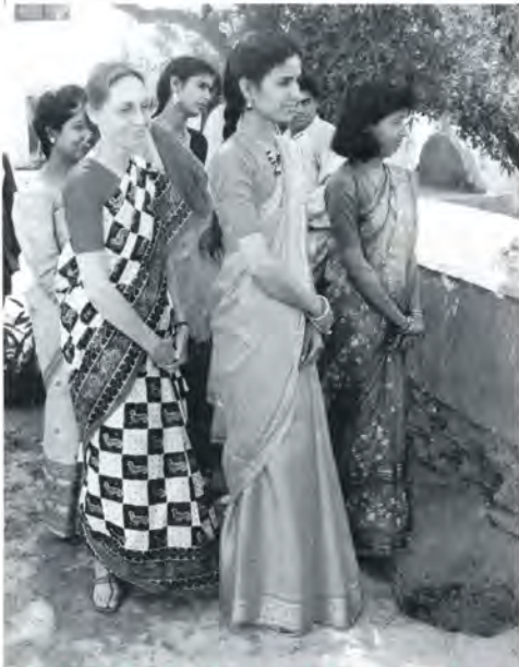
In both the brothers and the sisters the variety of culture and religious backgrounds blended in the face of true love and service.

The alliances that are created through the RYS are vast and deep. One obvious source of strength lays in the friendships