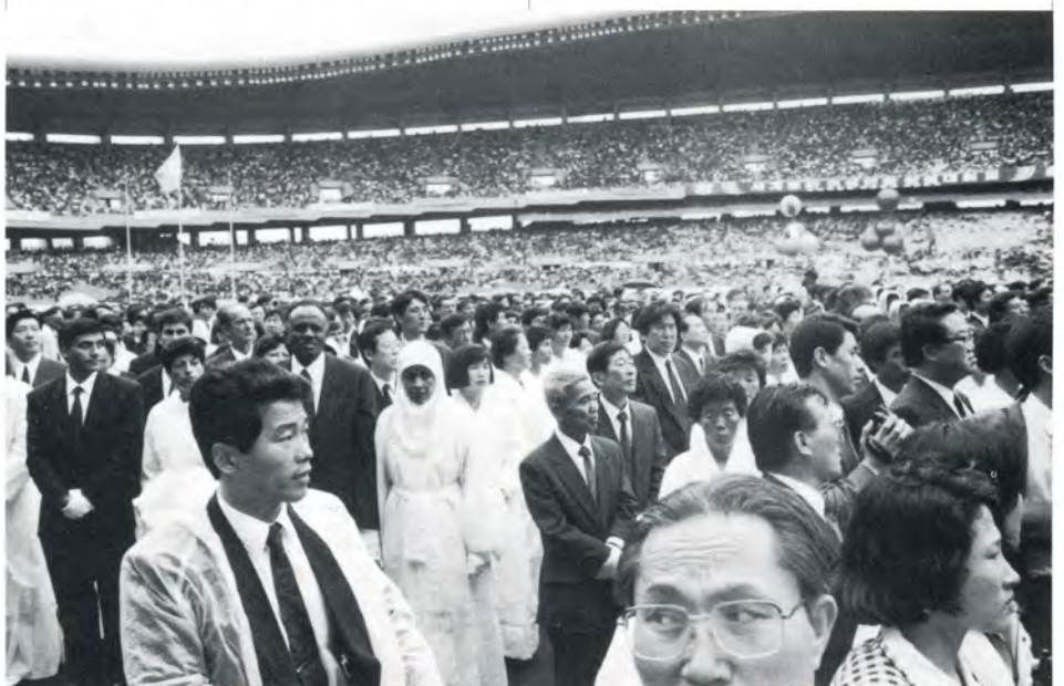
The stadium was full as far as the eye could see. After the blessing the rains increased.