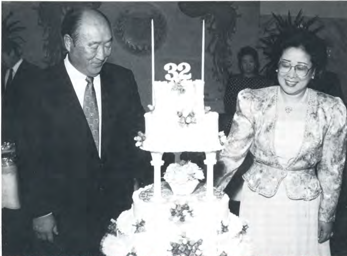
Father proclaimed April 18 the "Day of Revival of the True Family", on the occasion of his and Mother's thirty-third wedding anniversary and Easter.

back to the right position. But now the good ancestors will come down and help, so that immediately an effect will start taking place. Believe in this and immediately, starting from this moment on, this will take effect.