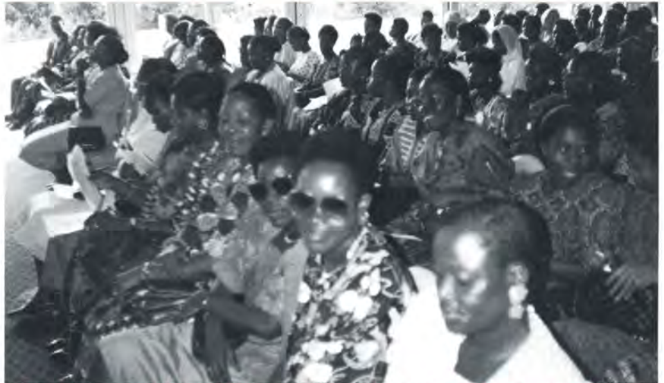
Our sisters around the world have worked very hard to begin the WFPW, and many sent WFPW members from their nation to the Seoul rally April 10. Representing these many grassroots beginnings we share here the report from Cote D'Ivoire. Above is a view of the participants at their first conference.

Members of the different committees were asked to speak about the goals