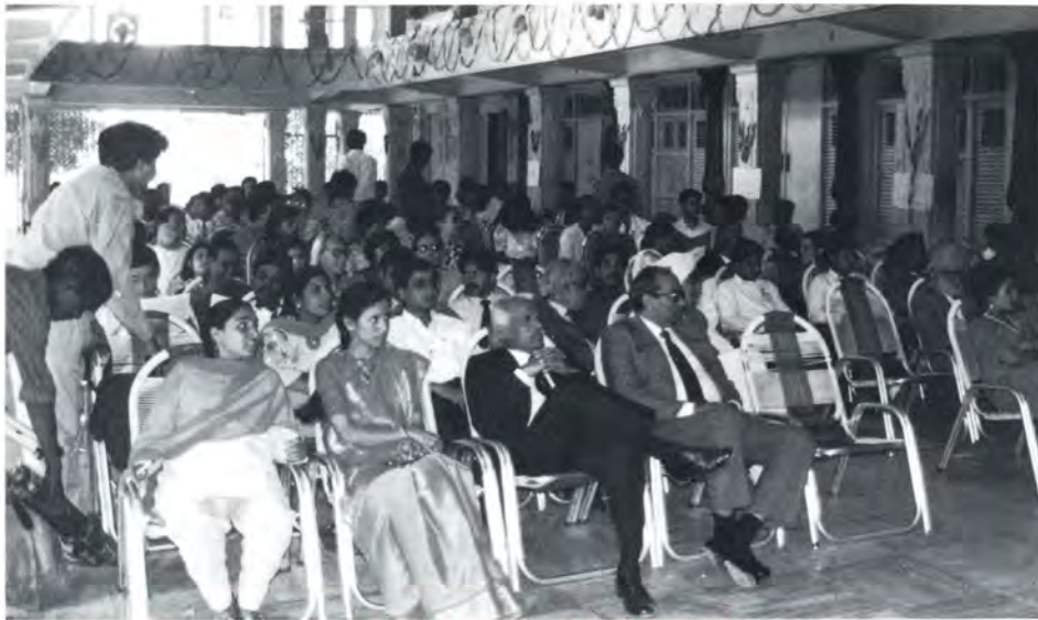
The closing ceremony was held in the newly restored temple.

one particular faith, and this was another unique aspect of this project. This temple is believed to be one of the first temples of Vrindaban and is more than