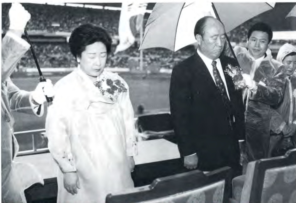
Father and Mother praying before the Women's Federation rally begins.

Japan sent eight hundred and one couples to the blessing. Though they had over three thousand couples prepared, Father limited their number, requesting the older couples first. The