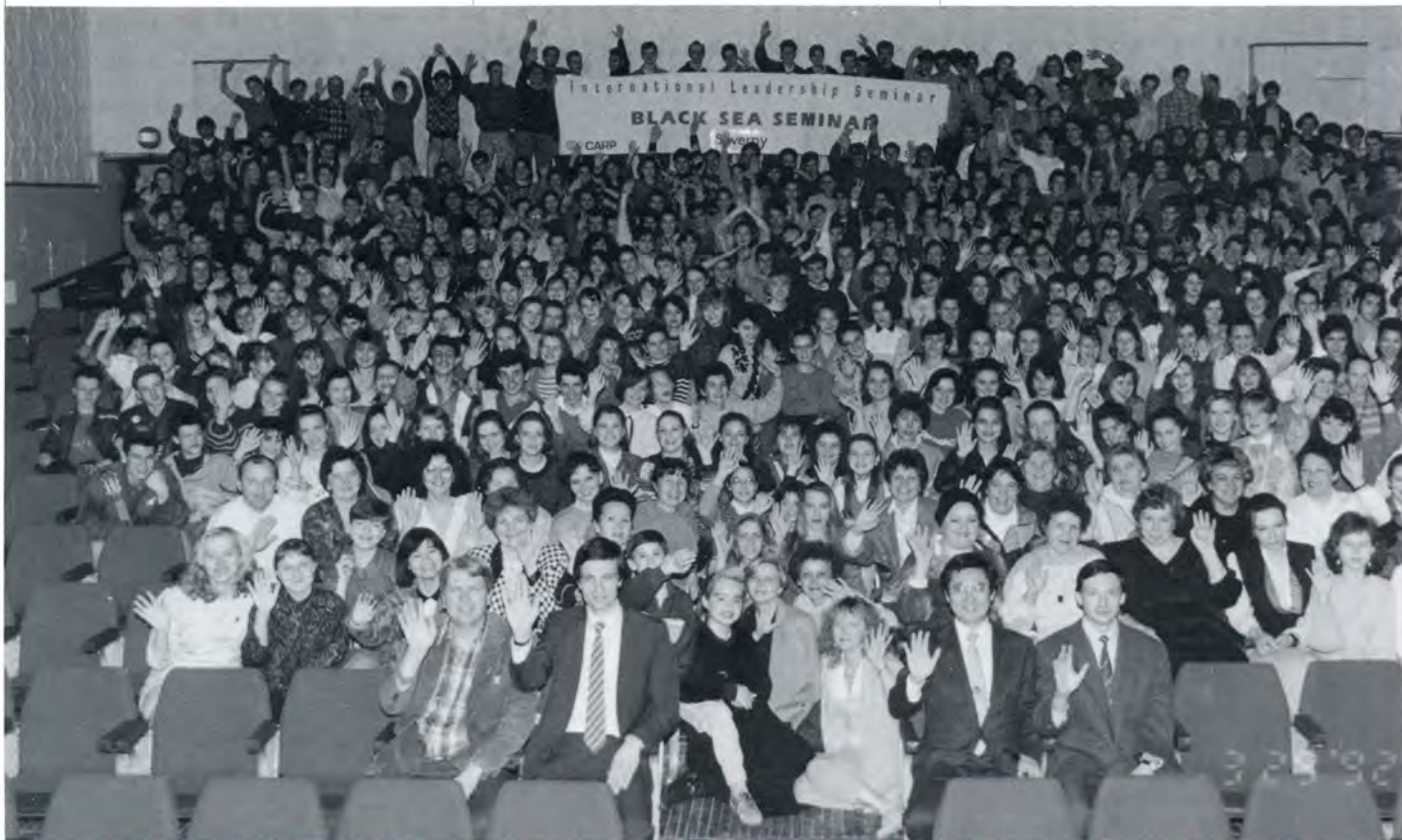
Representing the 7,229 participants in these March 20 to April 1 workshops, the high school students and teachers at Siverny Camp give a welcoming wave to all of us.

The workshops consisted of a five-day program in which the main content of Divine Principle was introduced. Special lectures were given on the "Theory of Education" and "Marriage and the Family." There was an exam given on the final day for which the