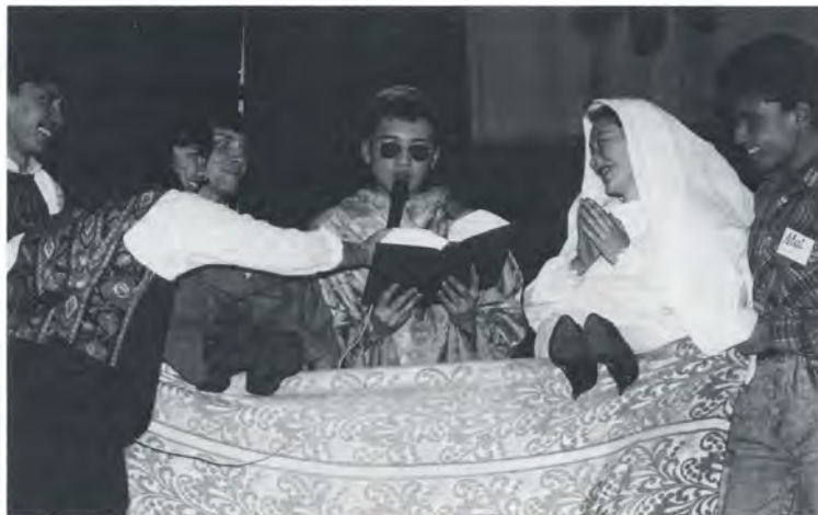
Students offering insights into their traditions and customs through skits on "Day of Heart," a workshop tradition.

Also, not far from the workshop sites was the dacha belonging to Mikhail Gorbachev in which he was imprisoned during the August 1991 coup that precipitated the collapse of the Soviet Union and the end of communism. Here in Yalta, both the expansion and collapse of communism occur-