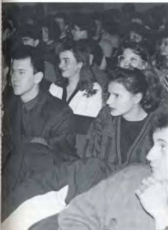
University students and professors attend Divine Principle workshops.

In each of the cities where our missionaries work, students were invited to orientation programs to hear about the