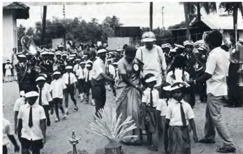
Another part of the program includes a march through the streets with a uniformed band and students wearing RYS hats. The parents association organized this event.