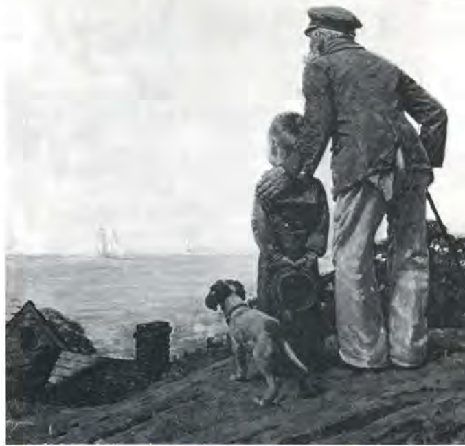
Human beings have an exact position in time and space and circumstances.

If we look at American society, people get angry very quickly. Anger easily leads to heart attacks. The heart attack