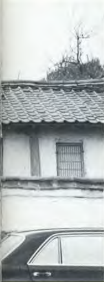
Father's childhood home, unseen by him in more than forty years. "I remembered it as being bigger." It is near the northwestern town of Jeongju.

The unification of the fatherland, a goal shared by all of our people, cannot be accomplished through political, economic or military means. None of these will succeed unless they are preceded by another element. That element is True