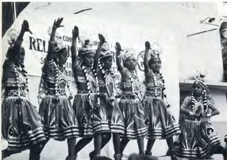
Grateful students from St. Joseph's Elementary School put on a native dance as part of a program to show their gratitude.