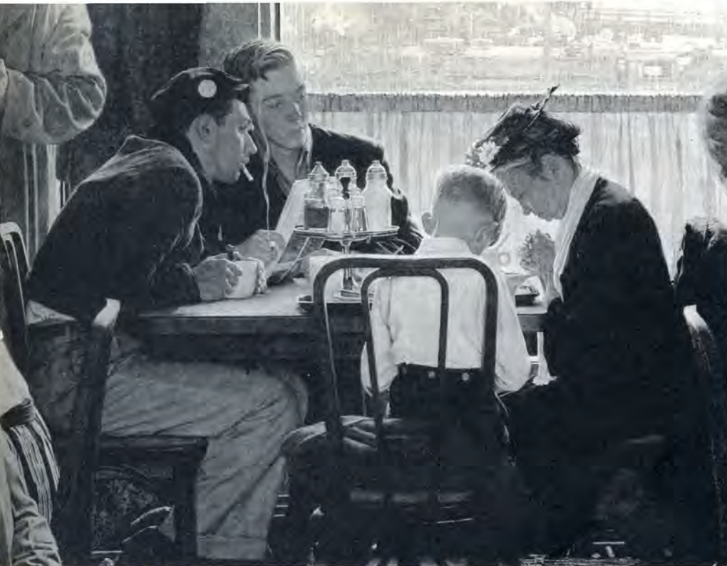
Children full of grandparents love usually don't become delinquents.

ing their children slaves to money. So people have already become slaves to money. They fight and cheat each other all because of money. They even kill each other over money. This means that education makes human beings slaves to money. No one likes the word "slave." But even some of us are slaves to money. This is really a problem.