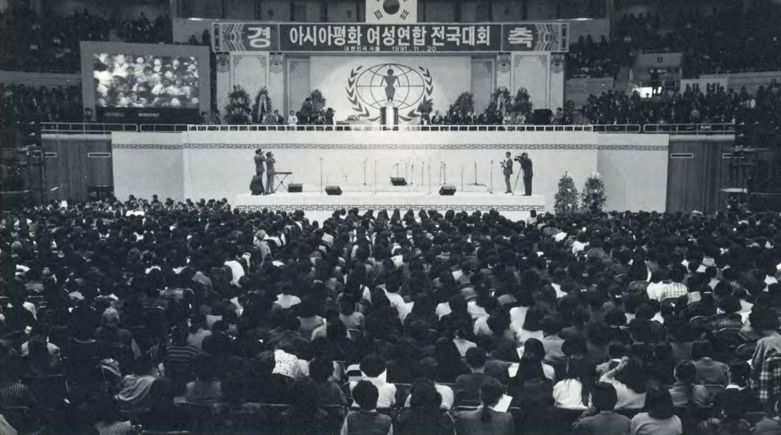
Mother speaks to fifteen thousand women at the WFPA National Congress. She advises them that it is the time for women's logic of love and that she will lead the members of the WFPA to be women that their "husbands, children, and world can trust as they trust God."

become God's object of true love, the position of True Parents as the embodiment of the true love of God was lost. As a result of that, until now men have passed through an evil history, killing and exploiting each other. Because man was not able to realize the ideal of True Parents centered on true love, he established a fallen world.