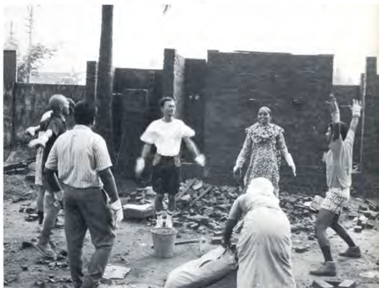
Morning brings exercises for the participants building the enclosed toilets for one thousand students.