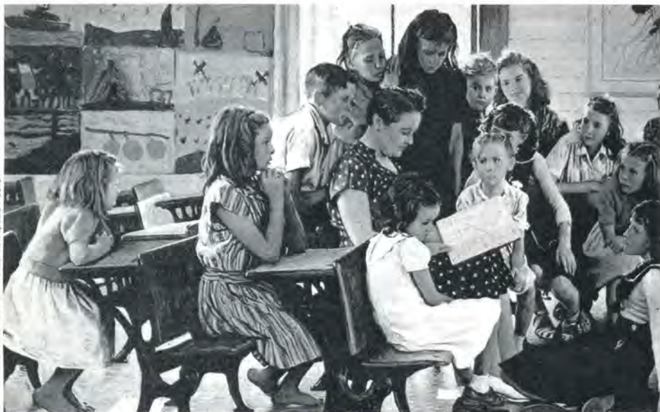
School is the second home and teachers are the second parents.

We need to know such things when we are raising children. Which education is more important? A Unification Church education is much more important than a Harvard, Columbia, Yale, Princeton, or Stanford education. In 1638, Mr. Harvard established Harvard University to make Christian ministers. Today, what percentage of Harvard graduates become ministers? It's a sorrowful thing. Until the end of the seventeenth century, around fifty-seven percent became ministers. Now it is maybe two or three per-