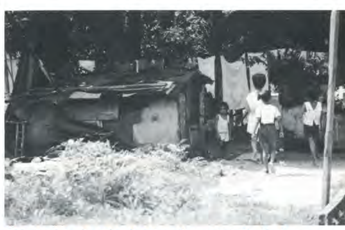
This shack typifies the situation of poverty in the favelas.

My conclusion was that the church needs people of talent and vision if we are to make a difference. I as one man would have difficulty effecting change without a large following. Father said