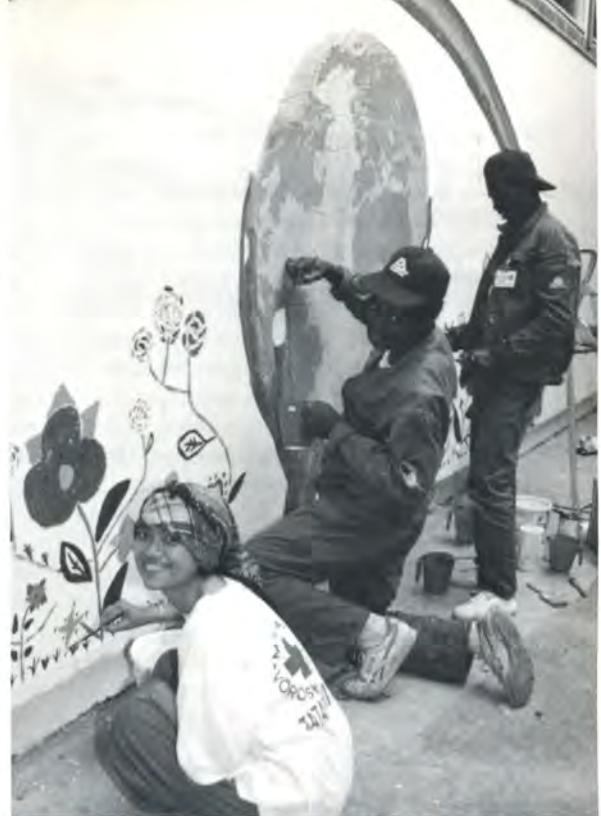
RYS'ers add a mural to newly painted walls at a Tatabanya school.

Our team members came from Sri Lanka, Israel, Syria, Nigeria, Ghana, Scotland, Austria, Hungary, India, Switzerland, Britain, America, USSR, Bulgaria, Spain, Poland, Singapore, Bangladesh, Yugoslavia and Japan. These