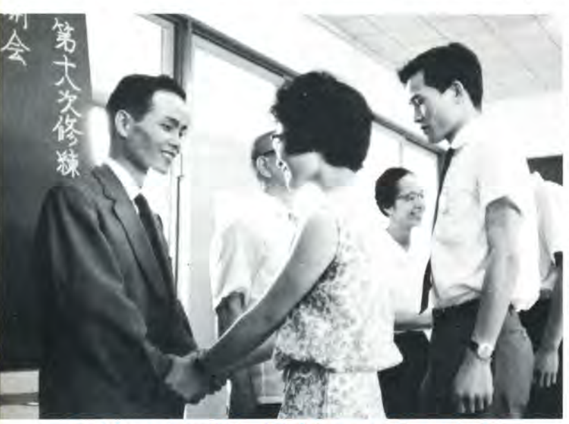
Participants sincerely thank their lecturers at the graduation ceremony of the 18th workshop at Toda Training Center, July 1964.

The next morning, I was really surprised to see the headlines in the newspaper. A big earthquake occurred in Niigata City, which I had left the day before; bridges were broken and houses had fallen down. I was shocked, but I felt peace within myself. I felt that what Heavenly Father had done through me would never be destroyed.