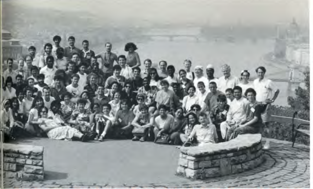
The entire group of RYS volunteers visits an overlook of the Danube River and Budapest city.

had no precedent in the history of Hungary and he was glad to witness the first.