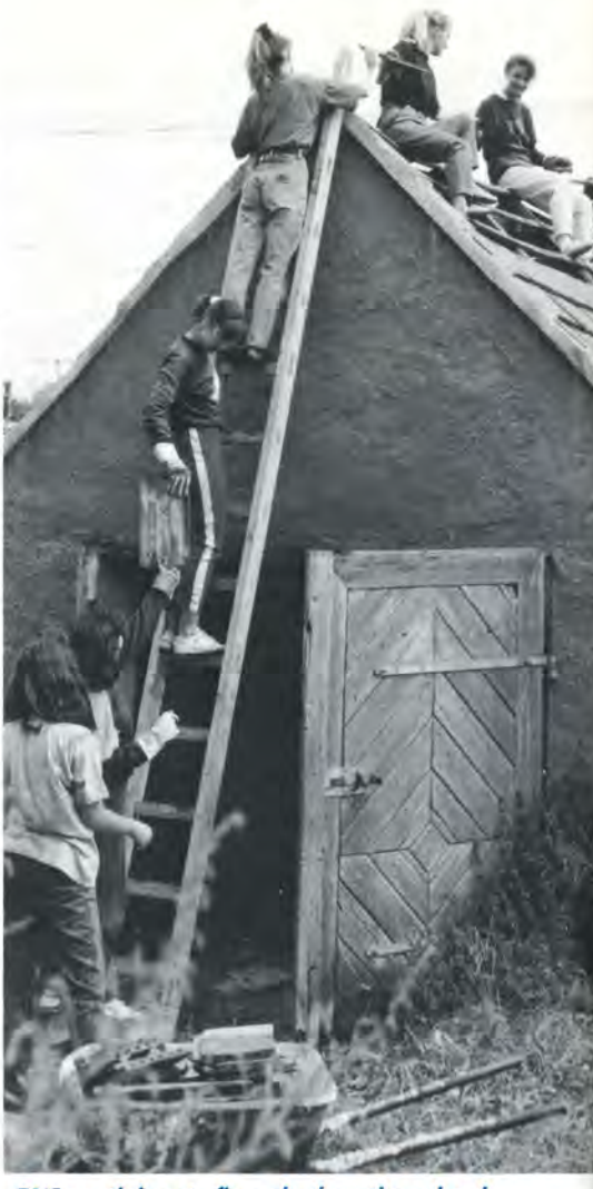
RYS participants fix a shed on the school playground in Tatabanya.

participate in all activities including the religiously focused ones.