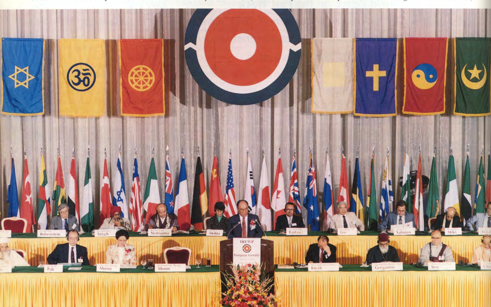
Father delivers the Founder's Address at the Inaugural Assembly for the Inter-Religious Federation for World Peace on August 27, 1991.

At the second Assembly of the World's Religions, which was held in San Francisco one year ago, I called for the creation of the Inter-Religious Federation for World Peace. Today, with the cooperation of religious leaders such as yourselves and in the presence of representatives of religions from around