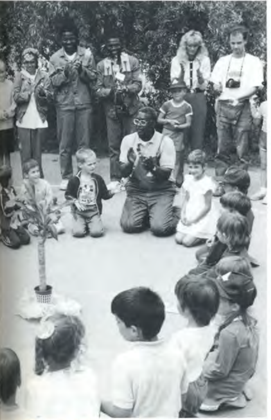
ren as RYS participants join in.

us when we reached Tatabanya. Some of the tourist books are not too encouraging about Tatabanya, because it is a city created from a small mining town, patched together by moving people into massive concrete structures without any master plan. But what Tatabanya lacks in picturesqueness is more than made up for by the generosity, loveliness and caring