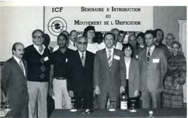
At an ISUM conference for North Africans in 1985, Turkish, Iranian, and European participants join Egyptian, Moroccan and Tunisian professors.

think he could sense something about True Parents behind me. I began to realize that there were probably many spiritual people in Egypt, though I only met a few in the early days.