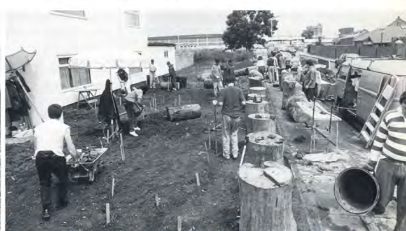
The harmonious team spirit of the RYS participants generates tremendous power. The largeness of the task at hand keeps all hands busy.