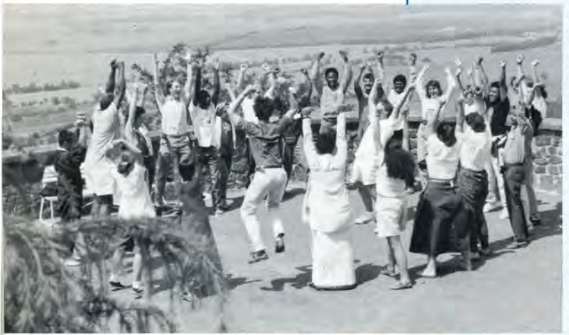
One site group expresses joy to be together as a team once again.

The uniqueness of the RYS and its vision attracted the national television network of Hungary (MTV) to make a 35 minute documentary on the RYS. The editor, after observing the program and its goals, decided to entitle the film, "Together with God."