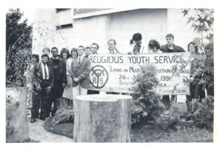
RYS volunteers pose together in front of the Japanese Peace Garden in Southall England, which they built from a piece of derelict land.

By June 26 all the plans had been laid. An architect had designed the garden for us and this had been approved by the planning committee; an area of wasteland belonging to the council had been chosen for the purpose and accommodations were arranged in the Dominion