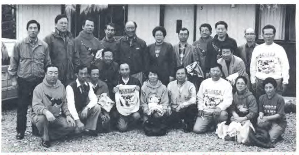
Father invited Japanese leaders who had fulfilled their goals to fish with True Parents in Alaska.

The sun rises at 4:30 a.m. and sets at 11:30 p.m. during the Alaskan summer; usually Father goes to the ocean before sunrise and returns after sunset. He stays on the water about nineteen hours; it's very hard. So Father is all