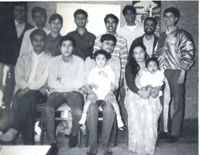
Nepalese members attend a 40-day workshop in March 1991.

love for all the missionaries. It seems to be more readily available than sometimes here in New York or other places. In that sense I believe it was a very blessed situation to be in a place physically very far away but where Father's love still reached me. I think it is more intense when one seldom sees True Parents than when one has many opportunities to see them.