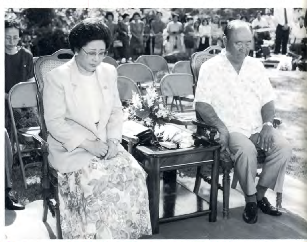
True Parents pray before Father begins speaking to over two thousand brothers and sisters gathered at Belvedere.

Have you heard about the Inquisition book? It tells what actually happened during Father's trial, proclaiming the truth about how the United States government conspired to put Father into jail. Yet, while he was on trial Father created projects like The Washington Times and Insight magazine, The World & I , and so on, in order to save America. I