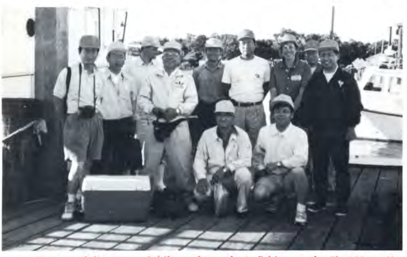
Tour participants are jubilant after a day's fishing on the First Hope II.

Because these thirty Ocean Church centers symbolize such far-reaching consequences, the Eve nation's support in their development is very important. Japan has ties to the sea that go back thousands of years. Because it is an island, Japan has consummated a total relationship with the sea. Seafood is the main aspect of the Japanese diet. Did you know a Japanese chef can pre-