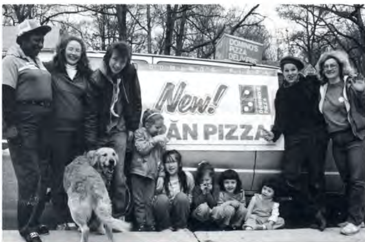
Volunteers clear trash from five public areas and enjoy pizza donated by a local merchant afterwards.