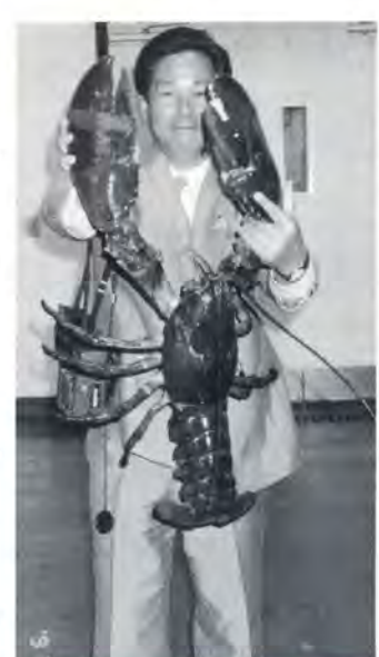
Giant lobsters captivate visitors at the New York Fish House.