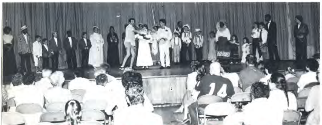
Curtain call for the West Lanham Hills Players production, "The Music Man."

But my micro level reflects on the CONTINUED ON PAGE 39