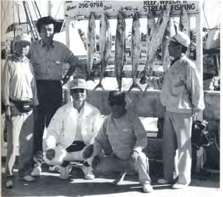
In Key West, Florida, participants pose with their catch of barricuda.

Two fishing tours visited the New York area in July, where they fished off Montauk on the eastern point of Long Island. Still too early for large tuna, the guests were kept busy catching fluke, porgey, seabass and for big excitement -bluefish. August tours will be targeting tuna. The vessel First Hope II was used for the first, smaller group and for the second, the First Hope II and a Montauk charter company provided transportation.