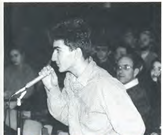
This student is posing a question to the nightly panel; the students were serious and always very detailed about what they needed to know.

is experiencing the Principle. We're not going to change their lives by a series of lectures; we've got to practice the foundation of faith and foundation of substance. That's really the issue and the crisis in the Soviet Union now.