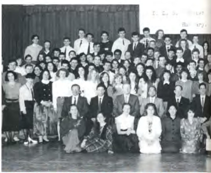
This is just one-third of the students who studied the Principle in

Another thing we realized is that the students need more than wonderful lectures and wonderful intellectual experiences. Intellectually they know the Principle very well. The question