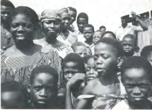
A few people from the small Benin fishing village represent the 150 members of their village and Christian church who now follow True Parents.

This witnessing condition was a great experience with Heavenly Father's deep heart. The language difference presented an additional external difficulty. Everyone knows how much Japanese people love to eat miso soup and rice everyday! Although the food