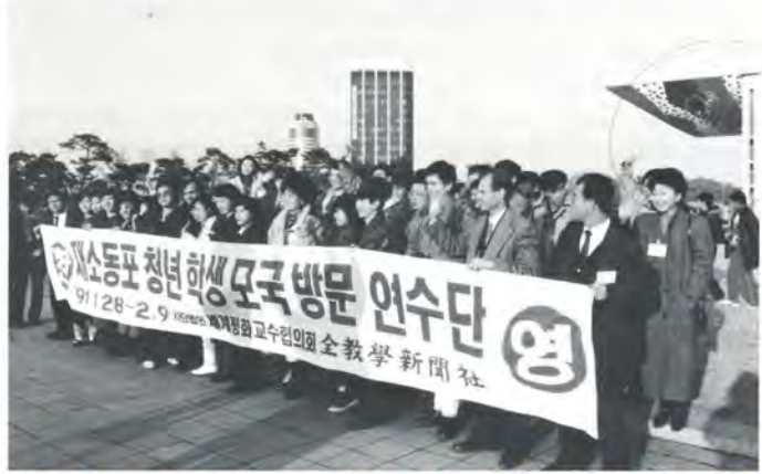
Soviet Koreans visit Olympic Park in Seoul during their first visit to their homeland of Korea.