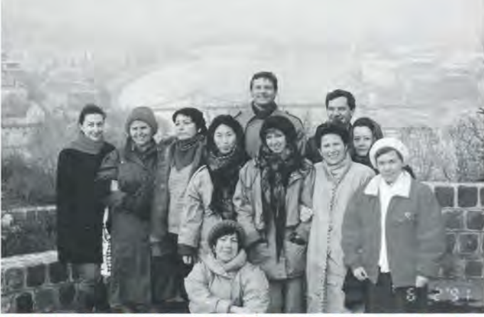
With the city of Budapest as a backdrop, a small group from the workshop huddle together in face of the Hungarian winter.