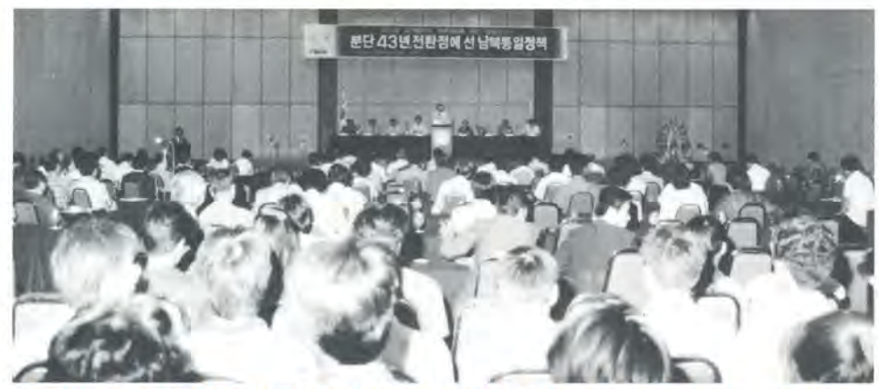
Participants attend the PWPA Conference entitled: "Policy for North-South Unification at the Changing Point."

chance to see such documentaries, since the government had forbidden showing movies about Communist China. However, now the government is eager to establish diplomatic ties with mainland China and was very pleased to see such an in-depth film on China introduced to the Korean people.