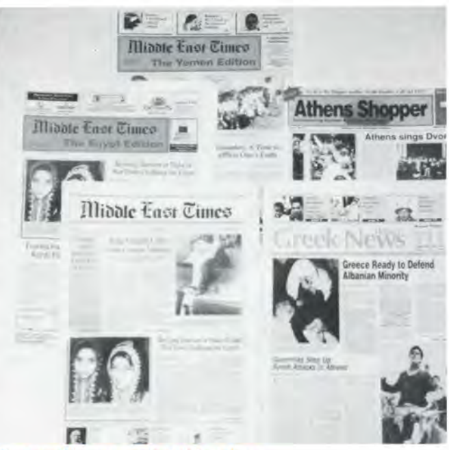
stagnant oil economy, Five weeklies are produced in Athens.

been a very good quality readershipthe diplomatic community, the international business community, expatriate English-speaking people within the region. In addition, there is a market that begins small, but is ultimately the most important and the biggest market: natives who speak English and appreciate a quality, objective, well-edited publication about their own region. This particular readership is the most interesting and has the greatest potential for growth, because everyone in the world is trying to learn English, with many of them having been educated in the West. This is the point of communication between the Western world and Middle East. Father has