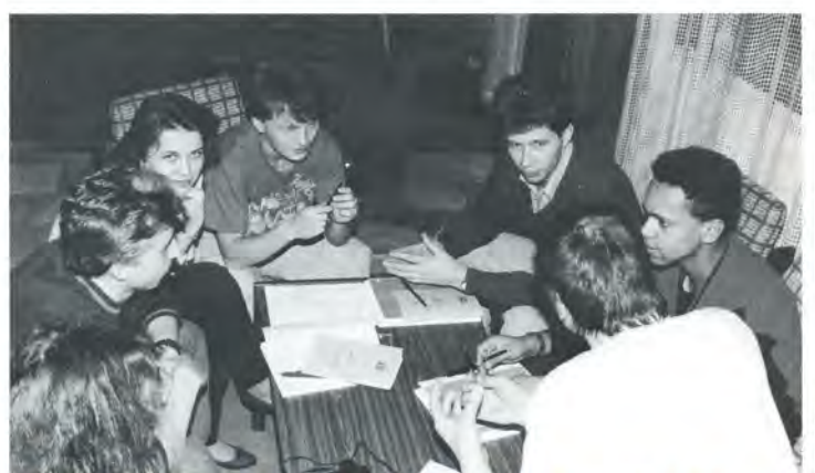
Discussion groups after each lecture were well-attended and animated. The students' questions delved into the depths of the Principle, enabling them to grasp the meaning and importance of what they were hearing.

One night we decided to pray. When there hasn't been a Christian foundation for three or four generations, it is awkward to even suggest prayer. We felt they had to experience prayer, first by being in an environment where we prayed and then by praying themselves. Some of the students were advanced from previous lectures; they had studied prayer and some were actually trying it. But most of the students didn't know prayer. So we decided to have an evangelical night at the end of one day's lectures. We closed by singing "God is not dead!" calling everyone up front in an informal group. Many people came reluctantly, while some just stood back. The majority of people standing up front were clapping, singing, and having a great time. Directly after that, I began to cry during an in-