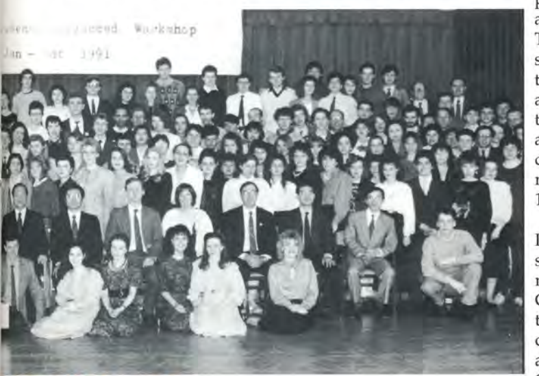
Hungary. What a crowd!