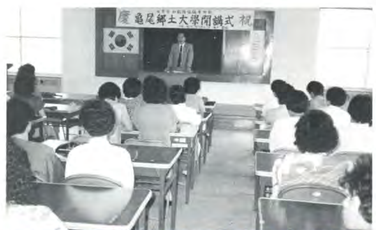
Housewives attend the community school where professors give lectures to help better the lives of families.

we sponsored a six month expedition to the Yangtze River in Mainland China, led by our Korean CARP Scuba Diving Team and accompanied by the Korean Broadcasting Station (KBS) camera team. A documentary film on the expedition was shown last month in a series of eight parts over two weeks on TV and gave a good impression of our work to the televiewers. Most of the Korean people have a great interest in China but have never had the