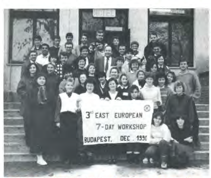
Guests from six countries joined together for a seven day workshop in Budapest, Hungary. The lectures were translated into Polish, Bulgarian, Czech, Hungarian, Serbo-Croatian and Russian.

earing Father talk about this condition at Belvedere gave me such a spiritual lift. Father said that 80 percent of the members were stuck on the individual or family level. After Father announced the pioneering I gave my biggest "Mansei" ever. I knew this was my opportunity to not only give love and truth, but to advance myself beyond the crippling family level. My goal was to leave as soon as possible, despite financial difficulties.