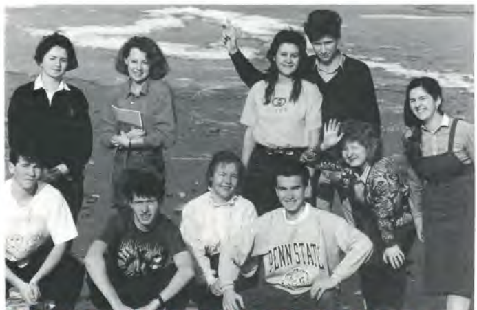
Nature walks, such as these students walking on the iced-over river that meanders through Hungary's capital, helped the Russian youth to "come out of their shells."