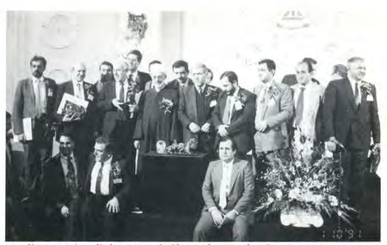
Muslims receive diplomas and gifts at the Graduation Banquet.