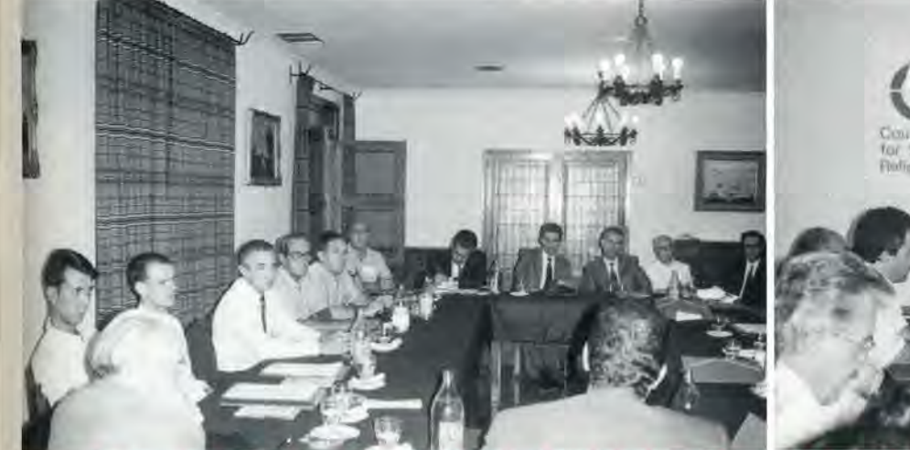
Religious leaders and specialists on national and ecclesiastic law discuss religion and the law in Spain.

The process of building peace and fostering spiritual integrity requires a greater commitment on the part of those involved and takes place one step at a time. For Spain, with a history that has witnessed some of the most profound and intimate cooperation among religions, as well as the worst kinds of persecution, this conference in Avila was such a step.