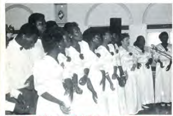
Our Unification Choir helps create a heavenly atmosphere during the evening.

The Unification Church Choir was chosen to open the religious night activities. Just prior to the event the three main Christian organizations, namely