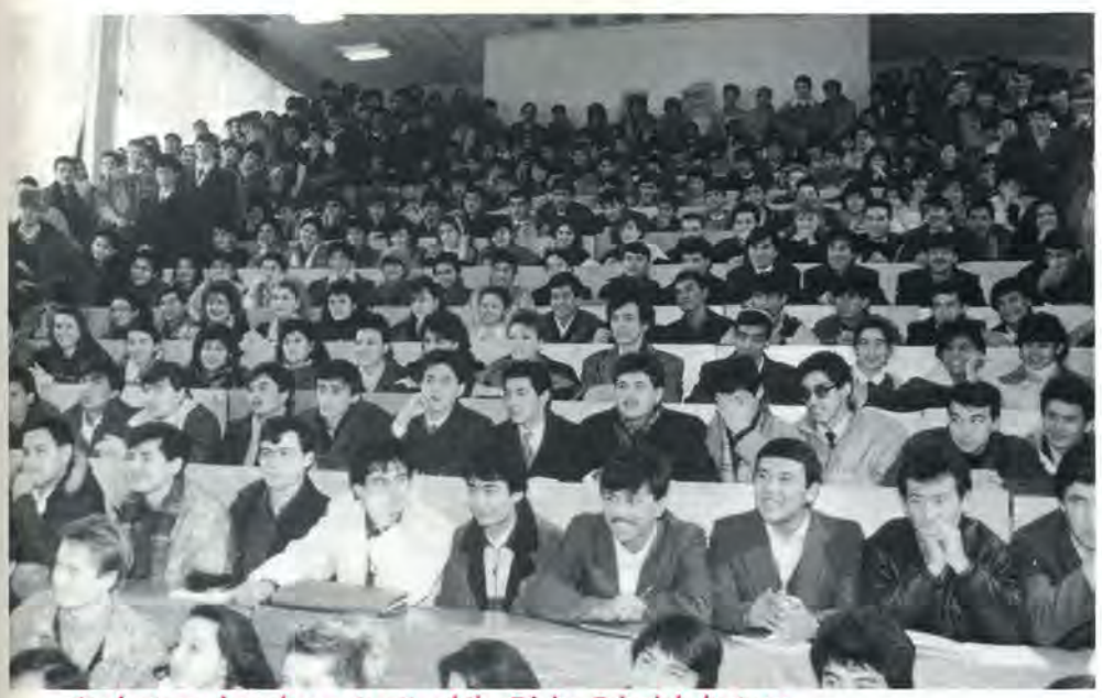
Students pack each row to attend the Divine Principle lectures.

dents are wary of messianic figures and universalist movements.