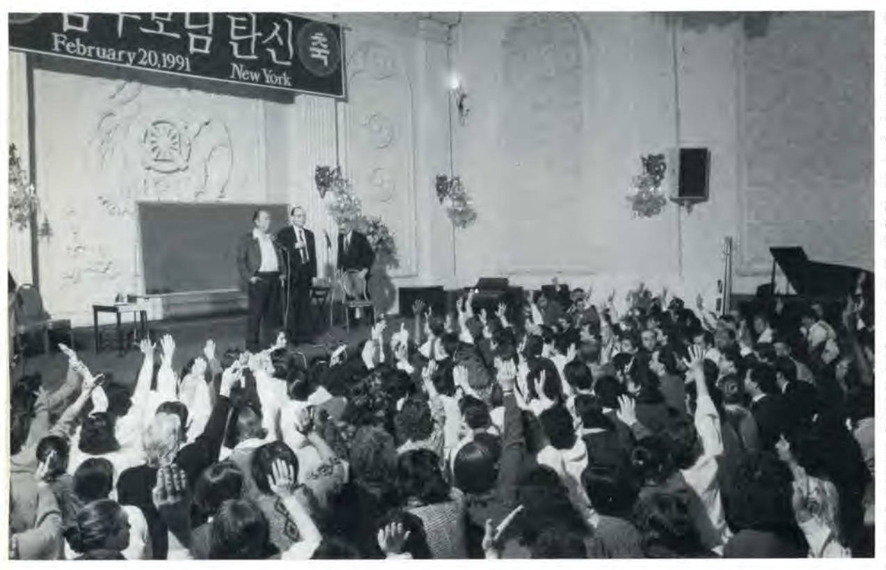
After all hometown work is completed, then a home nation is created. After home nations get together, they can be created into the original world.

how important the mission is in front of you-by understanding that you can follow my instructions to the letter. Which way do you think-"Today I listened to Father, but now I am going home and my agenda is different. I'm going to work for my children and with my little savings I want to buy a home?" Is that a true blessed couple? (No!) Today Father is making you a frontline soldier. Father does not vet have a restored hometown; it is still in North Korea. You have no nation; Father does not yet have a nation. We don't have our world, so we have a big job ahead of us.