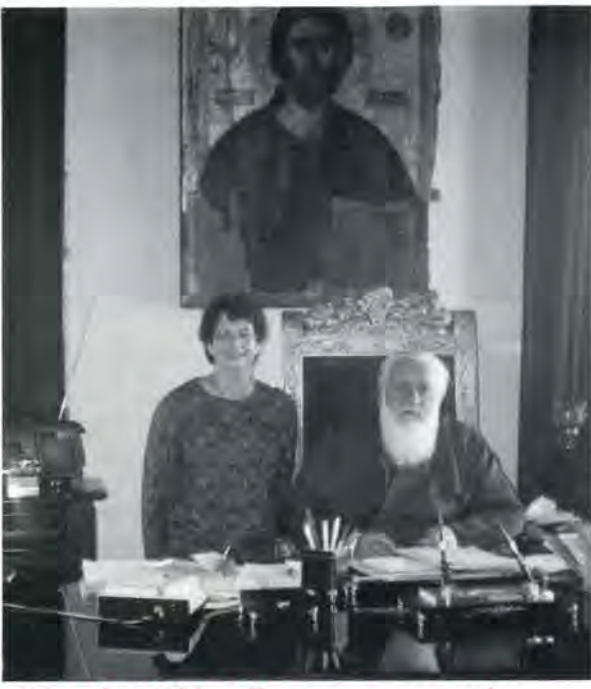
June and Archbishop Chrysostomos meet at the Archbishop's palace in Nicosia.

Cyprus has absorbed all the tourist industry from Lebanon and also has acquired much investment from the prosperous Persian Gulf area, hence the economic development of this nation has been quite successful. Cyprus is quite an international crossroad, ab-