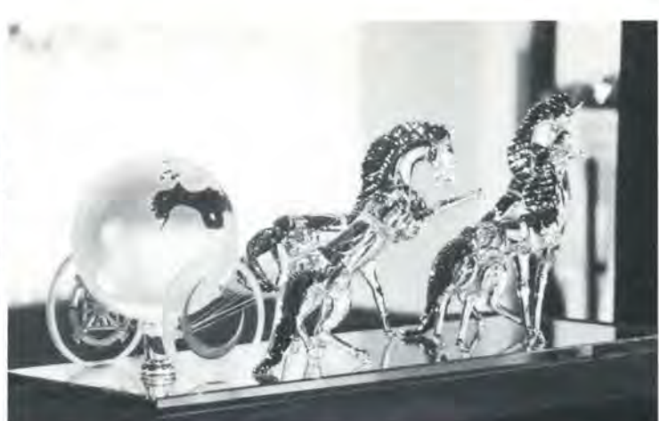
A beautiful glass image of a chariot carrying the whole world to God is presented to Grand Mufti Kuftaro.