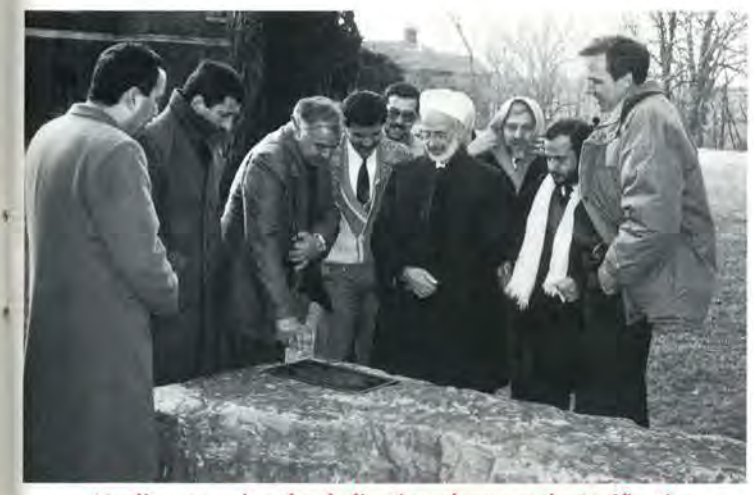
Muslims examine the dedication plaque at the Unification Theological Seminary.

True Parents invited them to East Garden where they recited poems congratulating Father as the "Conqueror of Satan." True Father responded by a moving speech in which he referred to himself and the Mufti as the two wheels of a vehicle which will carry the whole world to God. We were inspired by this