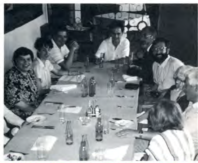
The ICF staff gathers with British and Bulgarian scholars to discuss the results of the summer school.

everything you did to send me to Poland. It was the best thing I've done all year. My students are insisting on me coming back. How can I go again?"