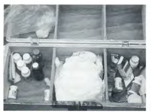
This IRFF pharmacy box is low on supplies, but the agent has carefully saved money to replenish it.

Our government had so little means to reach out and take care of the health of villagers in remote areas of the country. Some have not seen a health agent in 25 years. As our IRFF team worked in