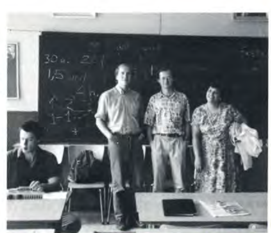
At a classroom in Sofia, Bulgaria, students learn English under the watchful eyes of Lenin and Dimitrov.

Volunteers began leaving for Bulgaria in the middle of June, and for Poland in mid-July. In Bulgaria, ICF acted in coop-