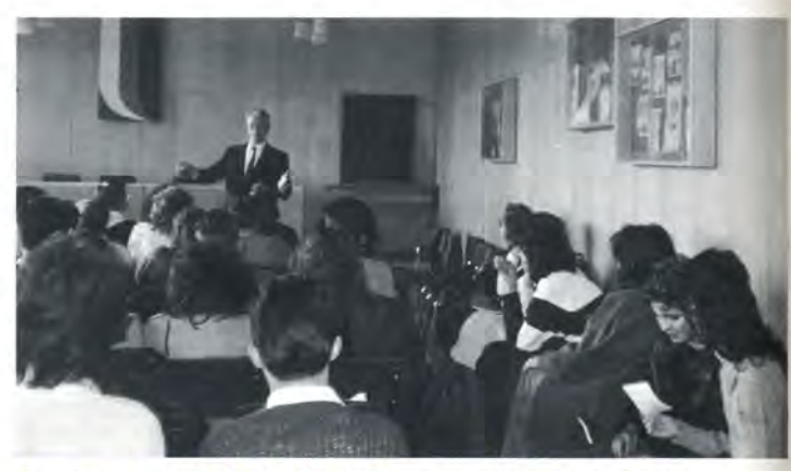
A lecture given to high school students and faculty in Veliko Turnovo, Bulgaria receives an enthusiastic response.

However, we could enter the university that day. When we arrived, there were only 5 or 6 students in the auditorium, so I thought that we were not going to have a big audience. I turned around and, suddenly, over 200 people came rushing into the room. They had been at the off-campus location. They had decided my lectures on religious history were not official, therefore they could attend. Over 250 students came to the