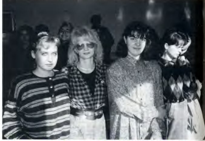
Students and teacher (second from left) meet together after a class at the Economska Scola in Nis, Yugoslavia.

There has been a missionary of the Unification Church present in Yugoslavia for ten years. A handful of members have joined in the country; all are from Croatia, the Catholic area of the nation. No Serbians have yet joined. Upon arriving