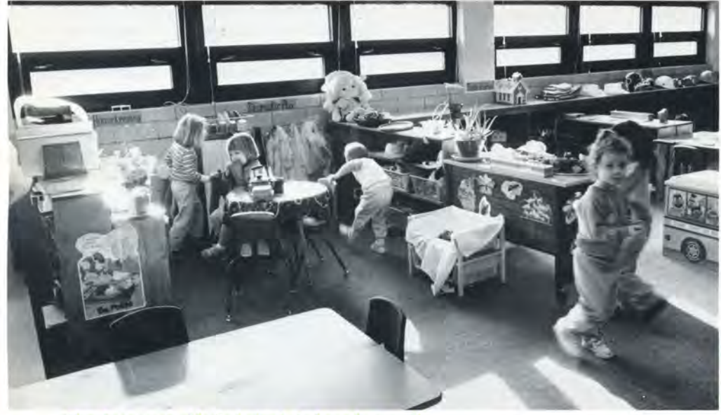
The three-year-olds find plenty to keep busy with.

A: Bringing in different experts is one of the things the PTA would like to do. Someone recently talked on parenting; while another speaker discussed marital relationships. This talk was important because much of the children's struggles result from how their parents relate to one another.