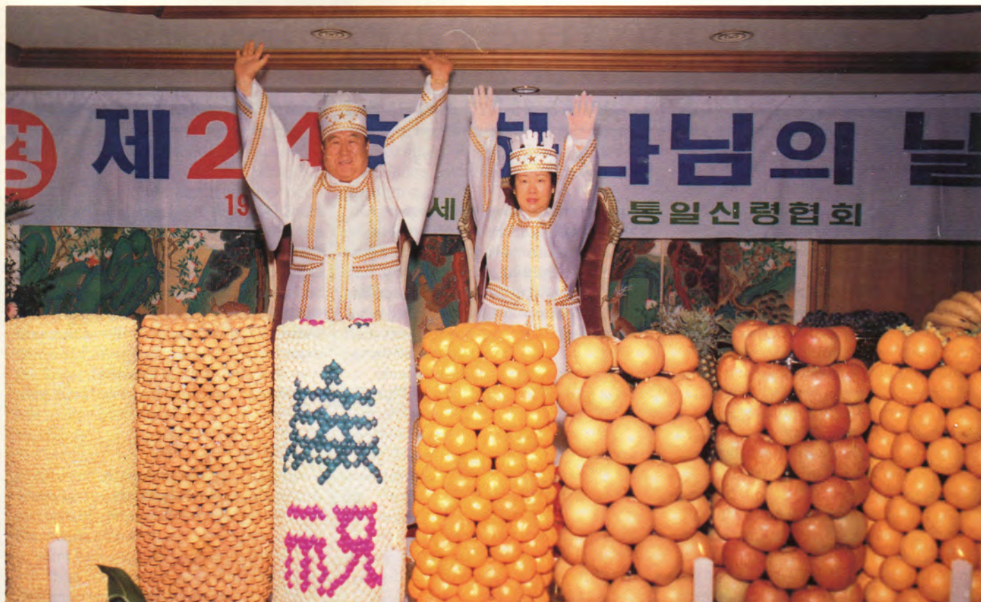
Father and Mother lead three mansei cheers after Pledge on God's Day morning in Korea.