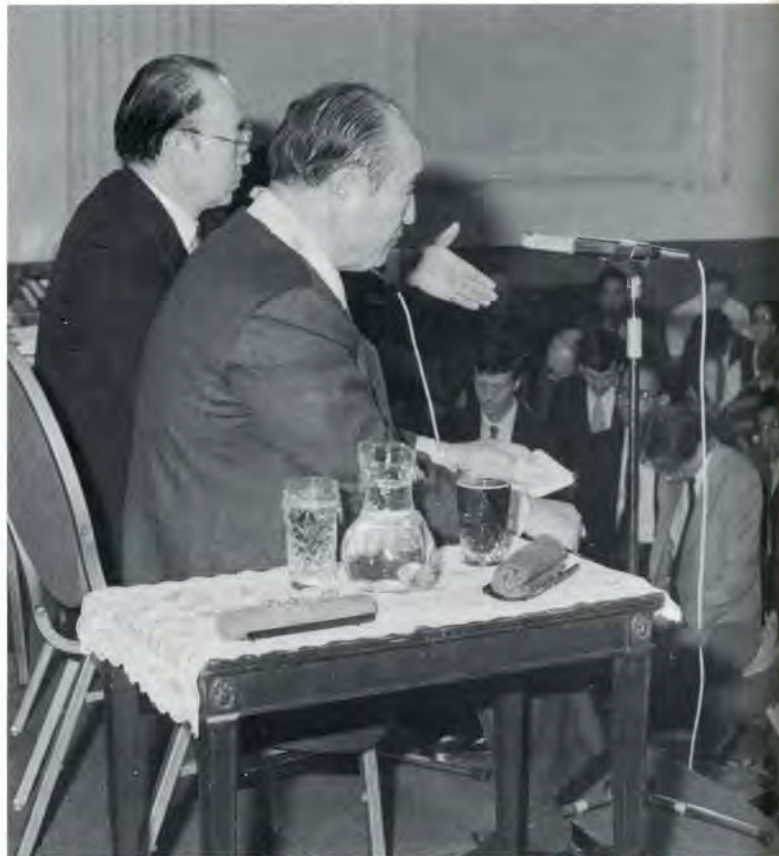
Father encourages blessed couples to keep growing spiritually and not to burden the Church or other people, while fulfilling our mission of true parenthood to our children and to mankind.

Why did I include the word "language"? Without language, no responsibility can be fulfilled. Heart-to-heart communication cannot take place. No relationship can be nurtured. When I use an interpreter, I feel only about 80 percent of my message is getting through to you. If you hear from me directly in Korean, it would be 100 percent.