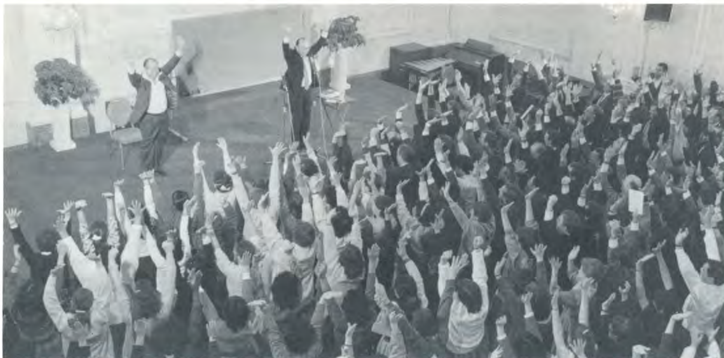
Blessed couples raise their hands to pledge their participation in True Parents' crusade of building God's Kingdom on this earth and to never disappoint True Parents and Heavenly Father in this quest.

you still cannot do it, then there is no hope.