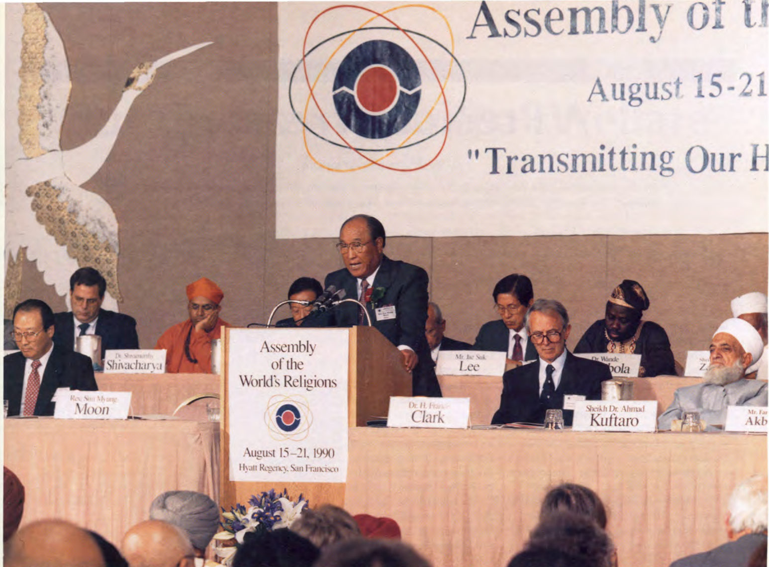
Father delivers the Founder's Address at the Opening Plenary Session flanked on the dais by the staff of the Assembly and its distinguished participants.

Only religion with a parental heart, a religion which practices true love, can accomplish God's Will in this hopelessly complex world situation. Thus far in history, there have been many religions. There have been religions in the position of adopted son, in the position of stepson, in the position of son, and so on. The religions in all the different positions should transcend any limited view that their own religion is the best, that only through their religion will world peace be accomplished. Rather, the teachings of religions in all the positions are eventually to be fused and united in the religion in the position of True Parents. Then, the decline that religions are experiencing will be ended. All religions, centering on true love, which exists absolutely for the sake of others, will unite and march forward to realize world peace and realize heaven on earth. Knowing this, we should proceed to solve the world's urgent problems by the right practice of religion. The tasks of changing ritualized faith into living faith, reestablishing the true value-perspective from the many confused value-perspectives, restoring the original human nature from deviated and desolate human nature, elevating the moral standard and liquidating the decadent culture—all are to be accomplished by men and women of religion joined together in an allied movement of the eternal God, practicing the true love of True Parentism.