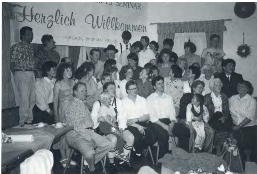
A joyful, unified "family" gathers after a lecture for the group picture.

At 7:30 that evening we returned to the inn for a cold buffet followed by a