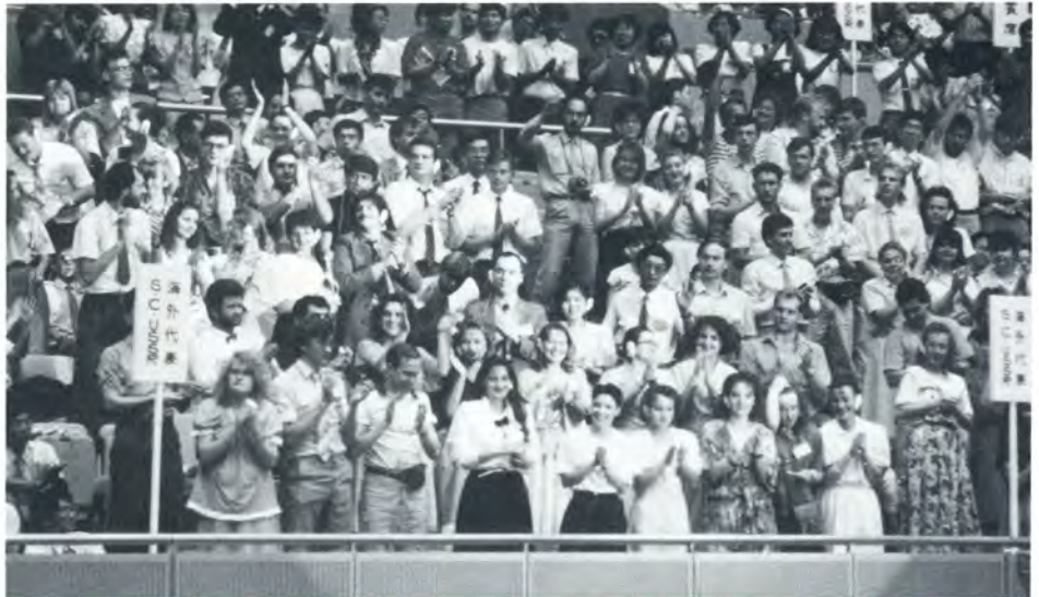
Soviet students rise and applaud in acknowledgement of their attendance at the Japanese CARP rally.

We have come from a country far but near. When we stepped onto this land for the first time, we had a nice impression of Japan. As we talked with our sponsors, our impressions have deepened.