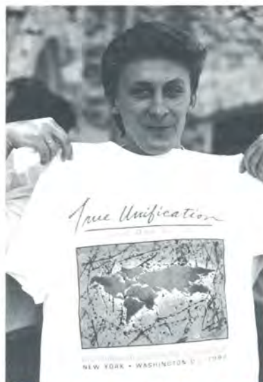
All participants received a colorful "True Unification" teshirt.

We developed a brand new, computer generated Divine Principle slide presentation. The computer has 16 million different colors. It would have taken thousands and thousands of dollars and so much time for other people to do it, but our members, our lecturers,