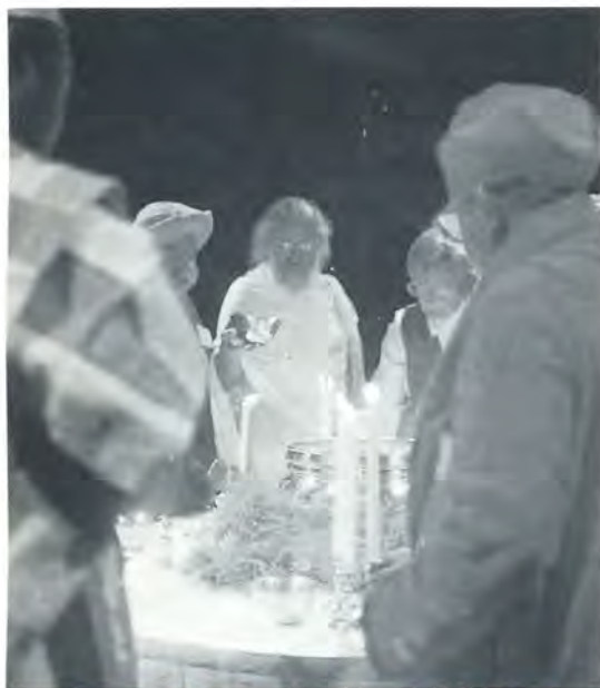
Assembly participants carry candles and contribute holy water from the originating places of their religious traditions.

Each morning there were prayer and meditation sessions offered in several religious traditions—Hindu, Muslim, Buddhist, Christian, Shinto, Jewish, Native American Indian, Zoroastrian and others. While services were held according to the practices of specific traditions, they were completely open to persons of other traditions, so that each participant could choose which to attend on