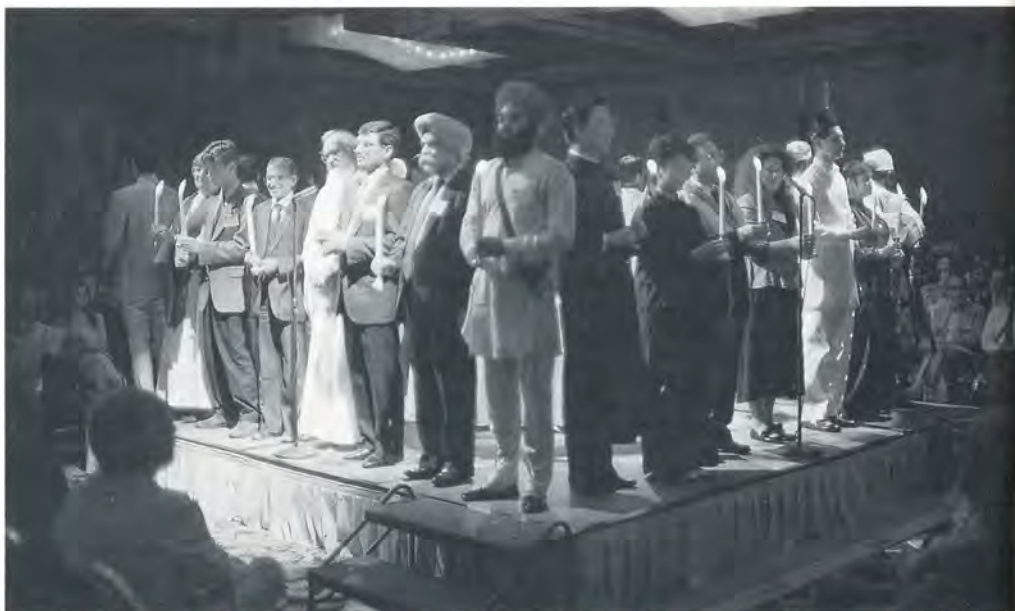
Participants from all the religious traditions reverently gather during the Opening Ceremony.

This year's Assembly started, first of all, with a lot of hard work. One of the greatest religious experiences one can have is the feeling of utter dependence on God—that we didn't come into being on our own, and we don't ultimately sustain our existence by our own power. That is a feeling one can have with the Assembly, because it is the coordinated