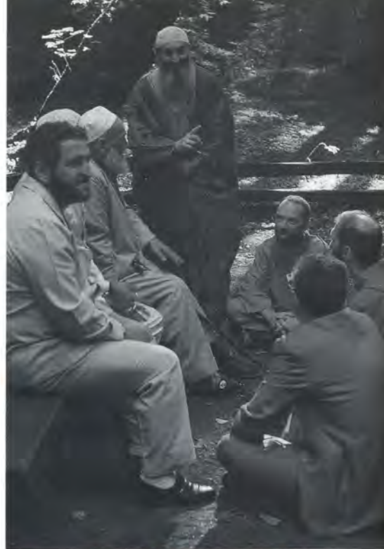
Open and fervent dialogue among the participants contributed greatly to the process of healing and understanding differences.

I loved the intensity of the combination of eager minds and different energies working towards more understanding and peace, trying to work it out in one's own way. Going back from the group discussions after hearing the baring of hearts and honest opinions and asks oneself, "Is that really the way