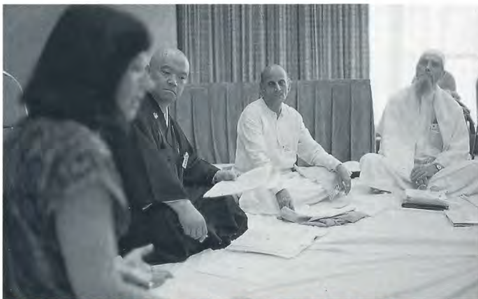
Participants in one of the many varied workshops offered at the Assembly.

To see people of all faiths, races, nationalities and persuasions come together as brothers and sisters in a single family gave me great joy and inspiration. I thank you deeply for creating such an opportunity and environment for loving and peaceful communion. May Allah grant that your work continue with ever