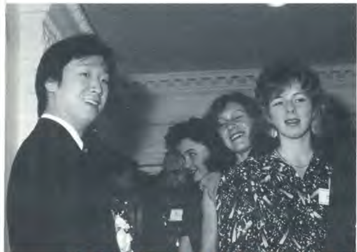
Hyo Jin Nim greets each of the participants at one of the opening banquets.

One of the participating professors from the Academy of Sciences said, "This is the most well-organized conference I ever participated in." He was so inspired. We made a videotape of all the lectures and slides, so that through them, many people can be educated.