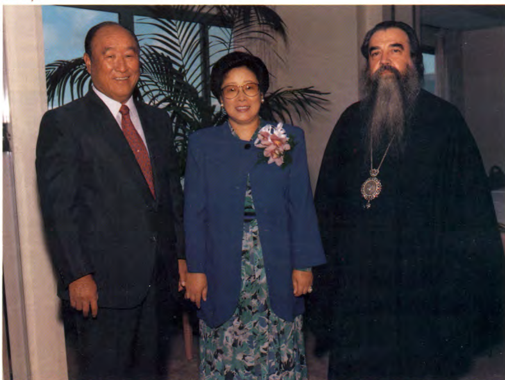
Father and Mother meet with Metropolitan Philaret, the Patriarchal Exarch of Byelorussia.

There are many international organizations that are seeking to promote interfaith encounter and dialogue. But the efforts of the International Religious Foundation are unique in several re-