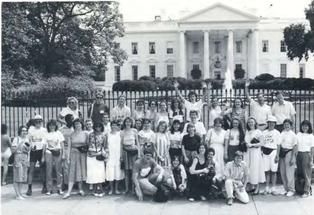
During their stay in Washington DC, the students get a chance to visit the White House.

We had one small problem. One university petitioned us because of their high academic standard to include some of the applicants we had rejected. We honored their request, but these students were not motivated to listen to the Divine Principle, so they complained when they had only one day of sight-seeing in New York and then went to workshop at the Unification Theological Seminary. We were very patient with them, however, and gave them love, and finally when they left for the Soviet Union, the ones who wept the most in the airport were the ones who had been initially the most uncooperative. One night at the Holiday Inn in Maryland, several of these difficult people got together and had a meeting until 3 or 4 o'clock in the morning. They came to the conclusion that they had been wrong. They decided they had been arrogant and had misunderstood our hearts. They had felt we