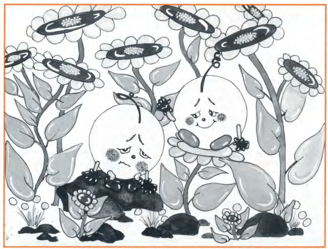
Pudgie asks a scowling Wudgie to take a walk with him.