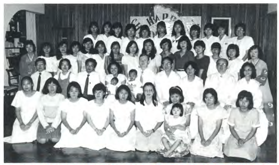
Brothers and sisters gather for Children's Day celebration in Kuala Lumpur, Malaysia.

One impressive point in the Philippines is the level of contact with politicians, religious leaders, and academic leaders. They have established strong contacts that members have developed over the years. I could meet politicians and presidents of universities who were connected to CAUSA, the World Media Association, and PWPA. I spent a whole day just going from one congressman and senator to another, speaking to them about all the projects that Father is doing. I was amazed at how open they were, and also I was very surprised that