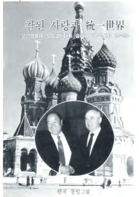
Cover of Father's speech distributed to the Korean audience.

The recent meeting between President Gorbachev and Rev. Moon signifies the fact that the worldwide foundation for unification of North and South has been set. If the 12th World Media Conference and the 4th Summit Council for World Peace can take place in Pyongyang, the unification of North and South is just a matter of time.