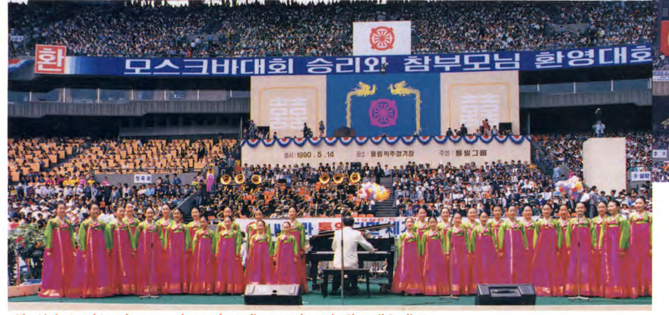
The Little Angels' performance charms the audience at the main Chamsil Stadium.

The worldwide foundation of the Unification Movement has been influential in not only America but also communist countries. In his speech, Rev. Moon announced that: "I have placed Unification Church mis-