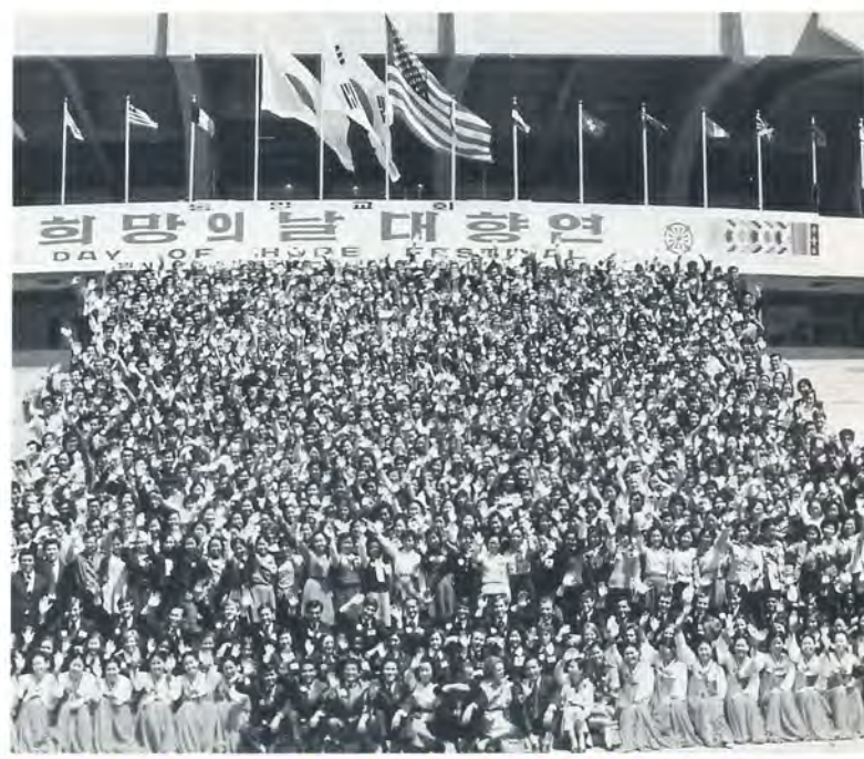
Church members gather for a kick-off rally for the International One World Crusade in 1973.

Father was desperately serious. He compared communism to Goliath and the Unification Church to David. Like