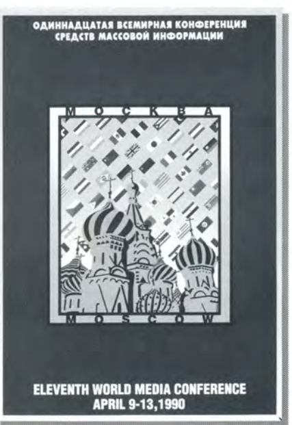
11th World Media Conference pamphlet.