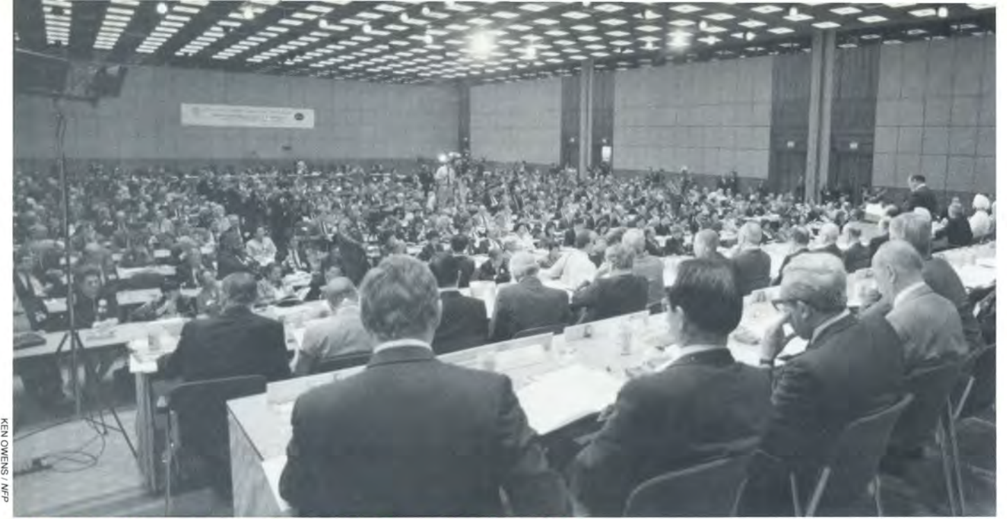
The 11th World Media Conference convened in Moscow on April 10, 1990.

Most people were amazed that Father would deliver such a spiritual address. It was definitely unusual fare for a conference on media. Still the Soviet press played it very big, giving it front page coverage in Pravda and Izvestia. The official Soviet news agency TASS sent the story around the world. Novosti Press Agency, our co-sponsors of the conference, had no fewer than six television cameras covering the events at all times. I was even approached by the Moscow bureau chief of the North Korean newspaper The Workers' Daily for an interview. He asked me if Reverend Moon would be willing to hold such a conference in Pyongyang. He was shocked when I told him, "Of course he would."