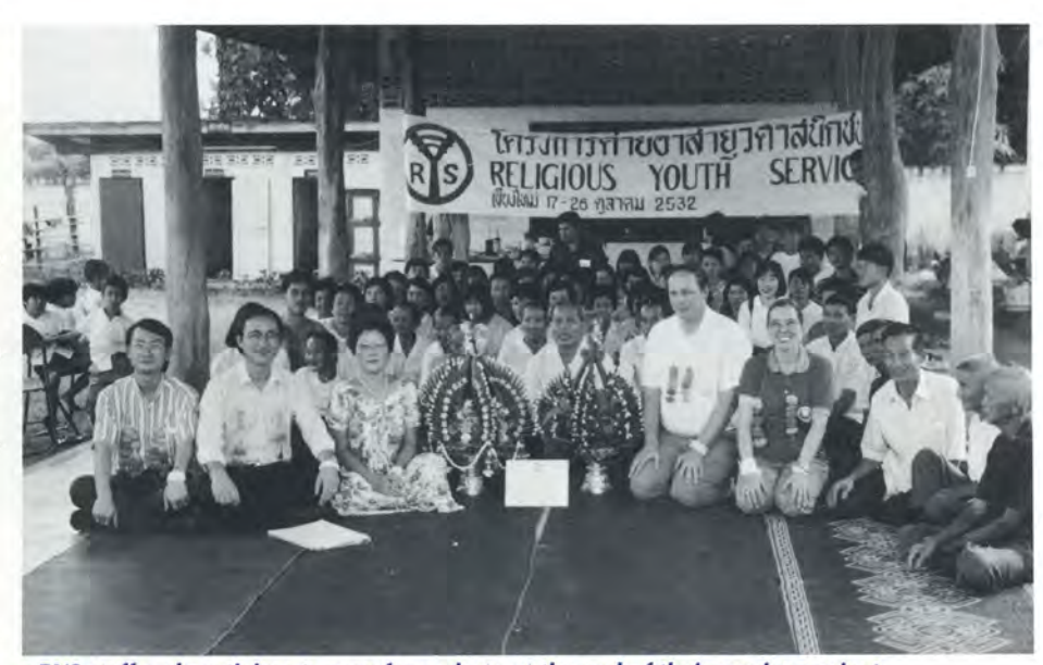
RYS staff and participants pose for a photo at the end of their service project.

The second day was dedicated to a religious study tour visiting a Buddhist temple, a Muslim school, a Protestant university and a Catholic cathedral. The participants were impressed by the warm welcome we received at each site and the informative lectures by the leaders of each place. When it was time to say good-by to the chairman of the Interfaith Forum and his wife, Professor