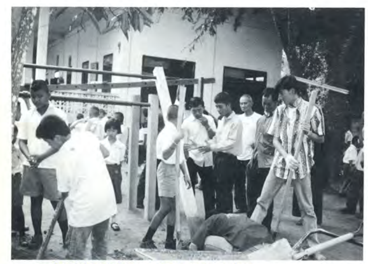
Participants busy at their work project.

On the last day, the villagers performed a very special ceremony, during which the old people of the village put