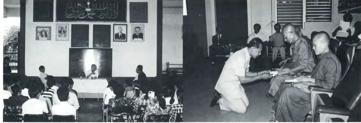
Learning about different religious traditions