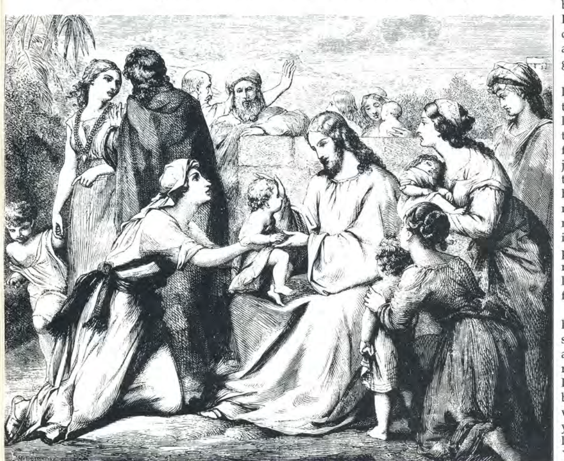
"Let the children come to me, for to such belongs the Kingdom of Heaven." (Matt. 19:14) It is our responsibility to restore the pure, filial relationship to True Parents.

It is inevitable that you will have subject and object relationships in your lives. You can dispel all your arguments and discontentment if you have a full grasp of the Principle. You won't need anybody to tell you what to do and what not to do. You will guide yourself. You will absolutely follow Father without any question. You have to earn this understanding. Pray and really try to do it on your own.