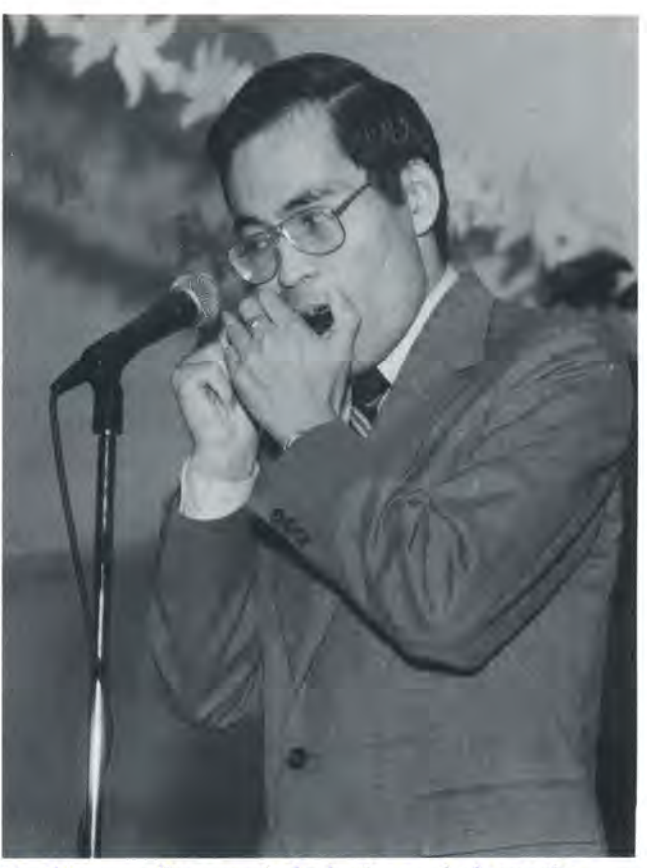
Dr. Shimmyo offers a musical selection on the harmonica for True Parents at East Garden.

Lots of things exist that seem to be impossible. Sometimes you probably become frustrated or even overwhelmed because of this situation. But as long as you are ready to serve for the sake of