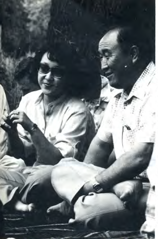
Father and Ye Jin Nim on an outing in England.

out upsetting the well-prepared food. It was like those famous French waiters racers who run as fast as possible with full glasses of wine, trying not to spill a drop.