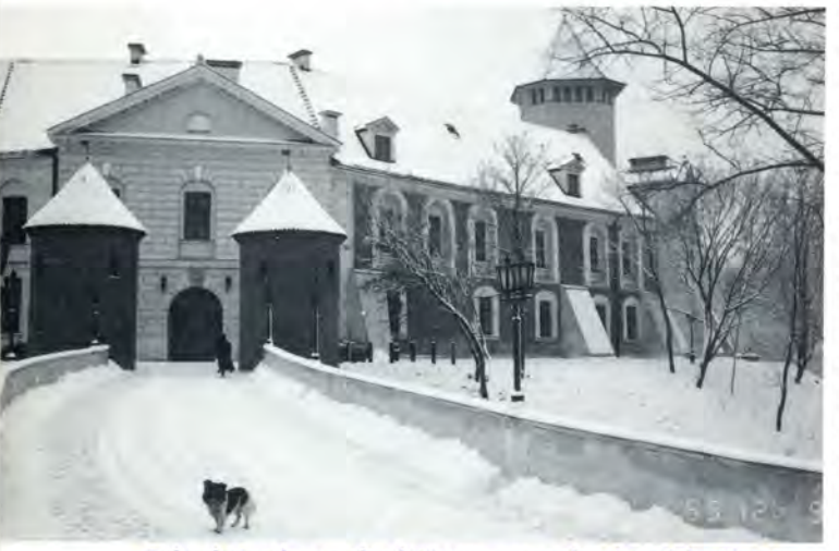
Pultusk Castle, north of Warsaw, was the site of the ISUM conference.

There is a very unique struggle going on in the Orthodox Church in Russia. Most people are now pushing for religious liberty in Russia, but the Orthodox church is not. There is a temptation not to advocate religious liberty because when the Russian Orthodox Church