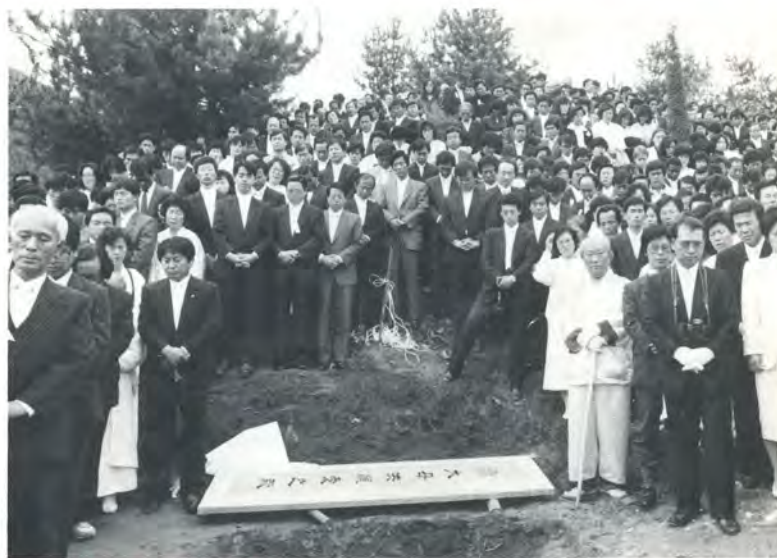
Prayer by the congregation.