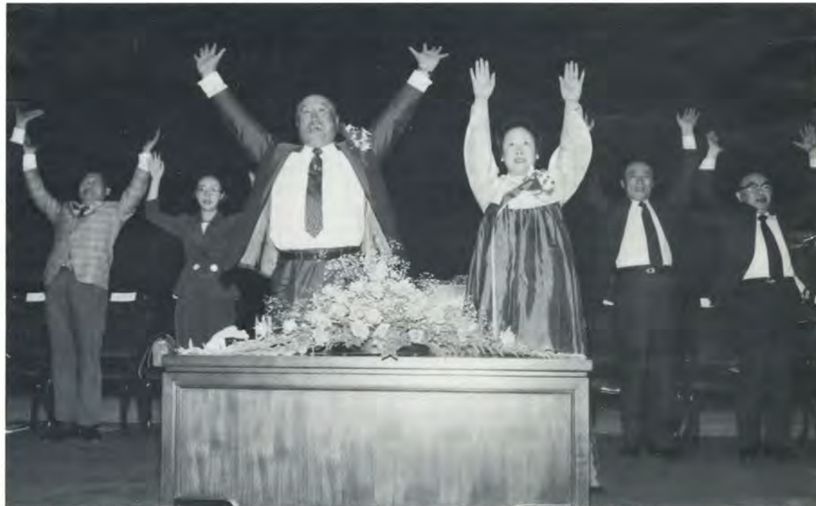
True Parents lead a Mansei cheer in Korea on Foundation Day for the Nation of the Unified World, October 3, 1989.

Our life on earth is a training ground for love. We are training in the different kinds of love we need to master. Who is the trainer of love? For the parents, the children are the trainers who teach them to love. The trainer for God was Adam and Eve. The vertical love wants to expand itself into the horizontal. Parents want children to love each other more than