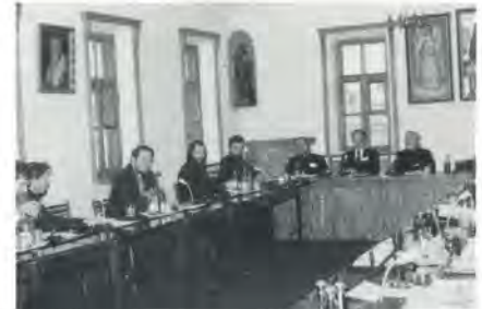
CWR in Moscow