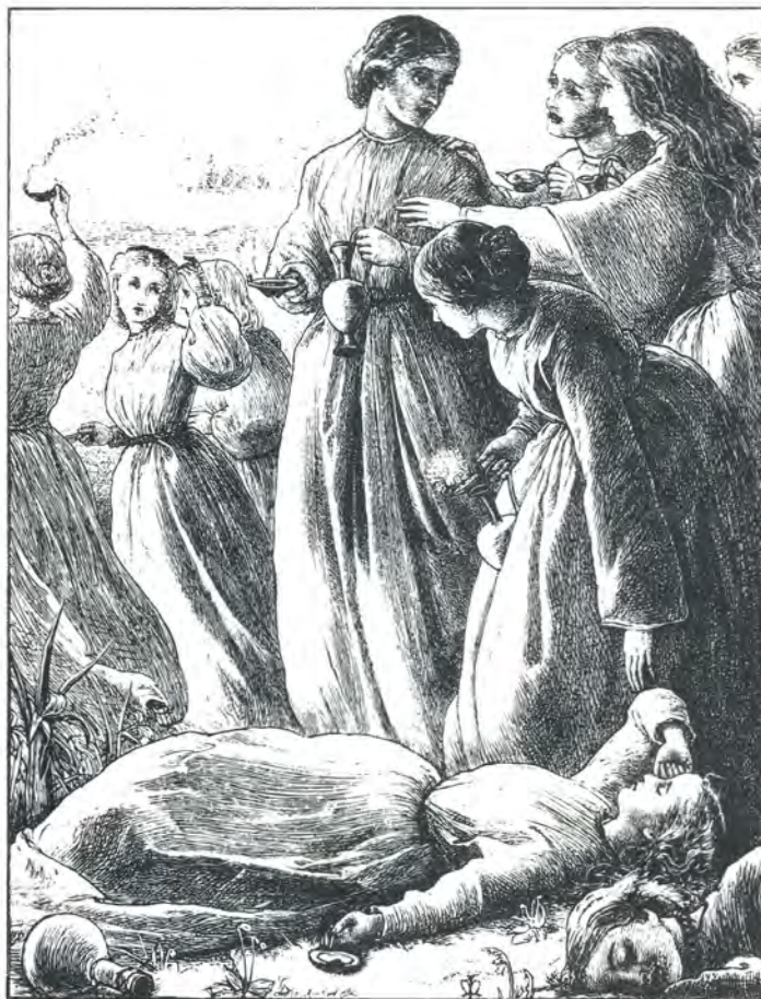
The wise and the foolish virgins.

For us to have the Kingdom of Heaven in the spirit world, there has to be a Kingdom of Heaven on earth. God exists in