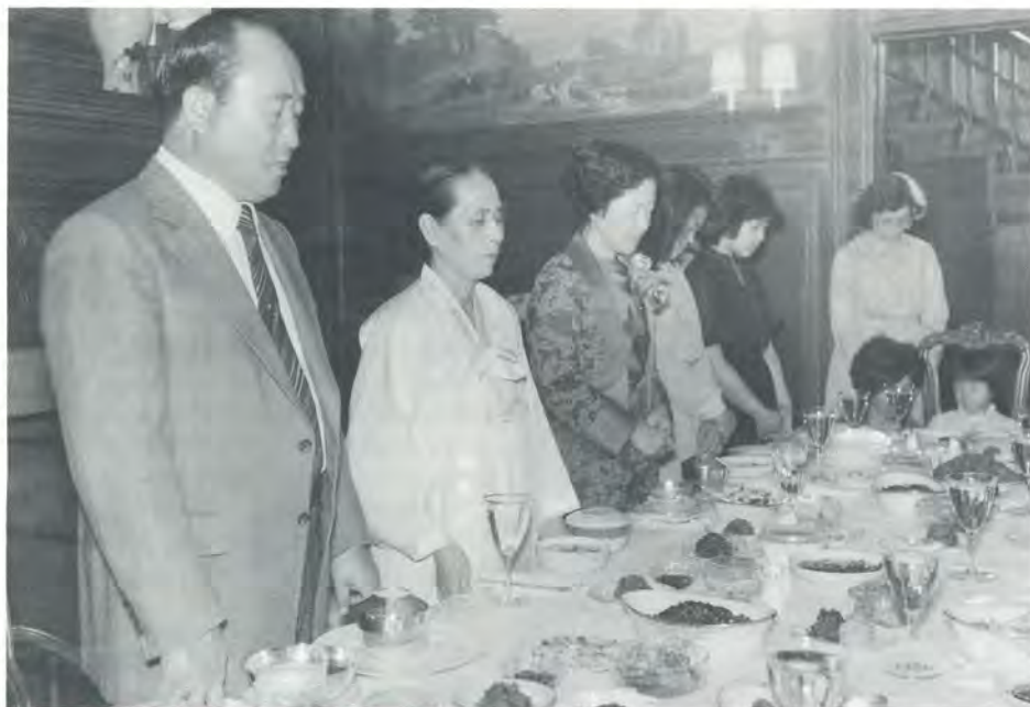
Father offers a prayer at East Garden.

I said to him, "Is he not the man who is to come?" Shortly after that, I became