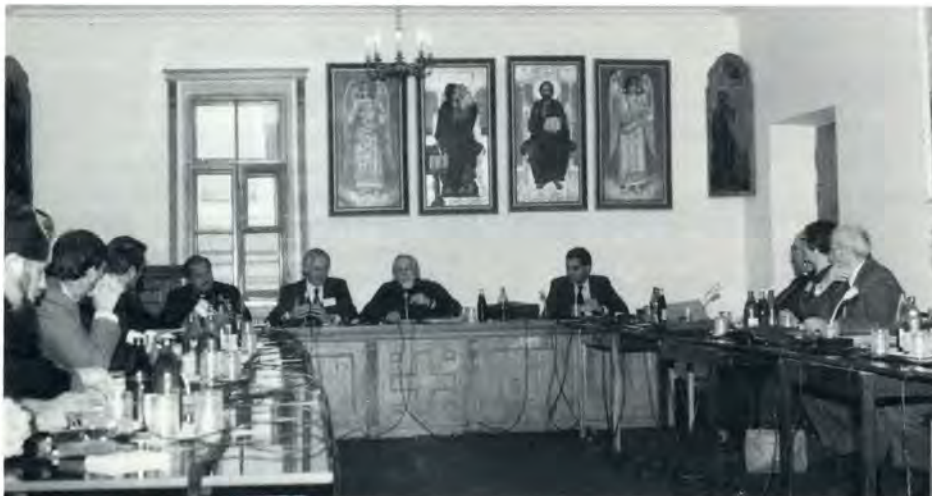
Russian and Western theologians exchange viewpoints at the Danislovski Monastery in Moscow.