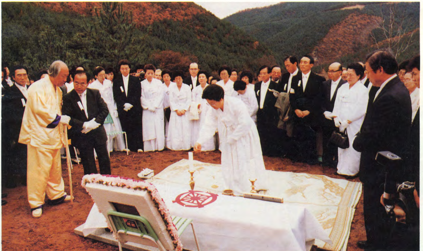
True Mother offers incense at the Ipjun Ceremony.