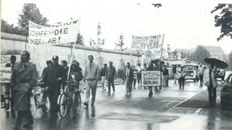
"It was thrilling to be in that part of the world as the Berlin Wall gave way."

As we bid farewell to Moscow I was grateful to Father for providing the vision and leadership which is now bringing about the unity of the entire world. Throughout the trip I could see the hand of God moving and His love penetrating into a darkened world trying to break out of spiritual ignorance. Each fact-finding trip WMA has taken to the communist world has been a condition for God to move and shake the foundation of that atheistic society. We are now seeing the results of our Father's prayers and work. □