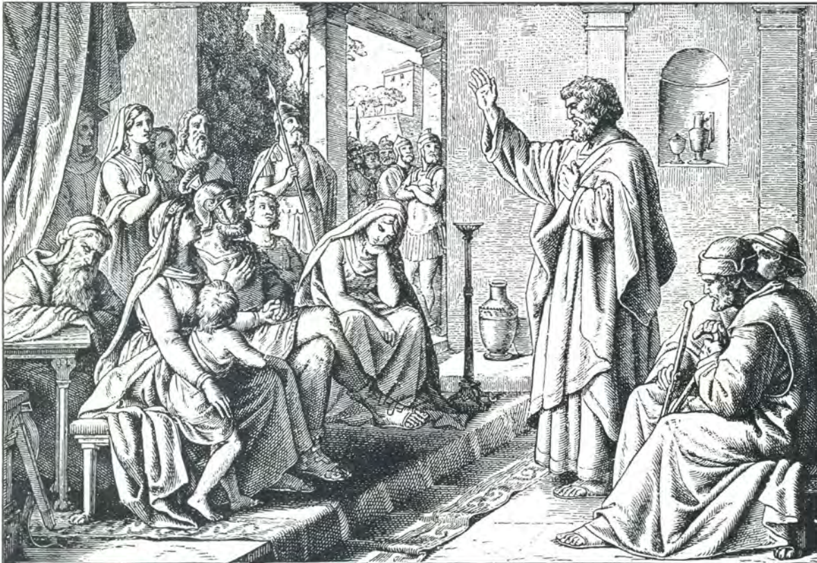
Peter in the house of the centurion Cornelius.

In conclusion, when you try to build your leader consciousness, you must first unite with your own leader. You have to report to him always and receive advice. In my situation, I need to receive advice and guidance from True Parents, who are my leaders. The real meaning of being a true dominator is to first be someone who is dominated well. In other words, someone who can be dominated by God and True Parents can become a