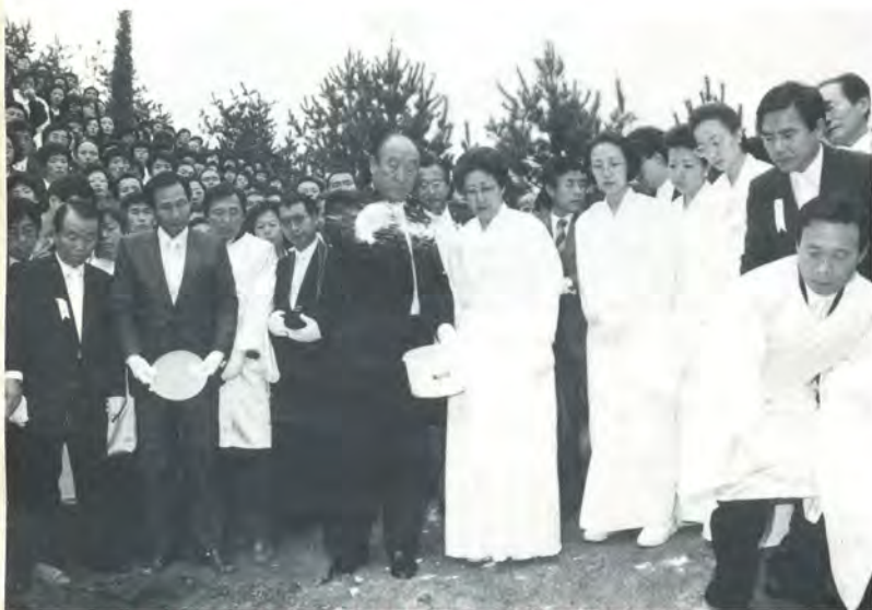
Father sprinkles Holy Salt at the Wonjôn Ceremony.

Through their victorious demonstration of faith, their untiring devotion and absolute dedication to me, Mother and Grandmother Hong were victorious. Therefore, after achieving this condition of universal victory, I have now decided to give Grandmother Hong glory as the mother of Mother. In her own lifetime she must receive the respect, admiration, and glory that are due her. If she died without receiving that glory, it would affect the coming generation of children. It is according to the Principle point of view that I am now treating her differently. □