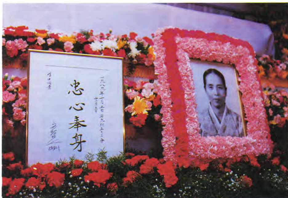
Father’s calligraphy reads, “Loyalty of Mind, Dedication of Body.”