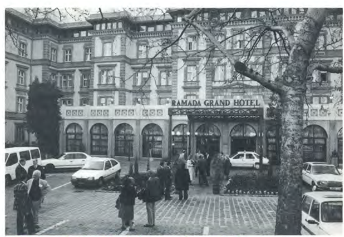
The Ramada Hotel hosted our conference in Hungary.

Finally, we arrived in Russia which is the country in greatest crisis. You immediately sense the heaviness there after visiting Poland and Hungary. In Poland the atmosphere is wide open—people who once fled from there to the West can now go back without any problems. But in the Soviet Union, the atmosphere was very different. They have had communism for 70 years. As a result, everyone is conditioned to be dependent on the government. In Poland and Hungary, the older generation still remembers responsibility, tradition and relig-