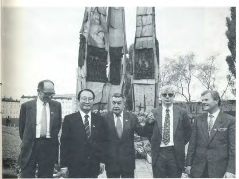
In front of the Solidarity Monument.

South Korea and Eastern Europe were also established. If you look at a map, the Soviet Empire with Siberia is enormous. Yet little South Korea is producing a huge amount of economic goods in comparison to this empire. From a geographical standpoint it doesn't make any sense. It is clearly a difference in culture and system. The Eastern European economy is in a crisis which forces them to reach out to other countries. They are especially reaching out to South Korea because of its huge accu-