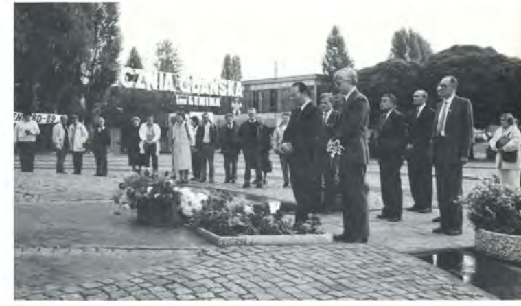
Laying flowers and praying at the Solidarity Monument.

The next day we went to Krakow, Poland, which is the center of Polish civilization. A line of kings who ruled Po-