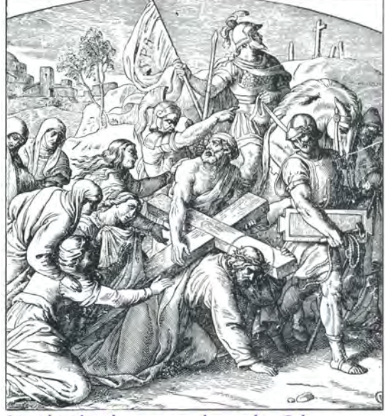
Jesus bearing the cross on the road to Calvary.

When people argue about something you have to embrace them with this power of love. You have to face your opponents and forgive them so that your own repentance will be actualized