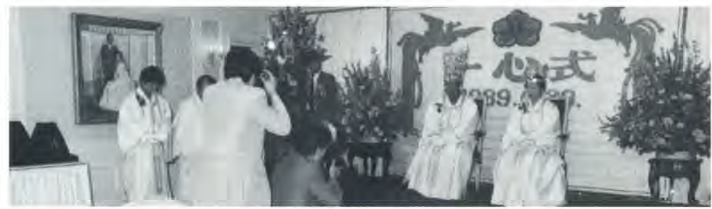
Pictorial Highlights of 1989-One Heart Ceremony