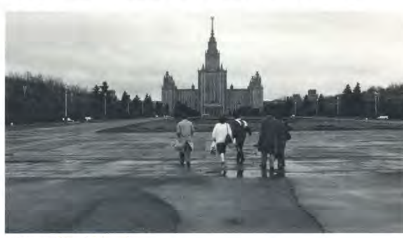
Moscow State University.

me to a theater in the suburbs where a professional production of The Gulag Archipelago was performed openly. I was able to go to the homes of Russians