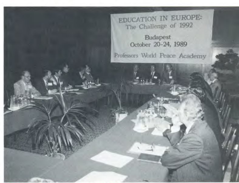
PWPA Conference on Education in Hungary.