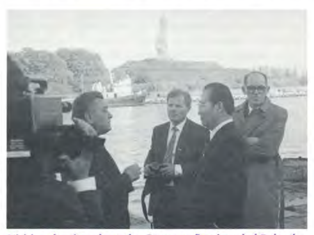
Visiting the site where the Germans first invaded Poland in 1939.

land from the tenth century had their headquarters there. Then the Jagiel Dynasty established Jagiel University, which is the intellectual center of Poland. When the communists took over, Krakow was the city that would not yield. In spite, the communists built a steel mill just 15 kilometers west of the city, so the pollution would affect the city. New people were brought in to change the political balance of the district toward Marxism. A number of professors were killed. This was one of the