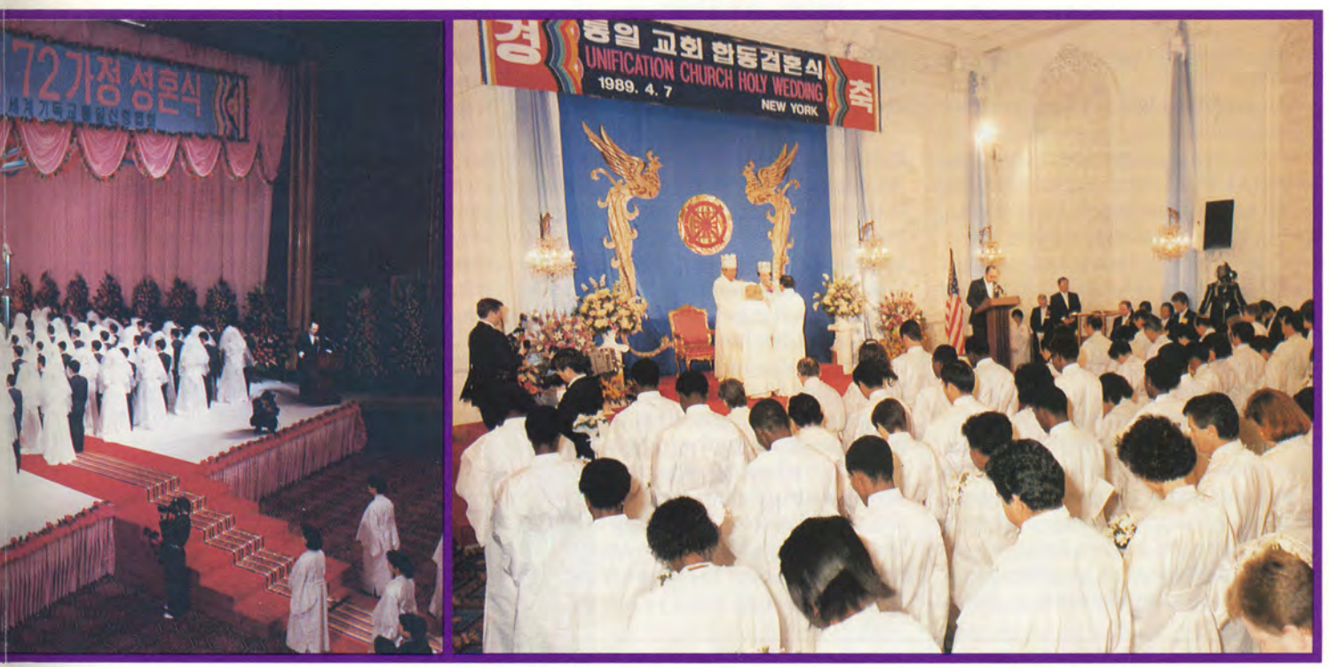
ea on January 11.