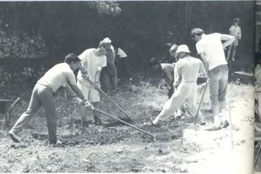
Before the training center could be built, the ground had to be cleared.

Thirdly, RYS is dedicated to service. In my understanding service is the opposite of selfishness. Through service,