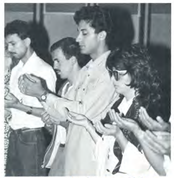
Muslim participants share their prayer with the group.

t is amazing how God finds a way to remind me of the poor in my country. I thought that for a while it would be okay to forget the work that I do back home in the Philippines and to have some time to be a little "selfish." But once touched, I guess one remains attached to whatever it is that has given one meaning through all of his/her life. Almost always this project makes me sensitive to the deep interrelationship we have with each other and with everything. Sometimes the effect is simply overwhelming. It becomes a profound truth that indeed human beings are human beings wherever they may