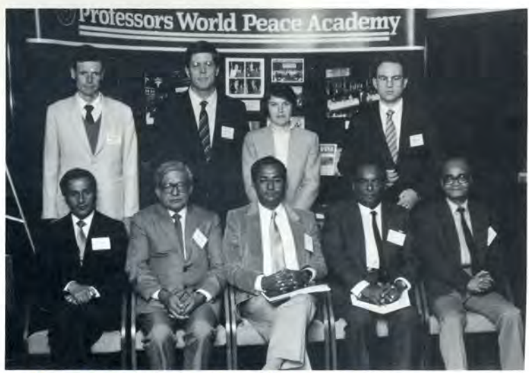
Leaders of PWPA in South Asia pose for a group photo.

Among other things, the PWPA Congress always provides a big boost to the host country; in this case, England and