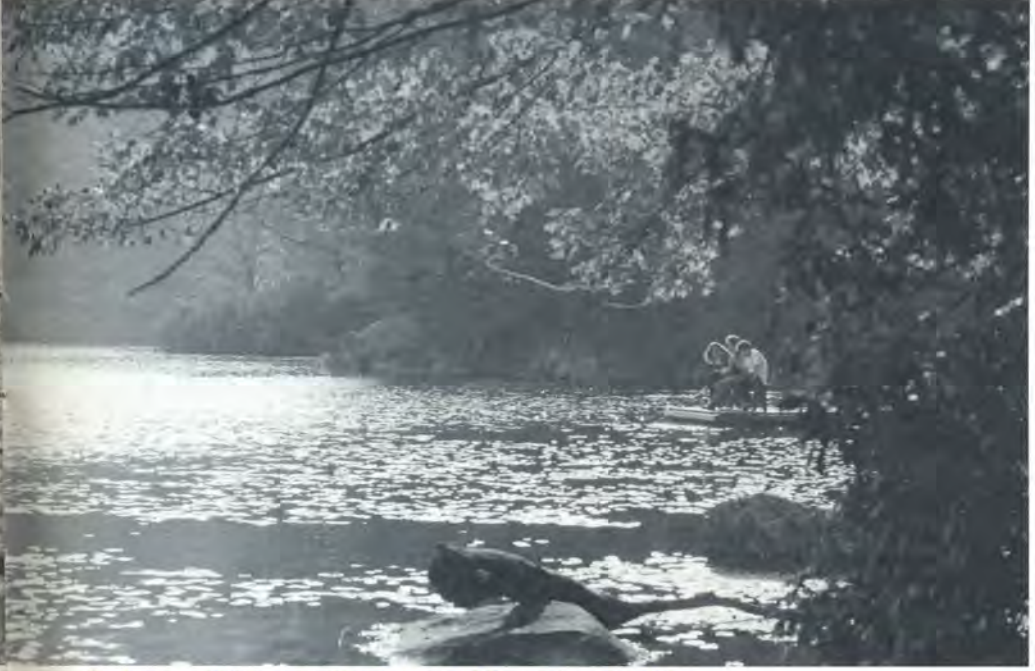
Brothers and sisters meditate at one of Camp Sunrise's lakes.

That's the only way we can march to our goal and attain it. This is the right attitude that we must all share. I sincerely hope everyone can renew their commitment during this short period of time. Please keep it with you, living it for the rest of your life. If you can do this, I can respect you with my arms raised. I am grateful to Heavenly Father and True Parents for giving me the Principle that is making your lives change. That is what means everything to me and it should to you also. Thank you for inviting me here and now I would like to sing some songs for you.