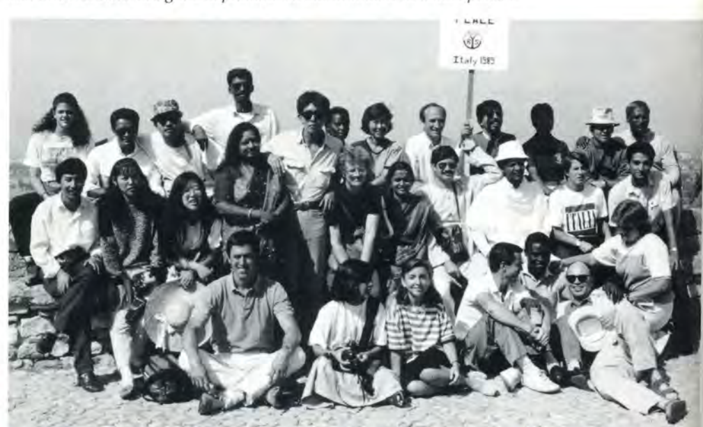
Interfaith youth, pilgrims for peace, pause together during a prayer walk through Assisi.

pants can learn through educational programs, visitations, group dynamics, personal interaction, cooperative labor and reflection. The young people are often in situations which challenge their cultural and religious viewpoints. This challenge is designed to deepen awareness and encourage respect of the participant towards other traditions, as well as heighten the appreciation of one's own religious roots. The three weeks when participants physically labor in disadvantaged communities provides situations where lasting friendships are bonded through common work objectives. The concluding program is a five day reflective period that was held this year in the famous pilgrimage city of Assisi.