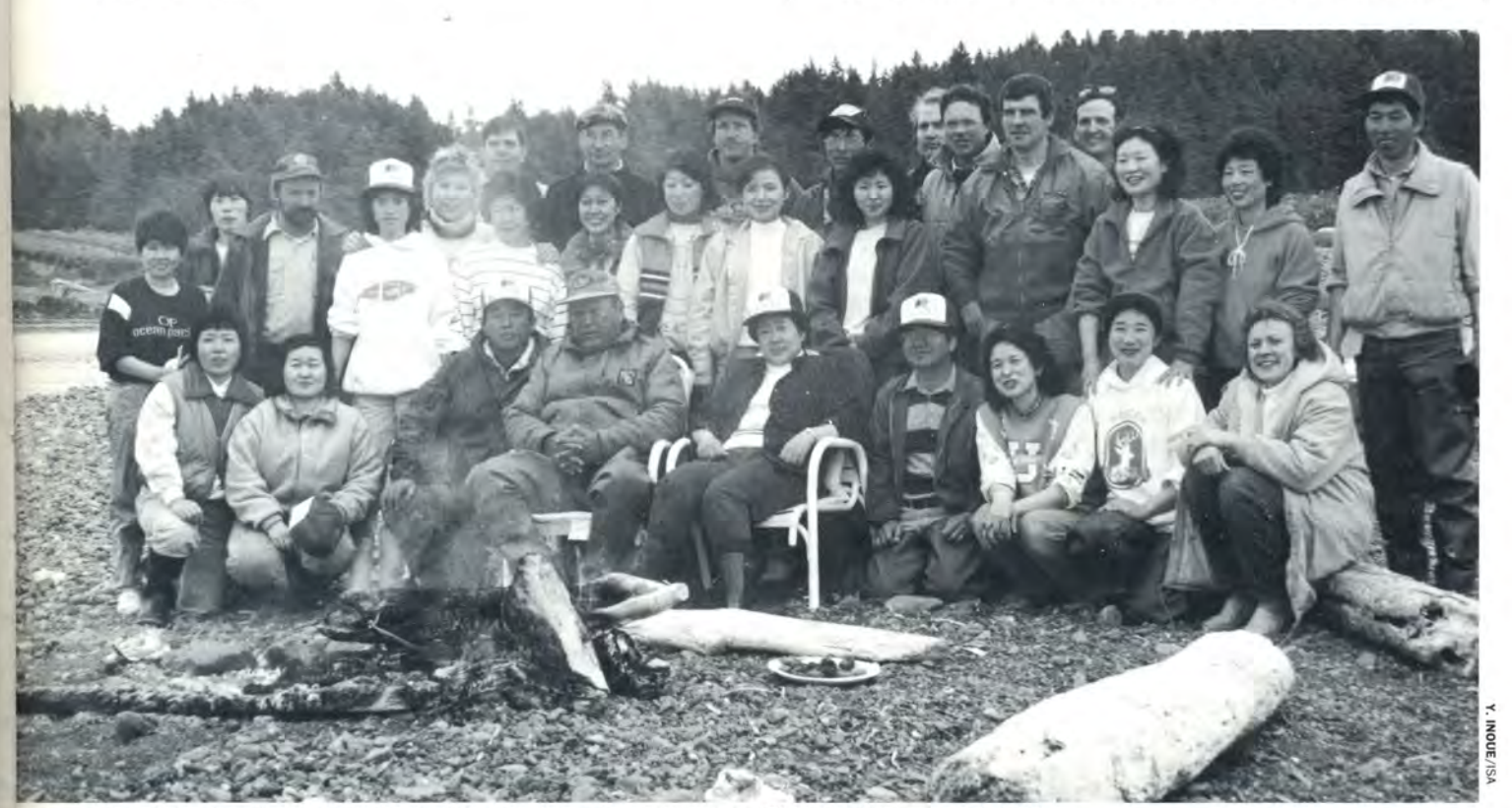
True Parents relaxing with the Kodiak members after fishing near Chiniak, Alaska on July 20th.

The mother saves the money for the sake of the children.