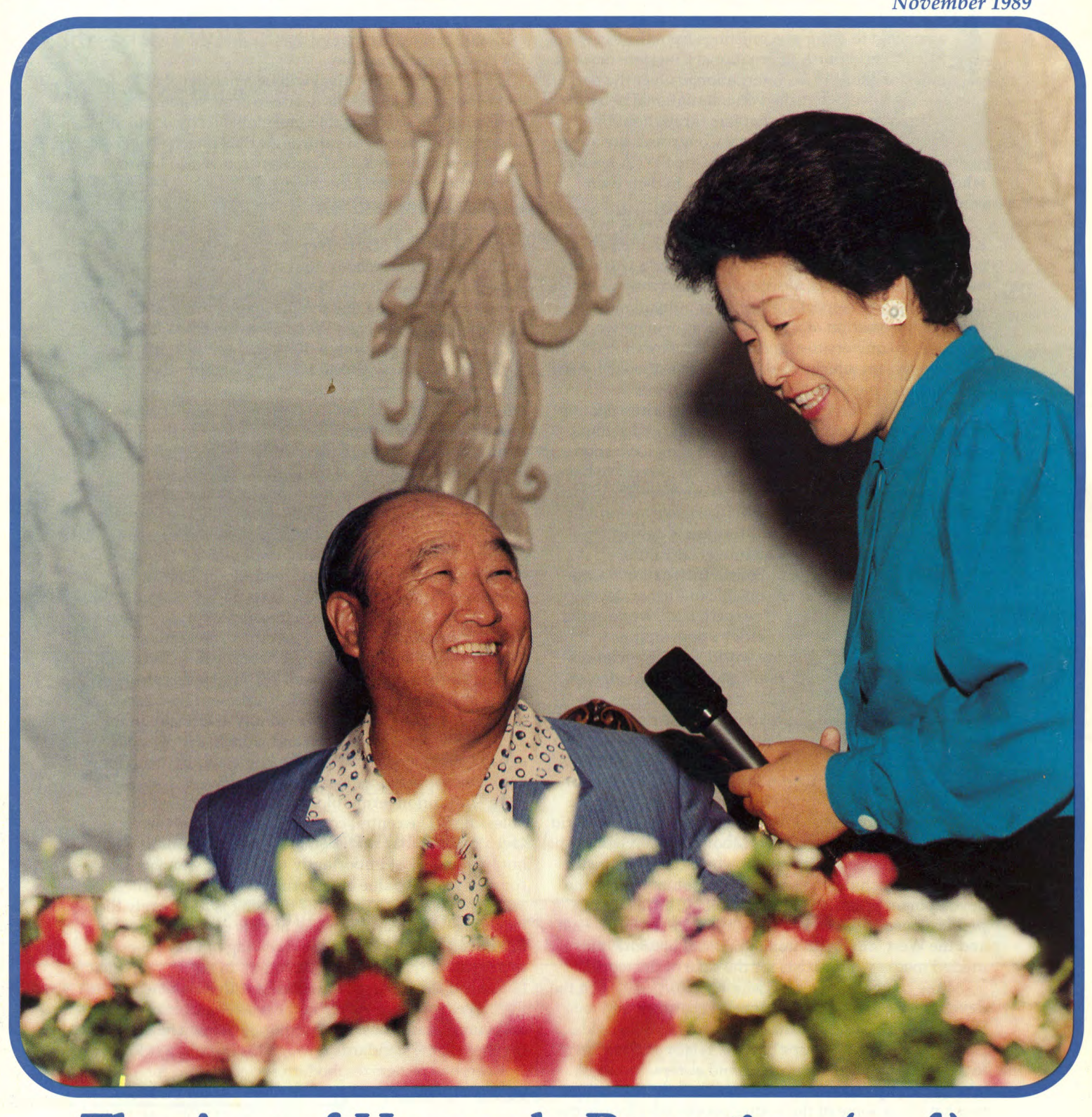
The Age of Heavenly Parentism (p. 4) Religious Youth Service 1989 (P. 24)