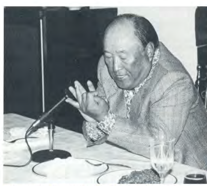
Father explains the meaning of the Pal-chong-shi Ceremony.

nature, ocean and mountains with true love. I go to the ocean for fishing and to the mountains for hunting and loving nature. By doing so, Alaska becomes my domain.