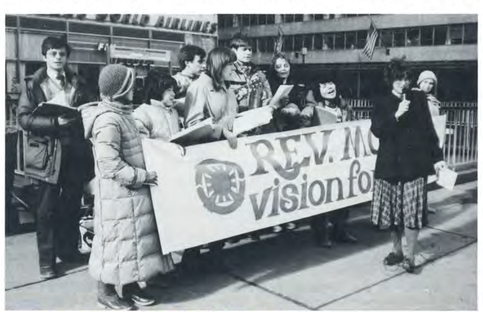
Expressing a true pioneering spirit on an IOWC team.

What is the reason? When many of you first met the church, you may have thought,"Well, it's a great idea to live all together like brothers and sisters. I have been lonely all my life. Even when I was