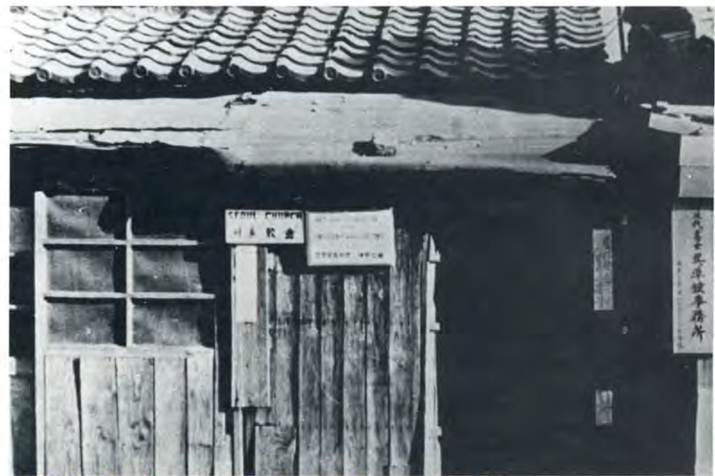
Seoul Unification Church, used from May 1, 1954 to January 17, 1955.

Today we celebrate our founding anniversary—that part has been fulfilled. But no matter how well you are doing,