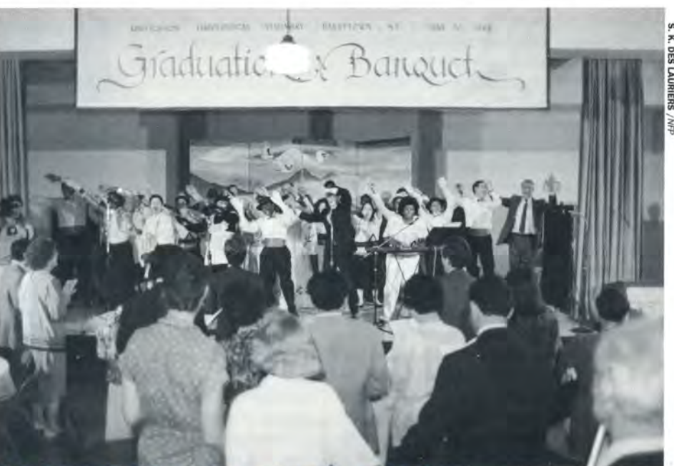
A final ensemble performance by students inspires the audience.