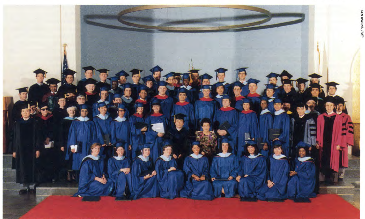
The U.T.S. Graduating Class of 1989.