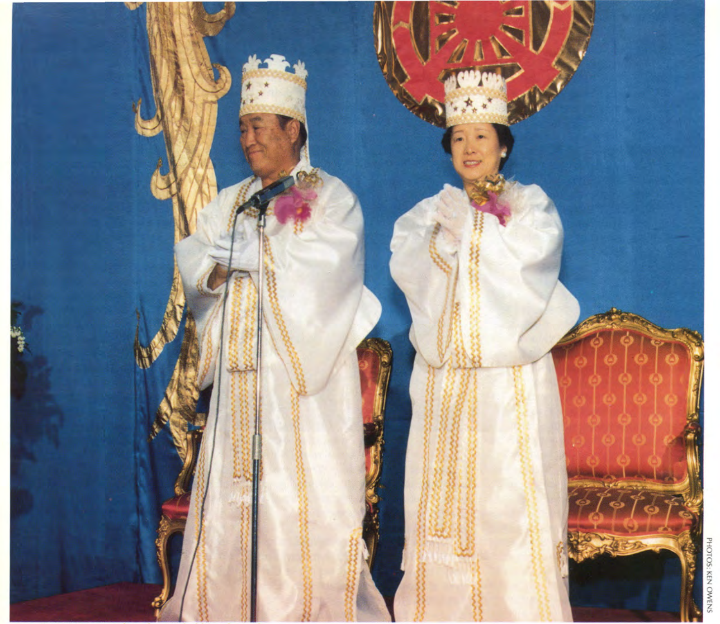
True Parents congratulate the newly blessed couples.