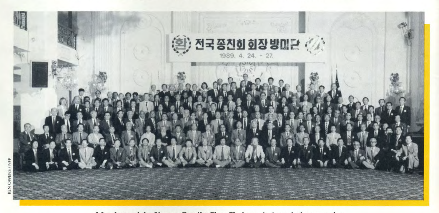
Members of the Korean Family Clan Chairmen's Association pose for a group picture in the Grand Ballroom of the World Mission Center.

The next Today's World issue will present an article on the providential significance of the Korean Family Clan Chairmen's Association's visit to True Parents in America.