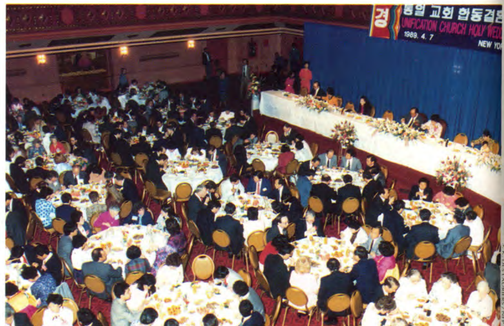
Evening dinner and entertainment for the newly blessed couples.

As the grand finale, Father and Mother came to the stage. It was so touching to see their true give and take as they sang four songs and joyfully danced, inviting everyone to join in. It was such a heavenly atmosphere—I felt Father's tremendous love and desire to give the newly blessed members a substantial taste of heaven, something that they could carry throughout their blessed lives and through any of the challenges they may experience.