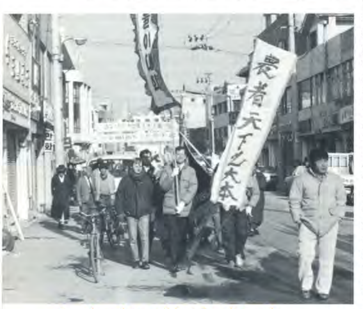
Several members participate in a city parade.

Perhaps my words are a bit premature, but I am seriously dedicated to love you with God's true love. First because we absolutely must not be a source of pain and sorrow to God when He looks upon us. We must live to inspire True Parents, and all our brothers and sisters, by an example of deeply