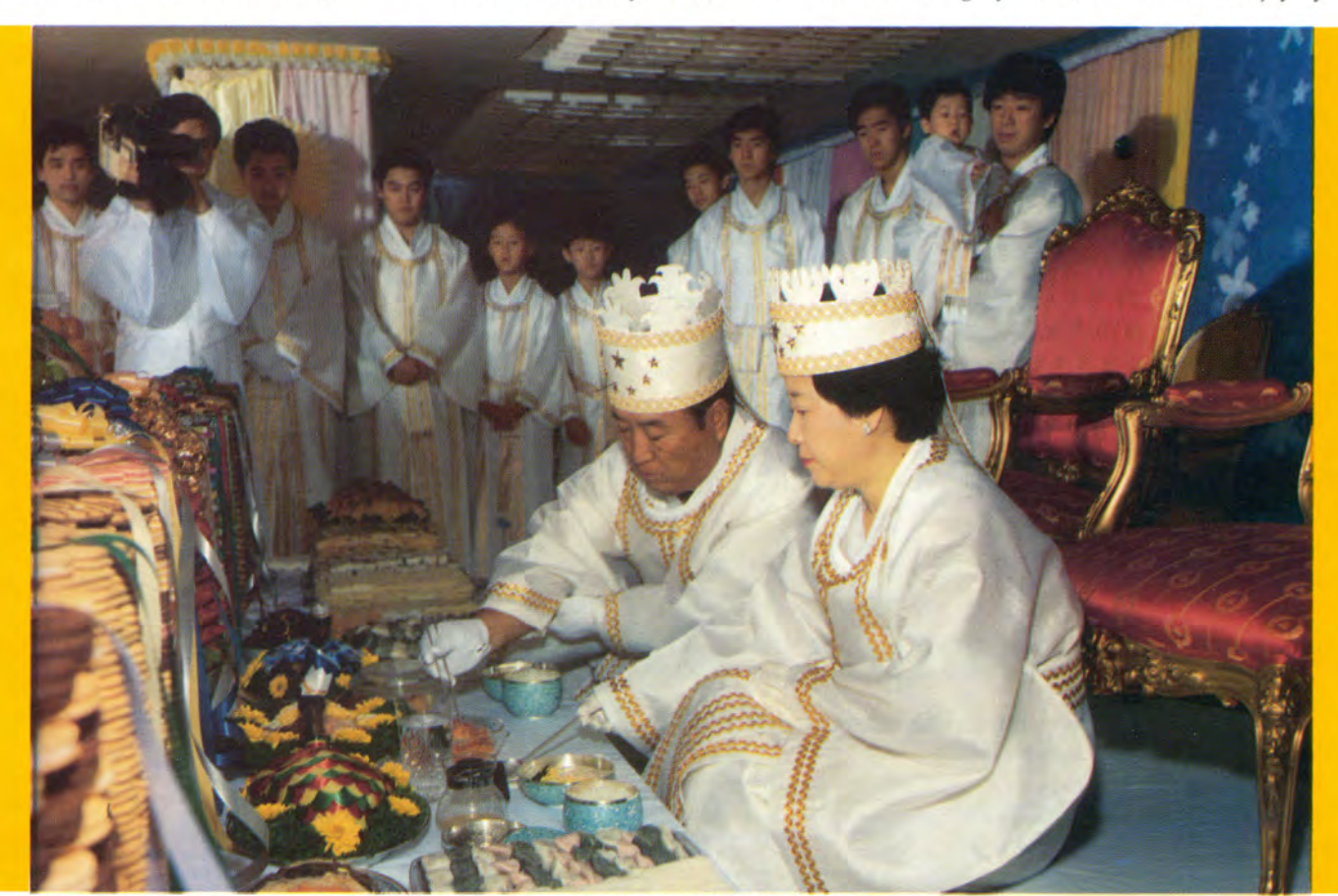
True Parents partake of a specially prepared meal from the Parents' Day offering table.

God is almighty and omnipresent. But what is the one thing that is essential to almighty God? God needs a love relationship with the creation in order to feel joy and stimulation. No matter how almighty He is, God cannot feel joy by