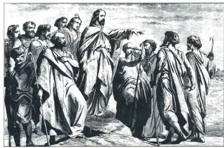
Jesus sending forth the apostles to witness in surrounding towns.

first, "You, Devil, do you agree?" Satan said, "Yes," even though he didn't like it. With this condition God gave permission to Father to give his victory to his