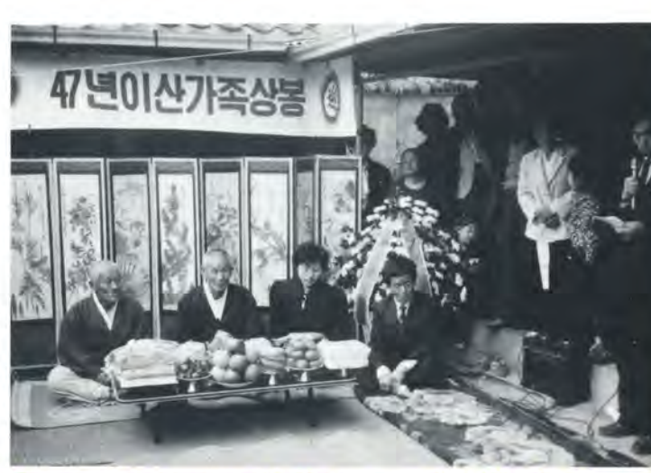
Commemoration ceremony for 47 years separation of North and South Korea.

Noon was lunch time, and in the afternoon we went out getting subscrip-