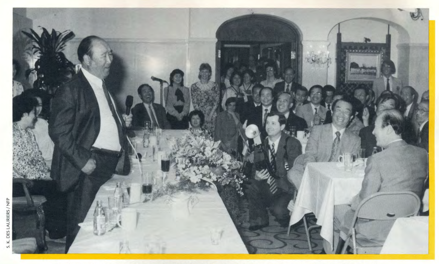
Father addresses the Korean Family Clan Chairmen's Association, creating a warm, family atmosphere at the dinner hosted by True Parents at East Garden on April 25, 1989.