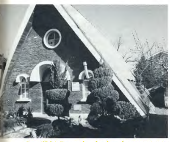
Beautiful A-Frame churches have been constructed around the country.

When the mobilization staff went to a concert in Seoul, we noticed that most