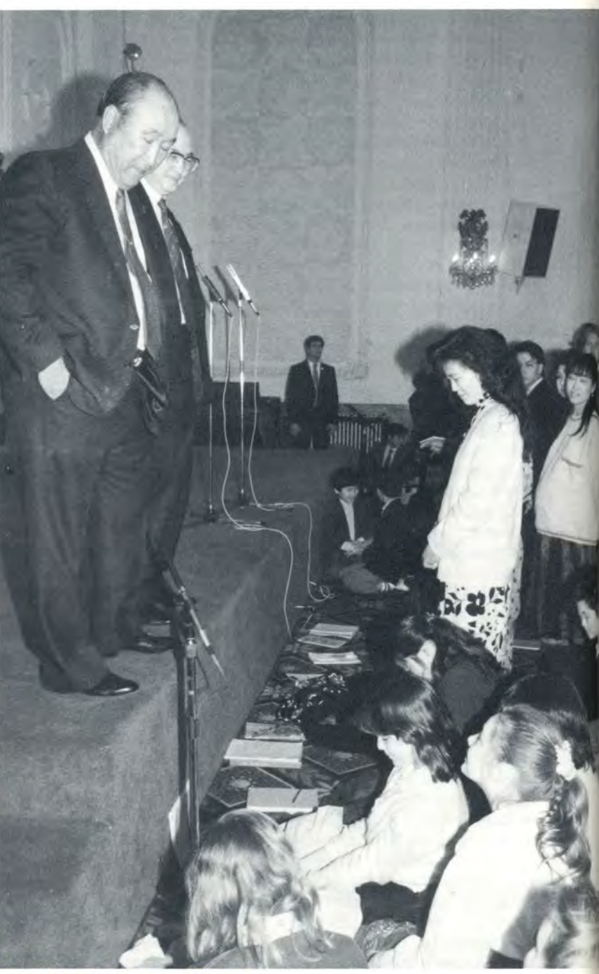
Father speaks to the blessed children.

What is the formula for multiplication? The Blessing is the