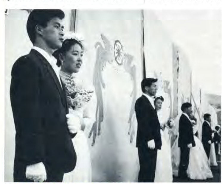
6516 Couples Blessing, October 30, 1988.

I would like to share one thing about the True Family. Father had to always take care of the church members, so most of the time he was absent from his family and home. Even when he was at home, many national leaders came seeking advice from him. Because of this he could not have personal time with his own children. One day Father had a meeting in the New Yorker Hotel, so he had to leave the house late at night. His newborn baby was not yet 40 days old and Father wanted to have time with him. When he was about to leave the house Father spoke to the baby from the front door. Of course the baby couldn't understand, but Father reported to the baby: "I feel very sorry that I can't have time with you. But members are waiting to receive my words, so I have to go there; please understand my situation and forgive me."