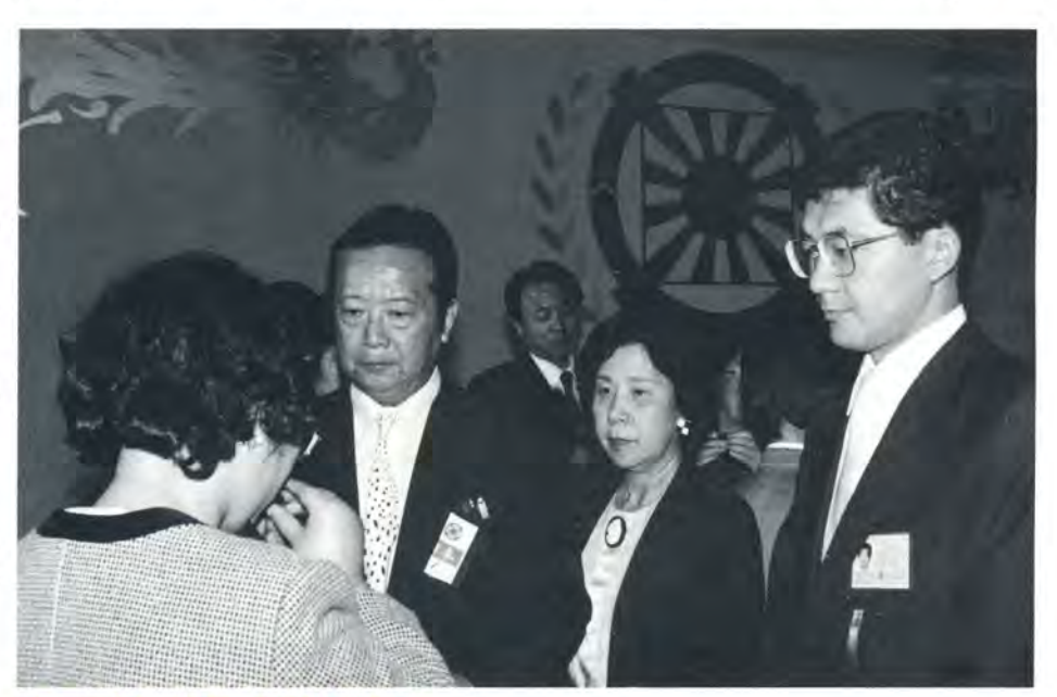
A couple receiving the Holy Wine.

When we receive the Blessing from True Parents, there are four points that we pledge. Only through fulfilling these will our blessing become eternal. The Blessing which God gave to Adam and Eve was also a conditional blessing. The