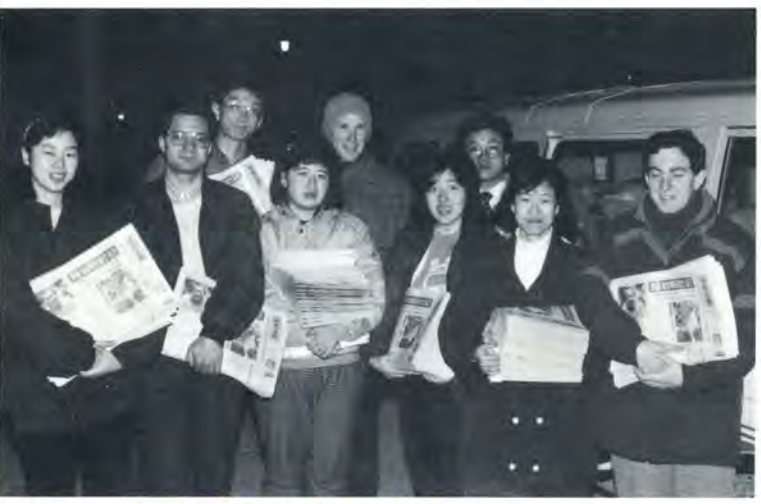
A Segye Ilbo 3 a.m. delivery team.

church elders was in similar situations. She feels responsible