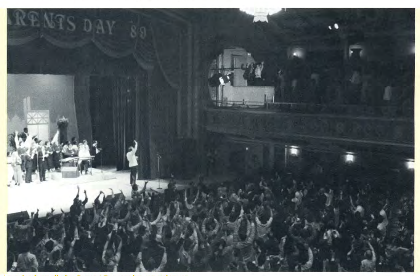
A moving farewell after Parents' Day evening entertainment.

We are truly marching forward. My plan is that every city will be divided into 50 state names. Each blessed couple will belong to one section. We must be noisier than anybody else —noisier than the Mafia, gangsters, drug pushers, and all evildoers. This is how to save the world. Can you do it? This time, let's raise not just two hands but two feet, also. Let us pray.